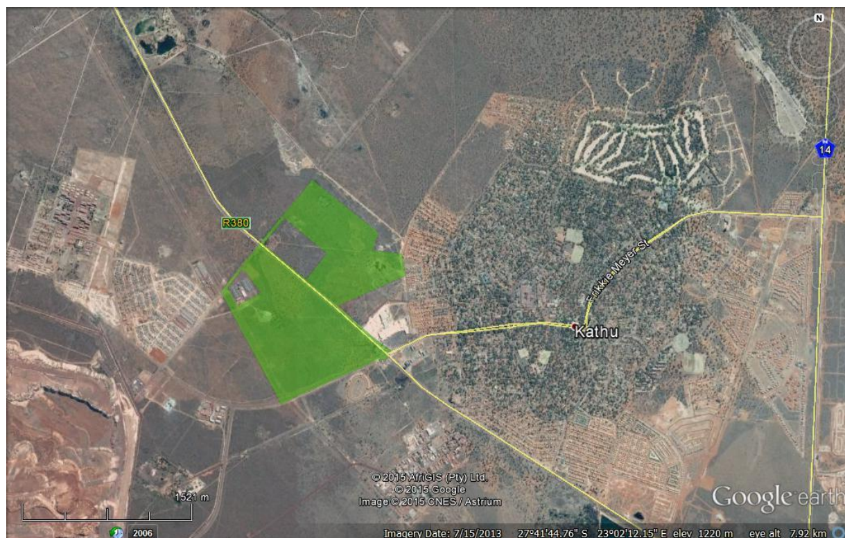
Figure 1: Google Earth image showing the location of the property (green polygon)

The property is undeveloped, but is zoned as Agricultural Zone I in terms of the Gamagara Scheme, indicative of the past agricultural nature thereof. The site is however not being used for agricultures as it has been encroached upon by the urban development of Kathu.