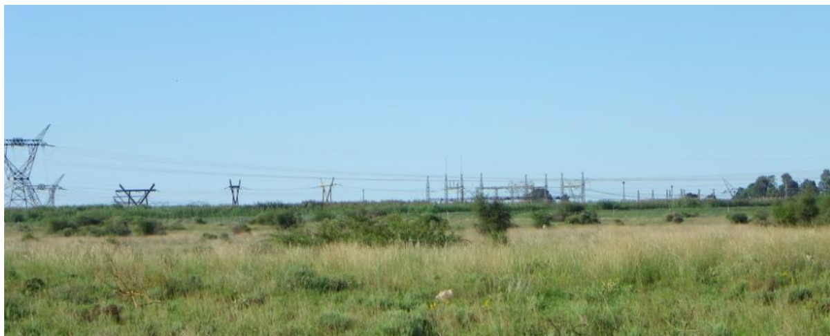
Figure 14 – Residential south as receptor

The residential area is slightly lower than the site. Various infrastructure e.g. the sewage works and Eskom pylons screen the neighbourhood from the site (Figure 14 below). If the units were to be visible, it will be in character with the existing power line infrastructure within the view window of this neighbourhood.