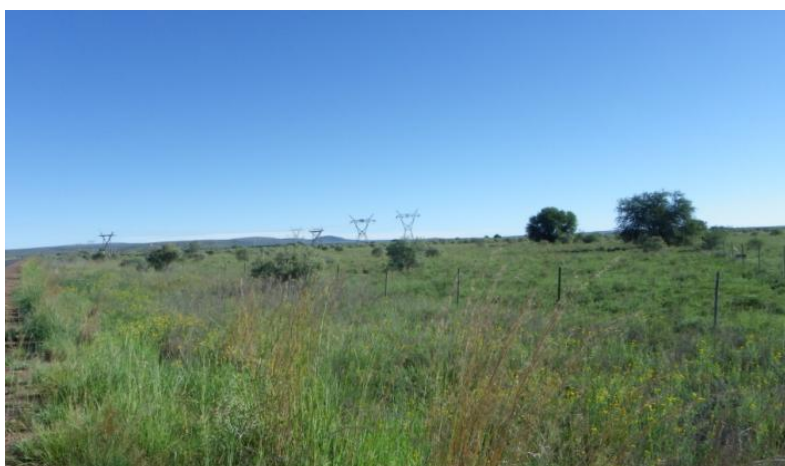
Figure 12 – R31 northbound as receptor

Turning north onto the R31 (Figure 13 below), the traveller becomes aware of the substation only when approximately 2km from the site. From this point the traveller will observe the range of infrastructure and the back of the solar PV array.