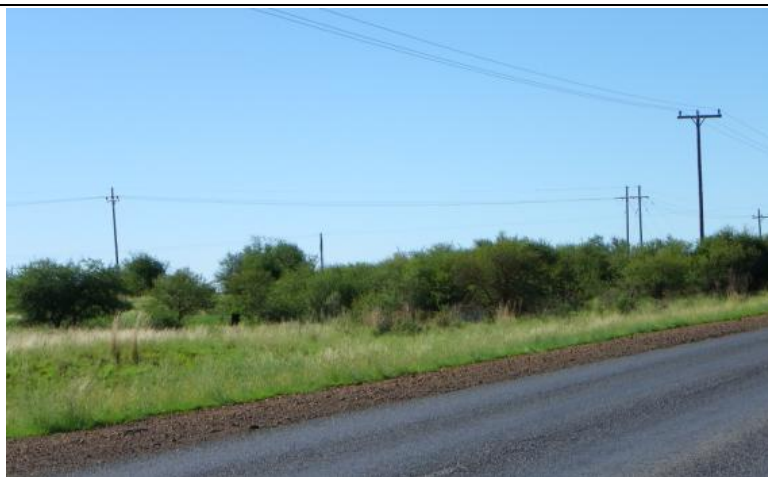
Figure 13 – R31 southbound as a receptor

If any of the boxes marked with an "AN" are ticked, how will this impact / be impacted upon by the proposed activity? Specify and explain: