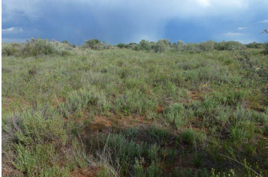
Figure 8 – Photograph across the site, showing minimal slope