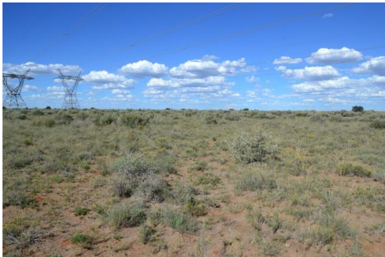
Figure 9 – Land cover of the site with high voltage power lines also in view

soils are predominantly shallow and do not exhibit morphological signs of wetness at depth in the profile due to the dominance of dolomite geology. Rock outcrops and surface rock and limestone occur frequently (Figure 9).