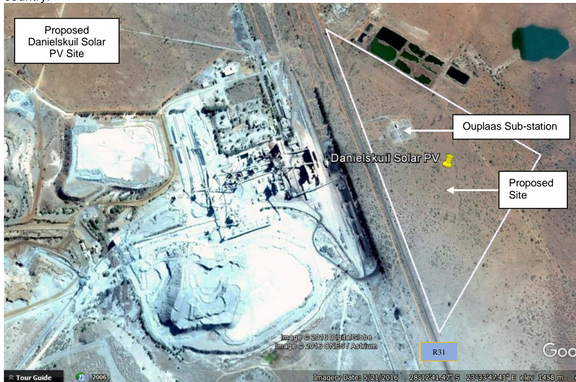
Figure 2: Position of proposed Danielskuil solar PV development

The IRP's long-term electricity planning goal is to consider social, technical, environmental and economic constraints, as well as other externalities while ensuring sustainable development in the country.