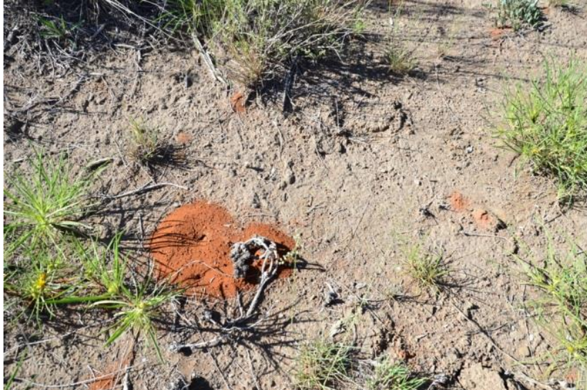
Figure 10 – Grey soil surface due to significant long-term dust deposition with underlying natural red soil having been brought to the surface through ant activity