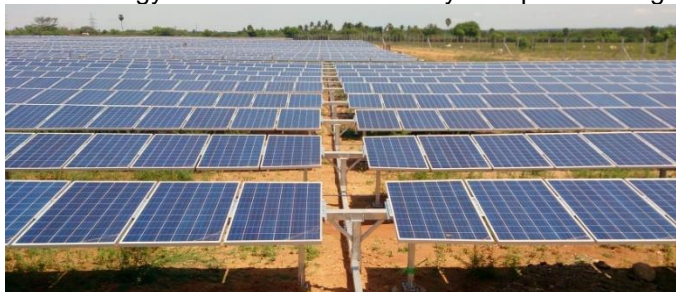
Figure 1: Single axis solar PV module tables raised 500mm above ground level

The project is the establishment of an array of crystalline solar photovoltaic (PV) modules grouped into tables or panels of 20 modules each, together with associated infrastructure for the generation of 5MW of electricity. The PV tables would form an array covering an area of 20ha, surrounded by a perimeter fire access road and fence. The PV tables will be raised approximately 500mm above ground level and have single axis tracking systems allowing maximisation of solar energy harvesting for conversion to electrical energy. A similar solar PV array is depicted in Figure 1 below.