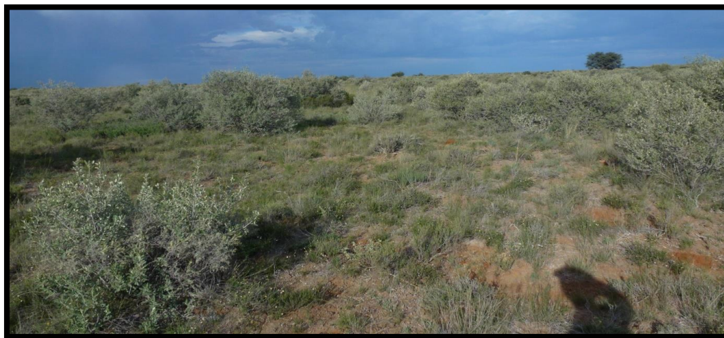
Figure 12 – Natural veld in the study area ( Tarchonanthus camphoratus prominent), with a single Acacia erioloba in the background

The vegetation encountered conforms to that of Ghaap Plateau Vaalbosveld and supported a low shrub/grassy layer (up to 50 cm) with a woody/shrub over layer varying in height from 1-2.5 m (Figure 12). A third tree stratum is sometimes present in the form of Acacia erioloba trees, which could reach up to 4 m in height. The larger study area was fairly uniformly covered by the same vegetation composition. Vegetation cover was between 80-90%.