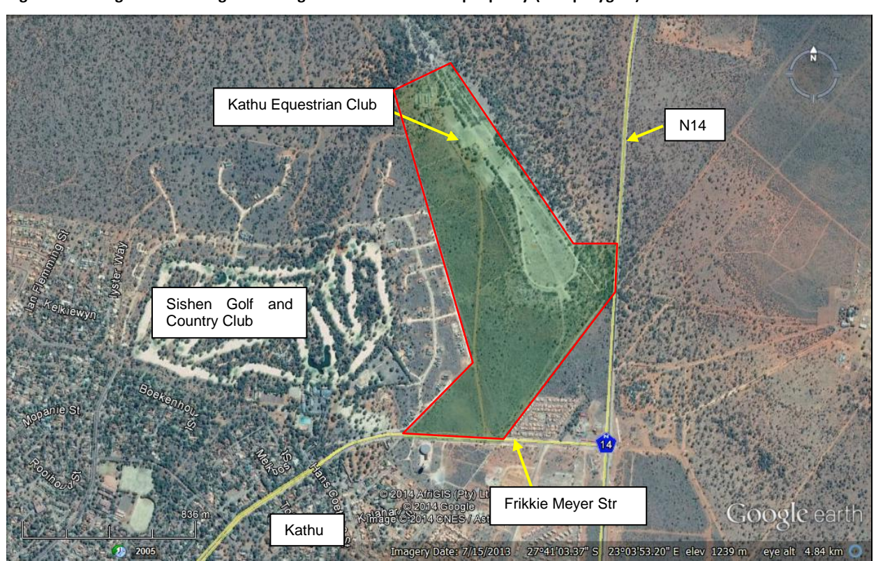
Figure 2: Google Earth image showing the location of the property (red polygon)