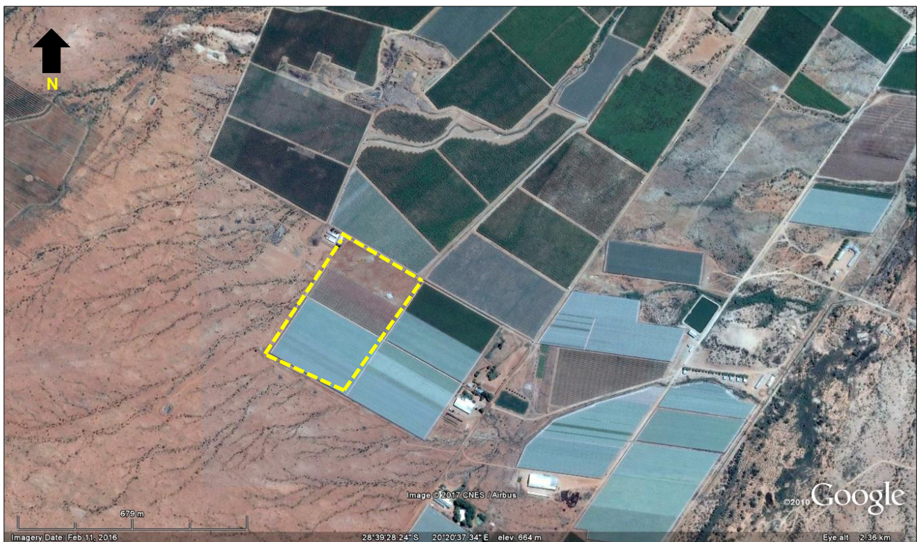
Figure 2. Google earth satellite map indicating the illegal vineyard development (yellow polygon)