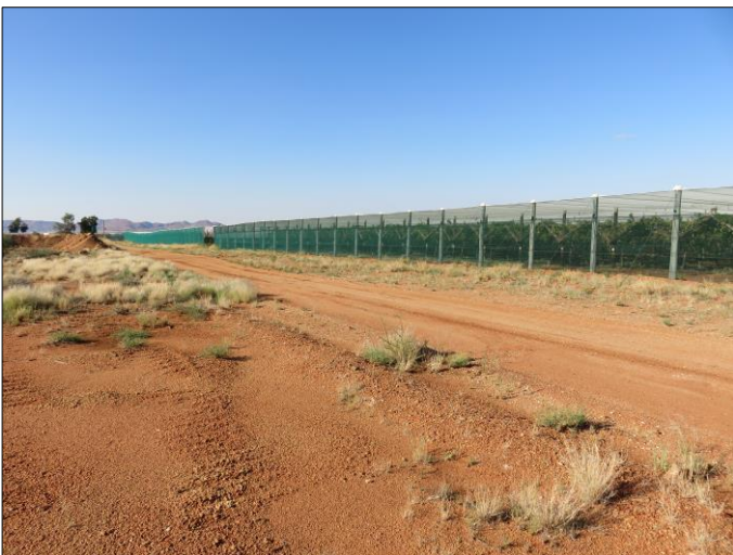
Figure 5. Illegal vineyard development