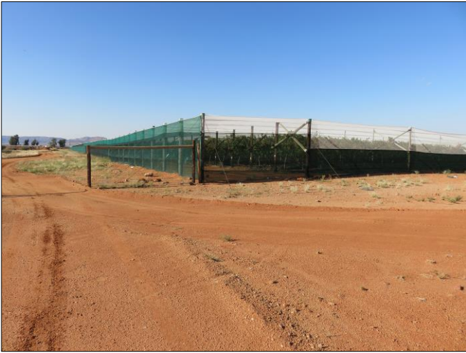
Figure 3. Illegal vineyard development