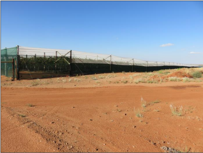
Figure 4. Illegal vineyard development