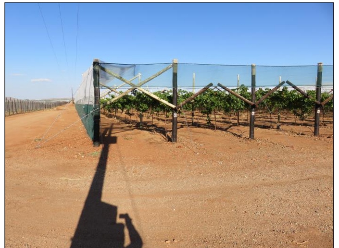
Figure 7. Illegal vineyard development