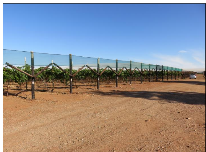
Figure 6. Illegal vineyard development