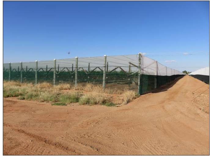
Figure 6. Illegal vineyard development