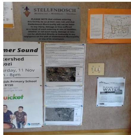
Figure 4: Poster Placed on Stellenbosch Library Notice Board.