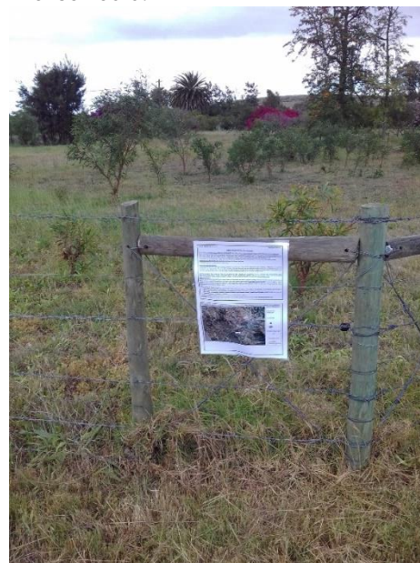
Figure 6: Poster placed opposite the site, along Vlotenburg Road.