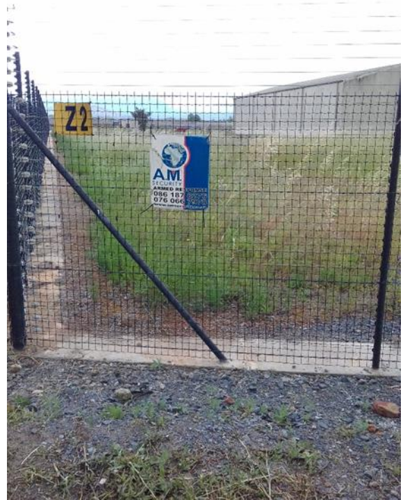
Figure 8: A view of the proposed site.