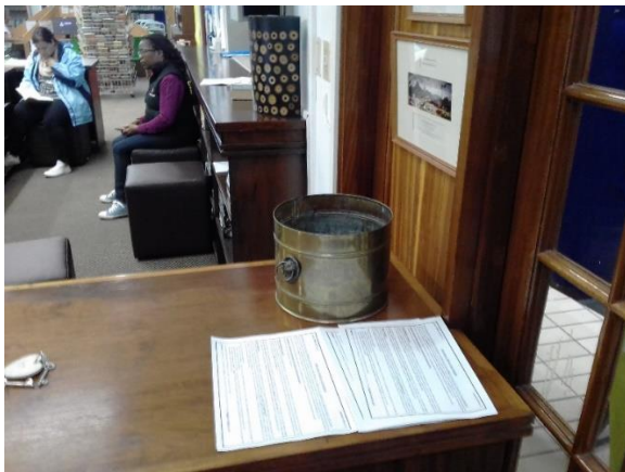
Figure 3: Maildrops placed at Stellenbosch Public Library.