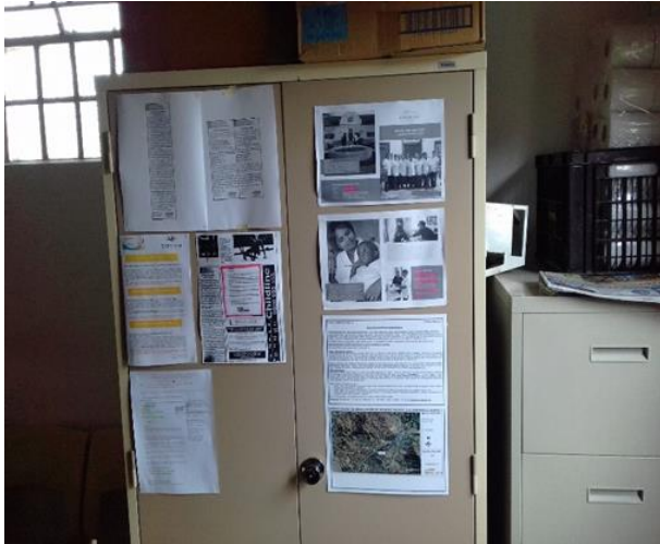
Figure 11: Poster placed at Vlotenburg Primary School.