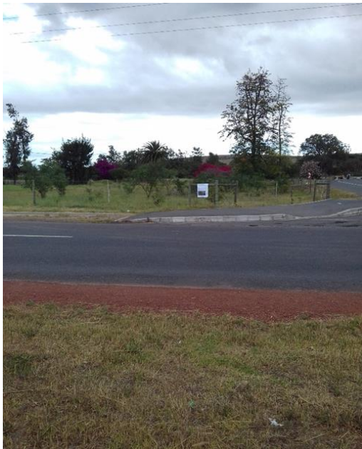
Figure 9: Poster placed at the boundary fence of The Vineyard Christian Fellowship, along Vlotenburg Road as viewed from the site.