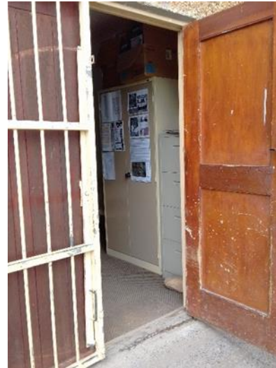
Figure 12: Poster placed at Vlotenburg Primary School.