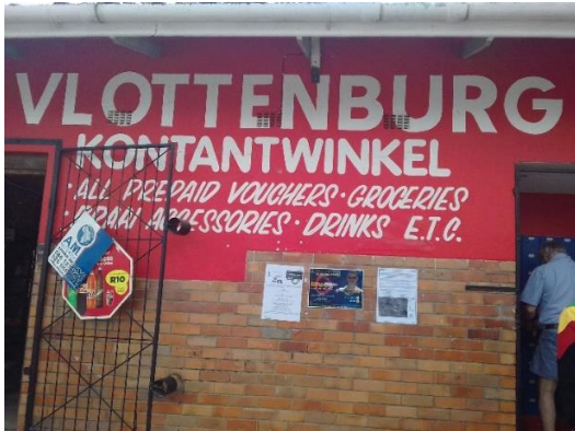
Figure 1: Poster Placed at Vlotenburg Kontant Winkel.