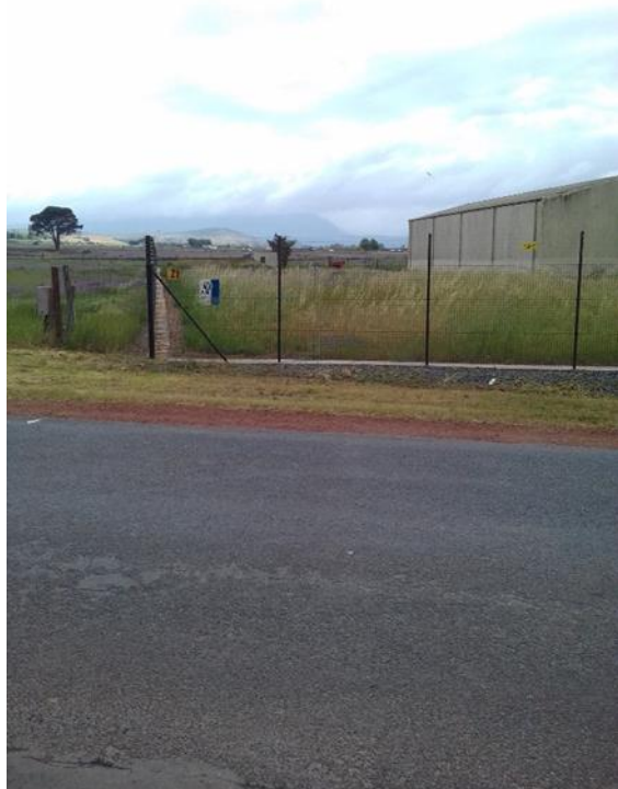
Figure 10: Looking from poster toward the site.