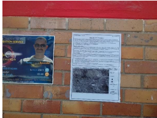
Figure 2: Poster placed at Vlotenburg Kontant Winkel.