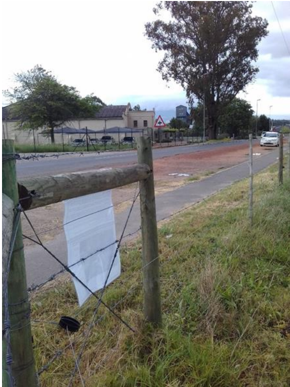
Figure 7: The poster placed opposite that the site along Vlotenburg Road, looking towards Stellenbosch Hills in the background.