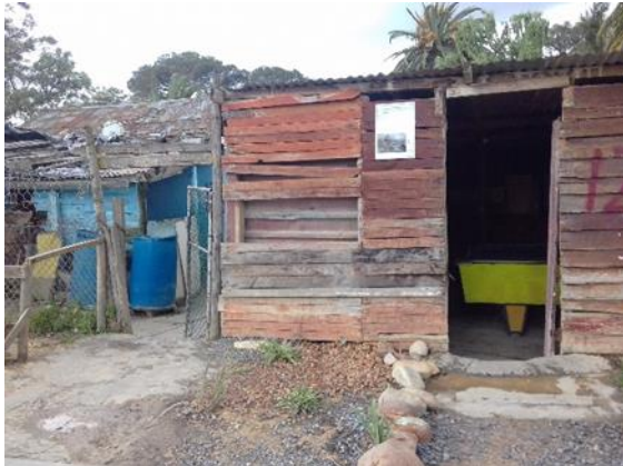
Figure 13: Poster placed at Spaza Shop south of Vlotenburg Primary School.