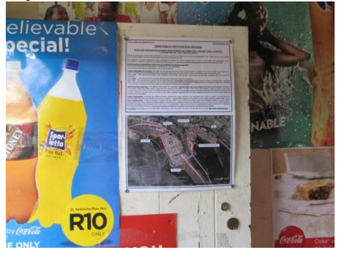
Photo 9: Poster at a café, Van Riet Mobile, also located within La Motte village