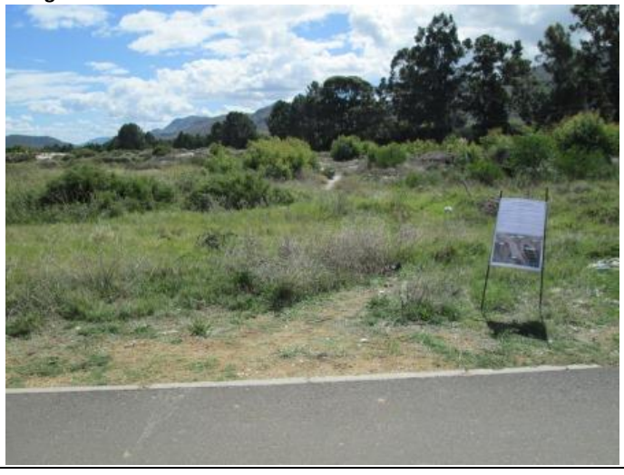
Photo 3: Poster at entrance to the eastern entrance to the TCTA housing.

Photo 1: A2 Poster placed on site boundary, adjacent to la Motte Village