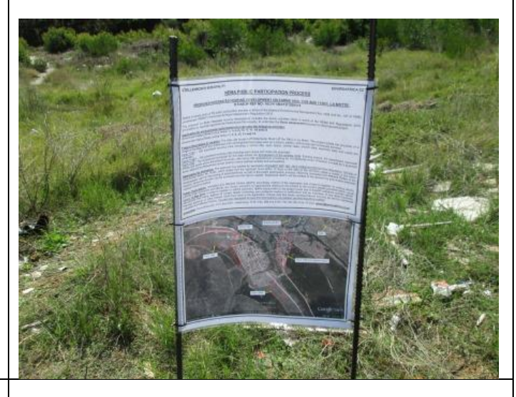
Photo 4: Poster at entrance to the northern entrance to the TCTA housing.

Photo 2: Close-up of poster at site boundary