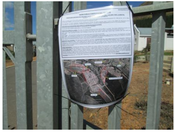
Photo 6: Poster and notification letters at Franschhoek Public Library

Photo 5: Close-up of the poster placed at the northern TCTA entrance