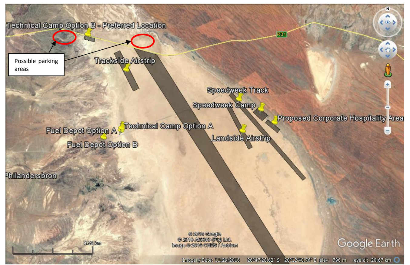
Figure 1: Google Earth image showing the various infrastructure and components of the Bloodhound SSC project (including the various options/alternatives) at Hakskeen Pan.