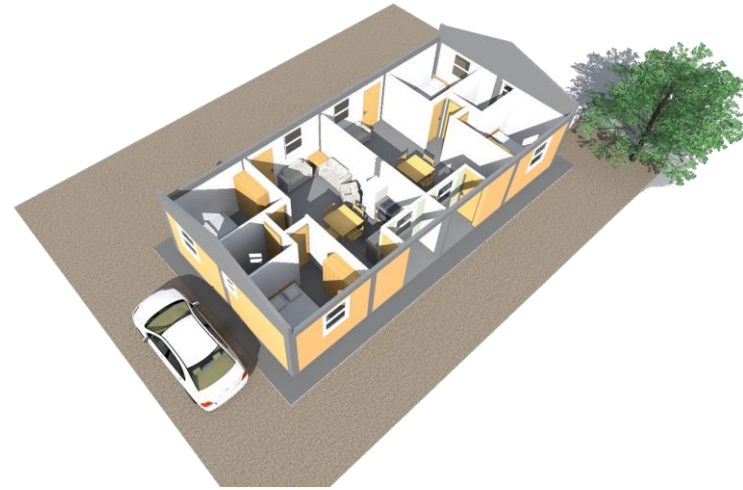
3D VIEW OF INTERIOR