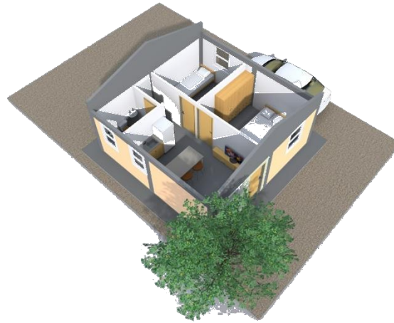
3D VIEW OF INTERIOR