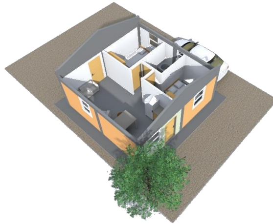
3D VIEW OF INTERIOR