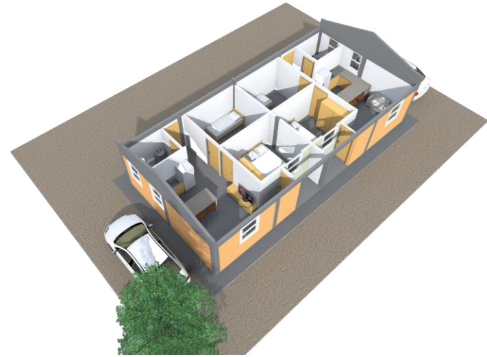
3D VIEW OF INTERIOR