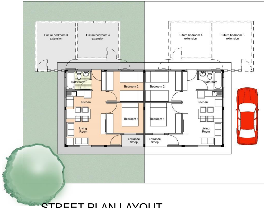
STREET PLAN LAYOUT