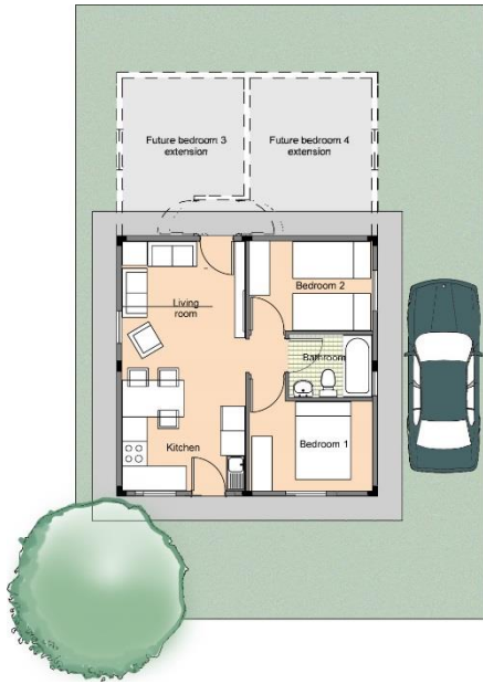
STREET PLAN LAYOUT