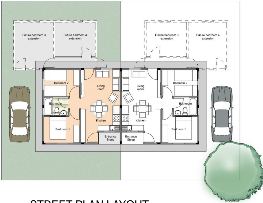
STREET PLAN LAYOUT