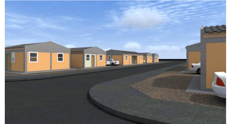
TYPICAL STREET VIEW