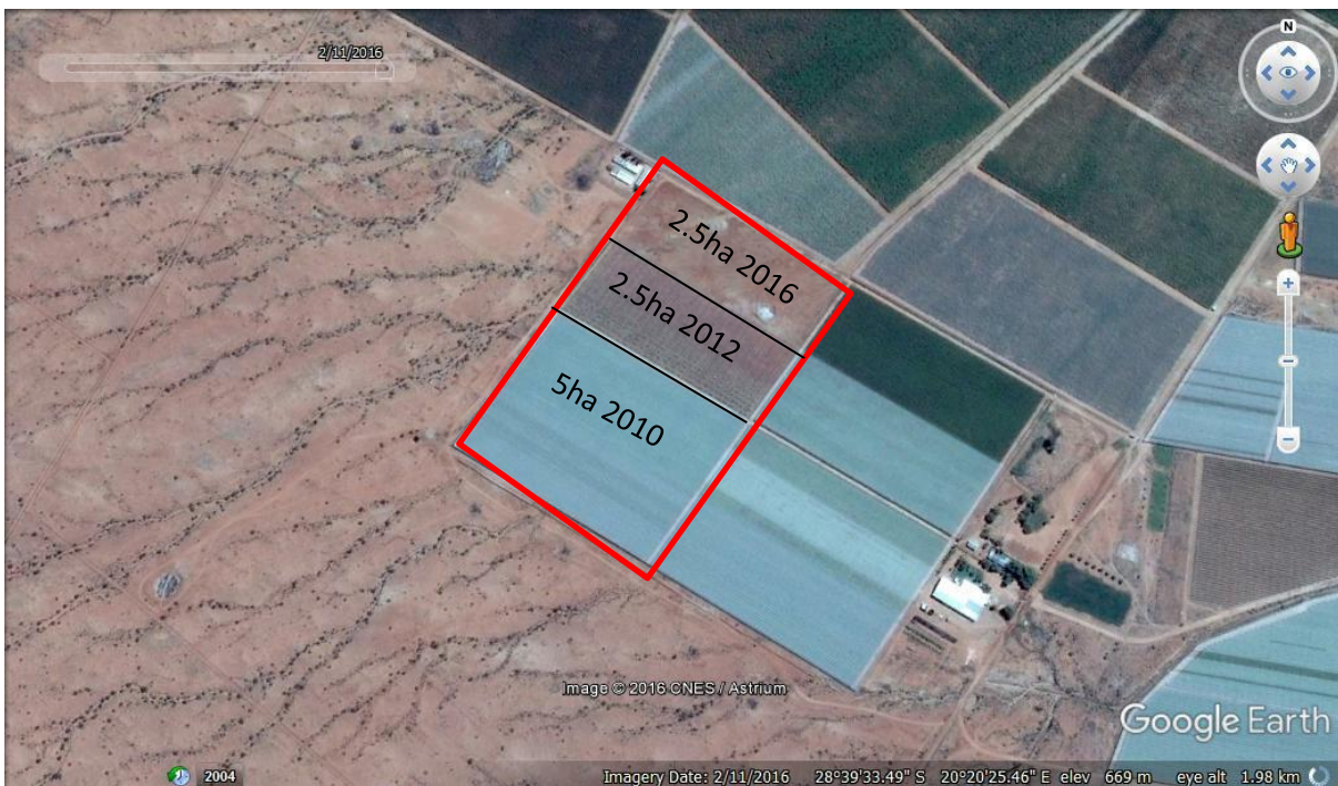
Figure Figure 2: Google Earth aerial photo indicating the affected farm layout and development in each timeframe. The site is indicated by the red rectangle..

The R359 is approximately 2km north-east of the site. Access to the site is gained via existing gravel roads on the farm.