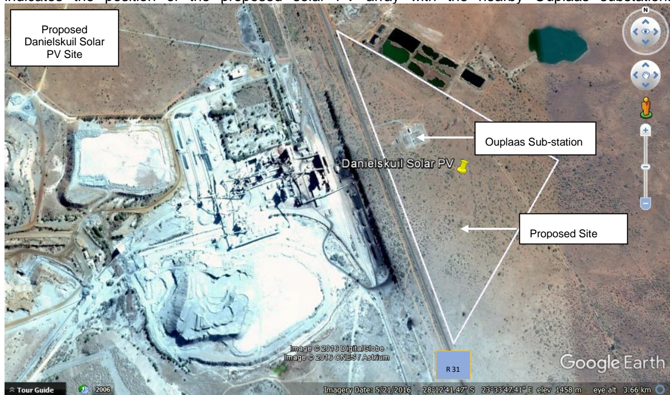
Figure 2: Position of proposed Danielskuil solar PV development

Proposed associated infrastructure includes a fenced construction staging area, a maintenance shed, three inverter-transformer stations on concrete pads, one to two office buildings on the 20ha site, a switch panel for connection to the power grid, as well as a 22kV powerline connection from the proposed development to tie-in to Eskom's Ouplaas substation. These power lines fall within the 20ha development footprint since the site encompasses Eskom's Ouplaas substation. Figure 2 below indicates the position of the proposed solar PV array with the nearby Ouplaas substation.