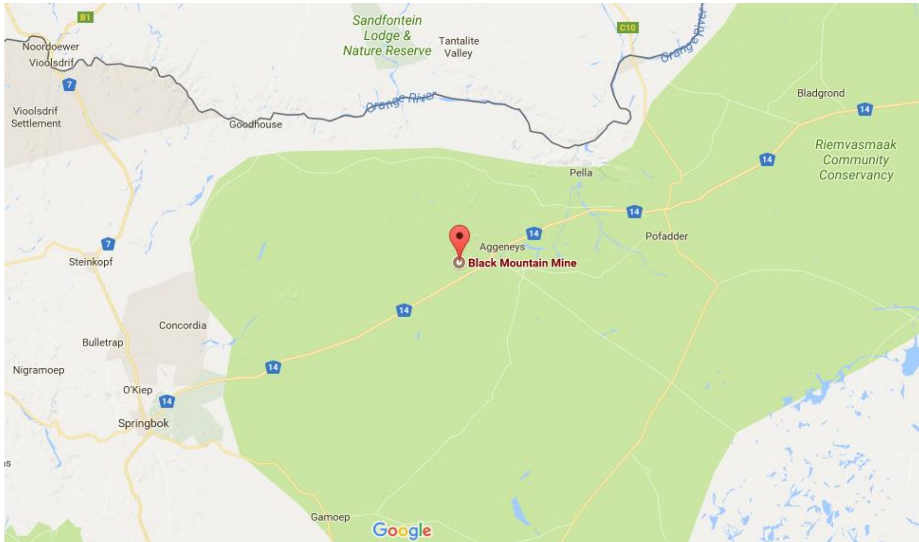
Figure 1: Location of Black Mountain Mine in proximity to other towns