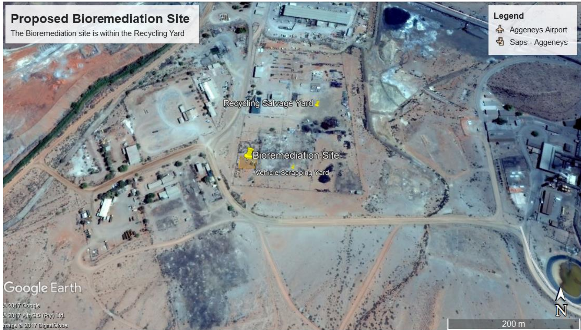
Figure 3: Google image indicating the proposed Bioremediation within the recycling salvage yard, on Black Mountain Mining, Aggeneys