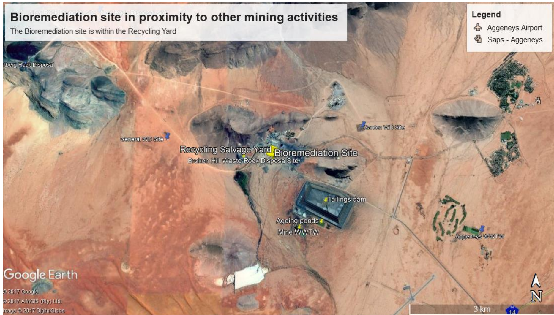
Figure 2: Google image indicating the proposed Bioremediation within the recycling salvage yard, on Black Mountain Mining, Aggeneys