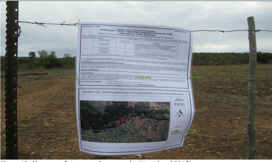
Figure 12: Close- up of poster on Farm van der Wattskraal 394/5