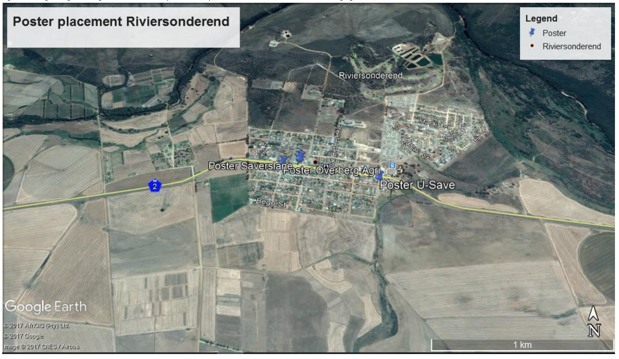
Figure 1: Google image showing the locations where posters were placed at Savers Lane, U Save and Overberg Agri in Riviersonderend