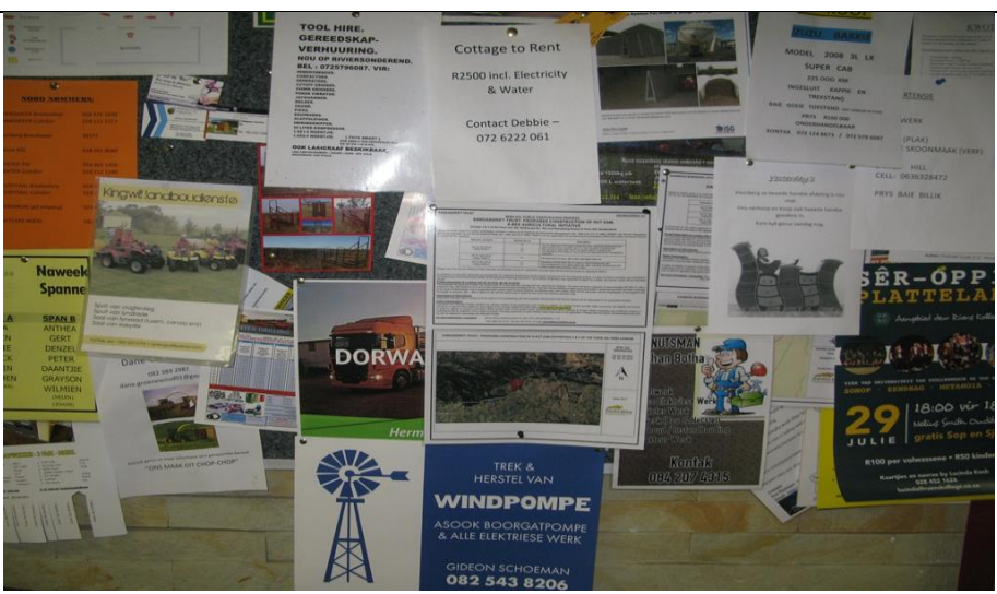
Photo 6: Close-up of the poster placed at Overberg Agri in Riviersonderend