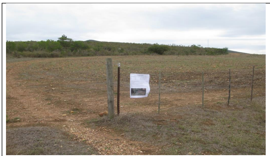
Figure 11: Poster on Farm van der Wattskraal 394/5