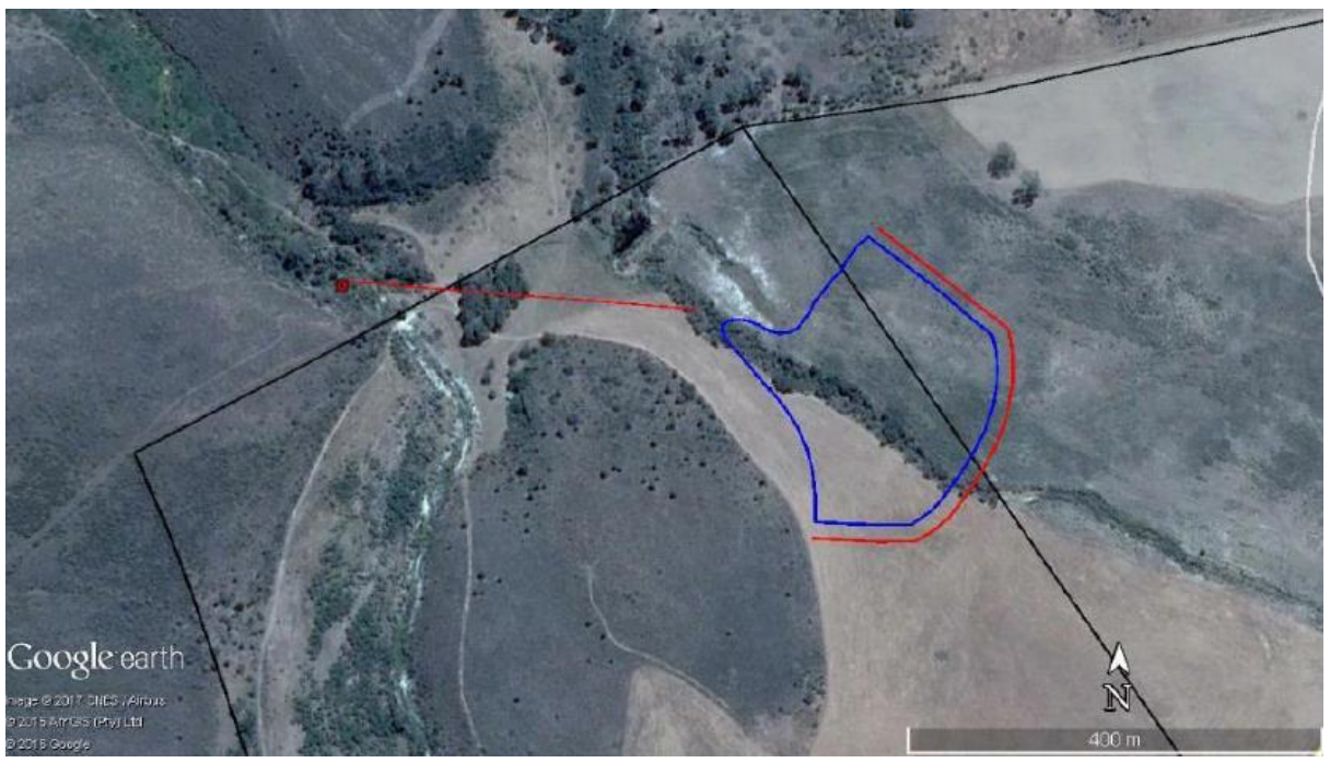
Figure 1: Arial Image of the proposed dam, pipeline and location of the weir