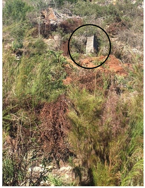
Figure 16: indicating the broken weir