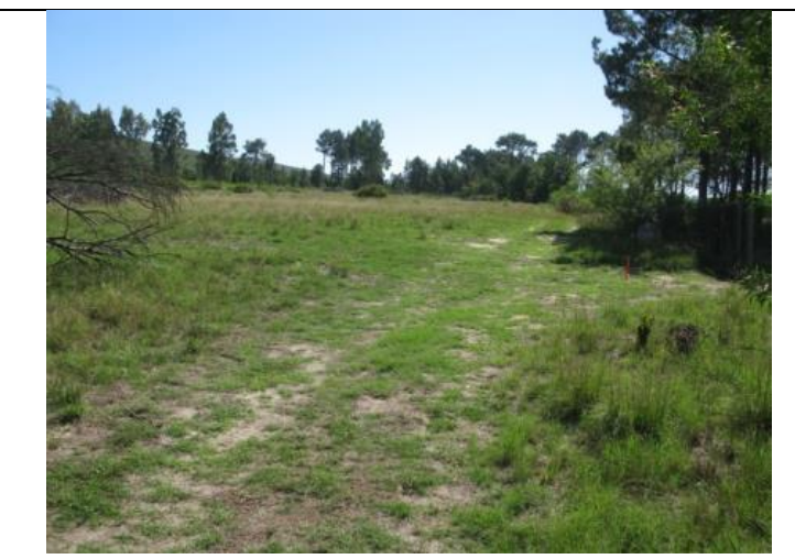
Figure 18: Photo from Botanical specialist (Peet Botes) showing agricultural/ disturbed land to the east of the stream where the rehab of the weir is proposed.