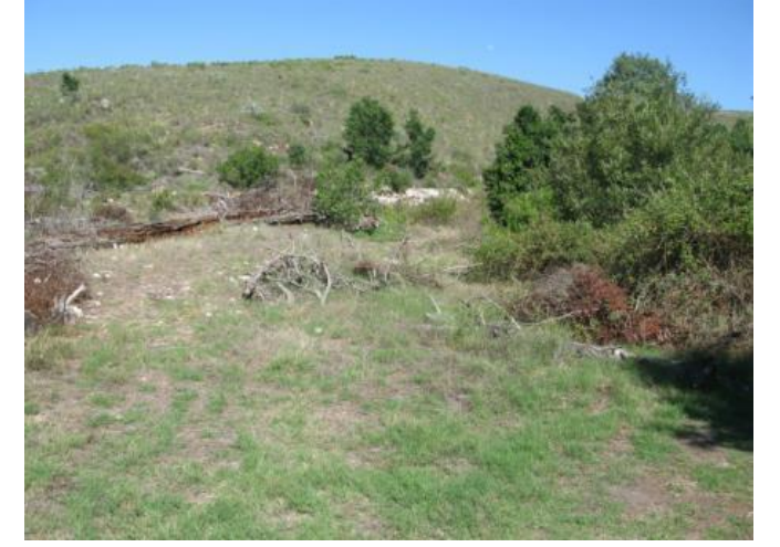
Figure 17: Photo from Botanical specialist (Peet Botes) indicating disturbed areas on the eastern banks of the stream where the rehab of the weir is proposed which can be used for the parking/ working area near the weir.