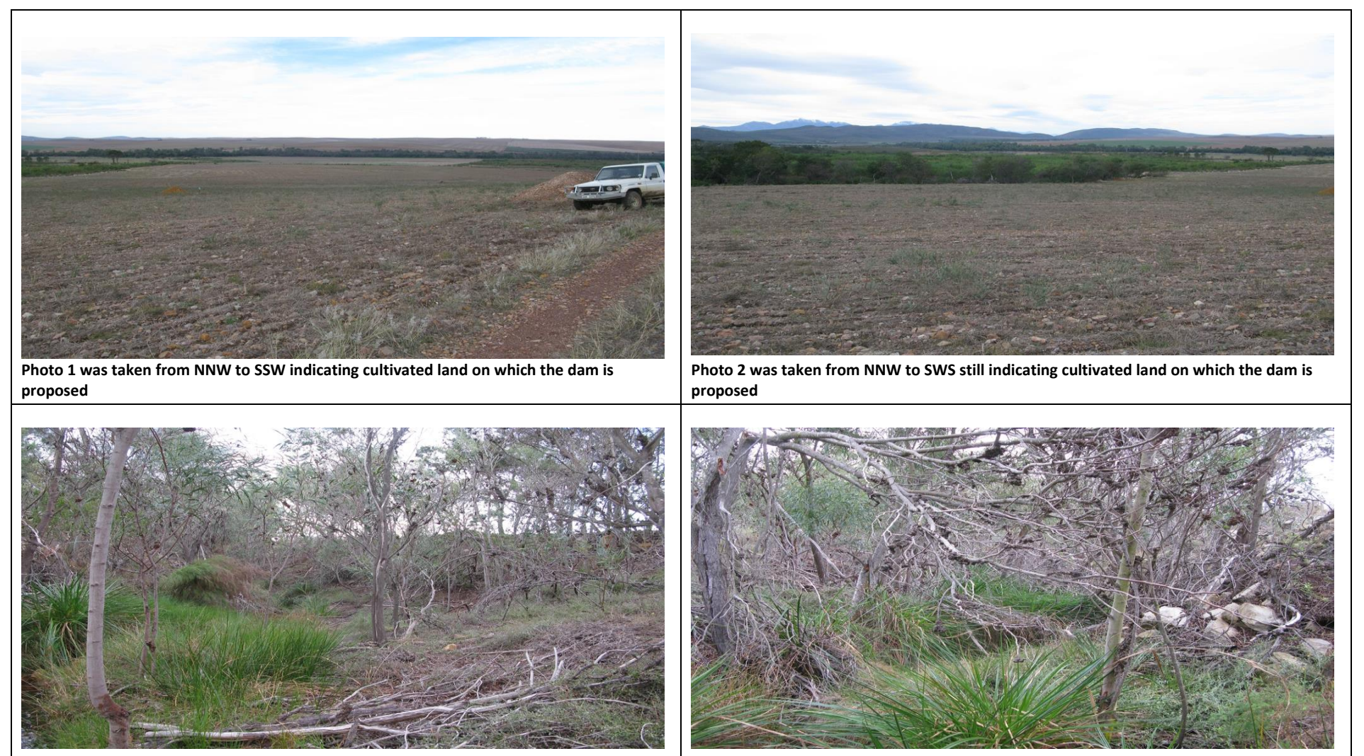
Photo 3 was taken from the centre of the site showing the seasonal stream, facing SE