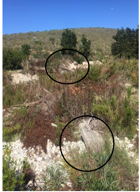
Figure 15 indicating the broken weir