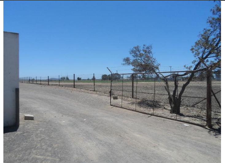
Figure 4: A view of the proposed site access road and gate. Nieuwoudtville Sportsgrounds in the background.