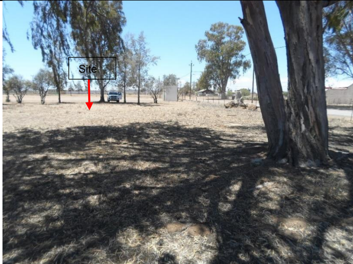
Figure 3: A view of the proposed site (red arrow), looking in an eastern direction. No vegetation on site.