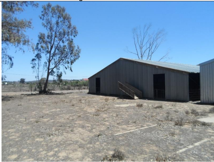
Figure 5: The site has no natural vegetation and is completely transformed from its natural state.