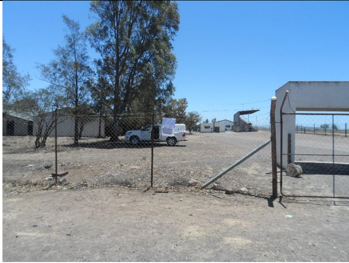
Figure 1: Entrance gate to the site as viewed from an unknown road, looking north towards the sportsgrounds.