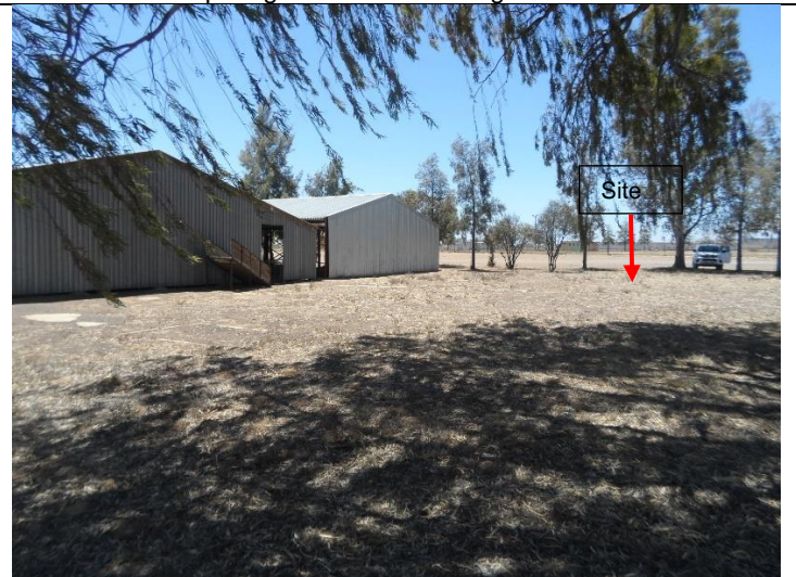
Figure 6: A view of the proposed site (red arrow), looking in a north-eastern direction. The site is totally transformed.