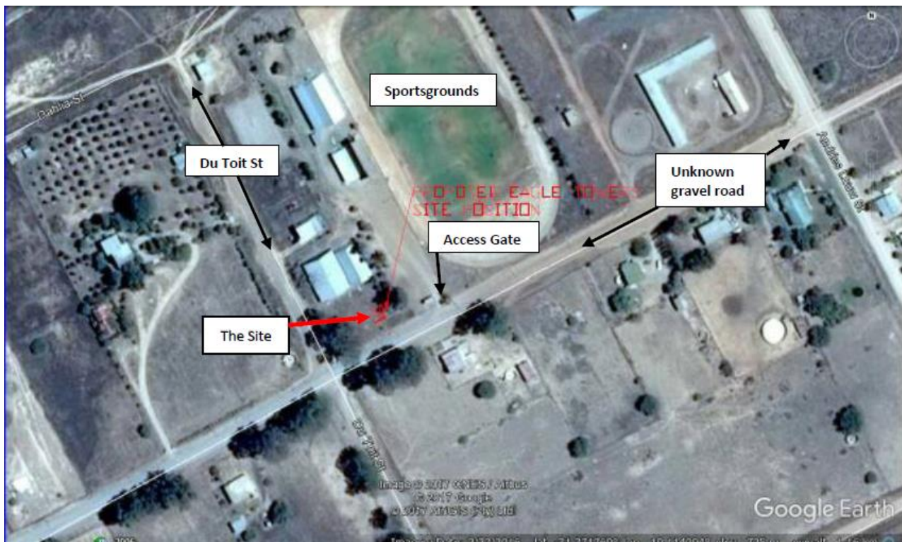
Figure 2: Google Earth Aerial view of the proposed site and its surroundings.