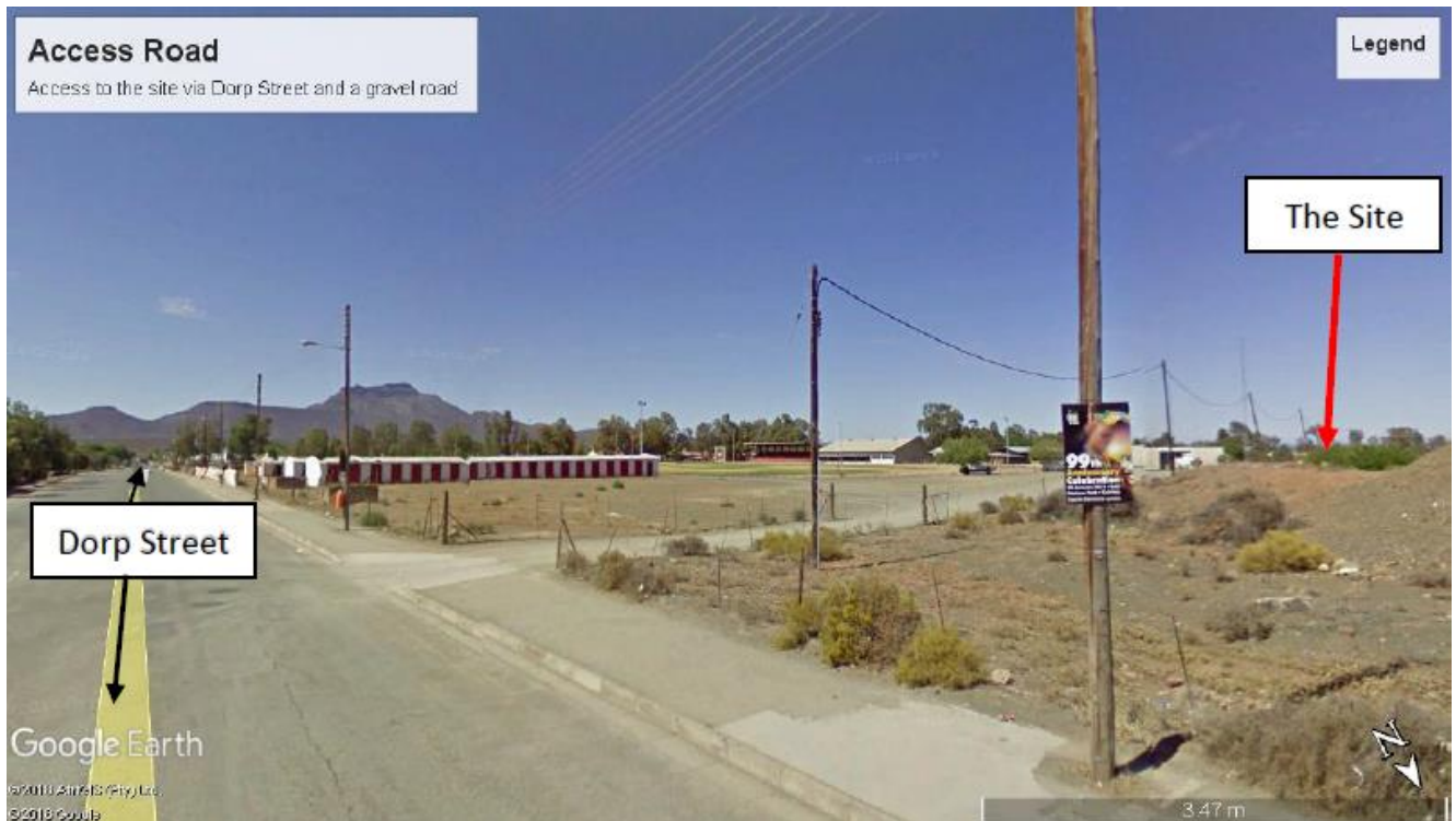
Figure 2: Google Earth street view of the accessed road for the proposed site (red arrow).