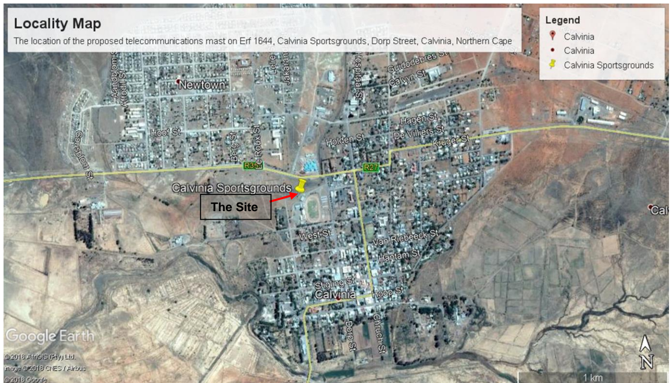
Figure 1: Google Earth view of the site location.

According to SANBI BGIS, the site would historically have contained Bokkeveld Sandstone Fynbos which is listed as “ vulnerable ” on the National Environmental Management: Biodiversity Act (Act No. 10 of 2004) Final Summary of Listed Ecosystems (GN 34809 – 09 December 2011).