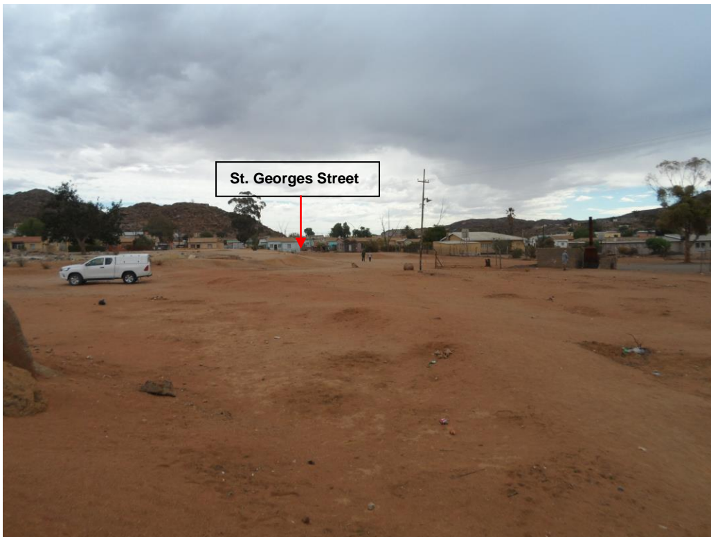
Figure 2: Google Earth street view of the accessed road for the proposed site.