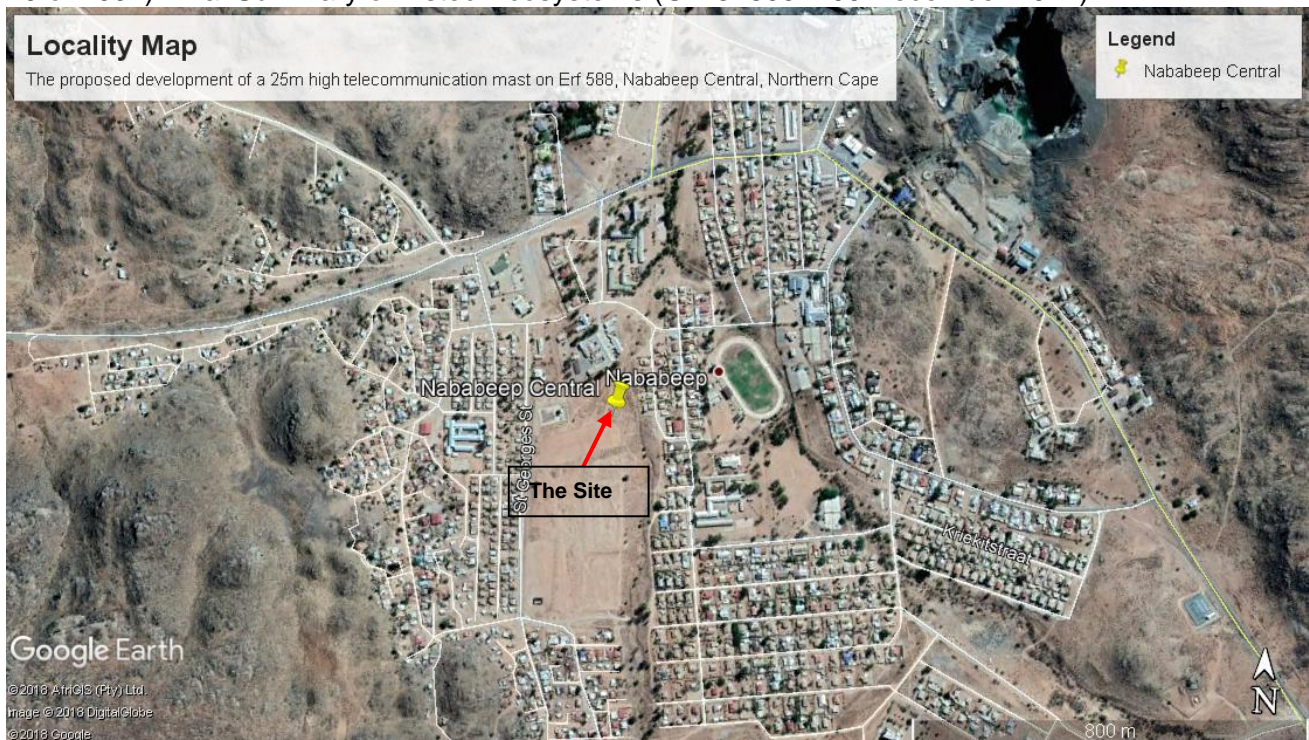
Figure 1: Google Earth view of the site location.

According to SANBI BGIS, the site would historically have contained Namaqualand Klipkoppe Shrubland ( Least Threatened ) on the National Environmental Management: Biodiversity Act (Act No. 10 of 2004) Final Summary of Listed Ecosystems (GN 34809 – 09 December 2011).