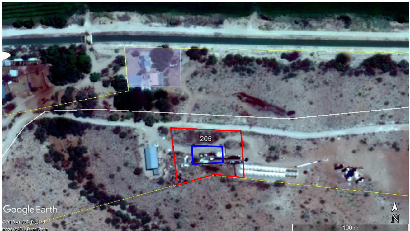
Figure 2: Google Earth Aerial view of the site. The Portion of Erf 205 that will be developed for the abattoir is depicted by the red polygon, with the approximate location of the development footprint of the abattoir depicted in the blue polygon. Erf 205 is indicated by the yellow polygon.