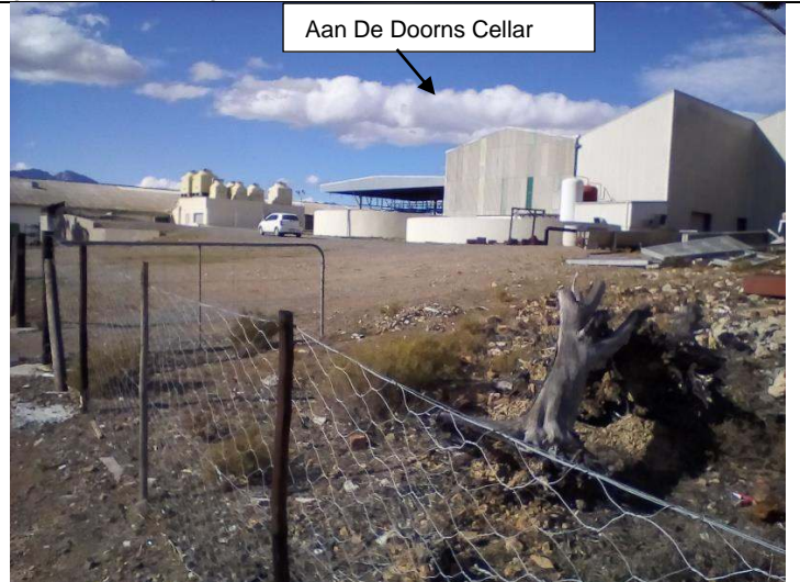
Figure 4: A view of wine cellar located south-east of the site. Looking in an eastern direction.