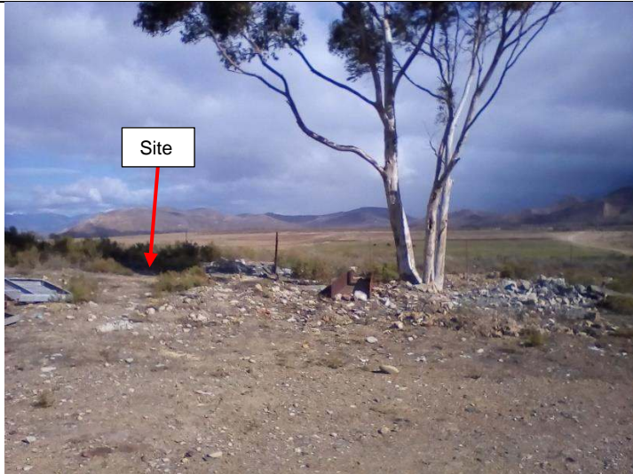
Figure 1: A view of the site (red arrow), located adjacent to a blue gum tree. Looking in a western direction.