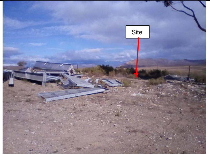
Figure 2: A view of the site (red arrow), located adjacent to a blue gum tree. Looking in a south-western direction.