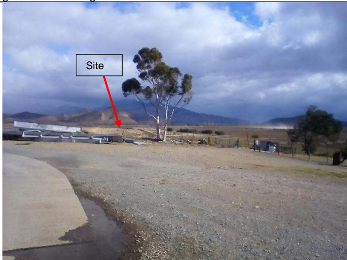
Figure 5: A view of the site (red arrow) as viewed from the wine cellar. Looking in a western direction.