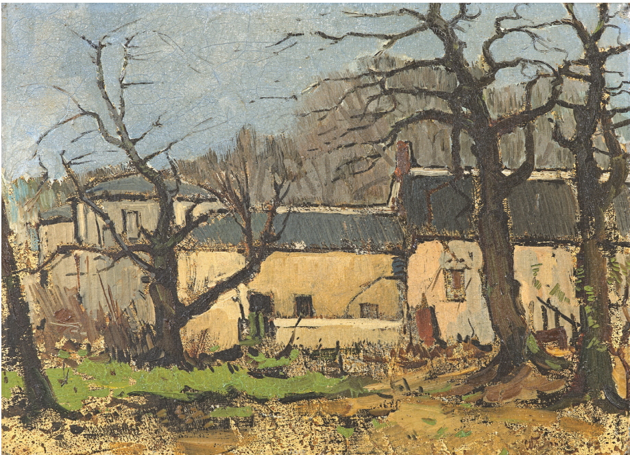
Pieter Wenning, The Yellow House (Bishopscourt in Winter) R500 000 - 700 000 from The Labia Family Trust

PLETTENBERG BAY – The Plettenberg, Look-out Rocks, 40 Church Street Monday 25 June 2018, 10am to 4pm R20 per item. Proceeds will be donated to the Sabrina Love Foundation. Invitation to a Lecture at 6pm: Understanding Market Trends: An exploration of recent decorative arts and painting sales at auction KNYSNA – Cearn Hall, Hall Street, Leisure Isle Tuesday 26 June 2018, 11.30am to 2.30pm R20 per item. Proceeds will be donated to the Friends of the Knysna Library. For a confidential and obligation-free appointment contact 021 683 6560 | ct@straussart.co.za We are currently accepting consignments for our October 2018 auction in Cape Town. www.straussart.co.za