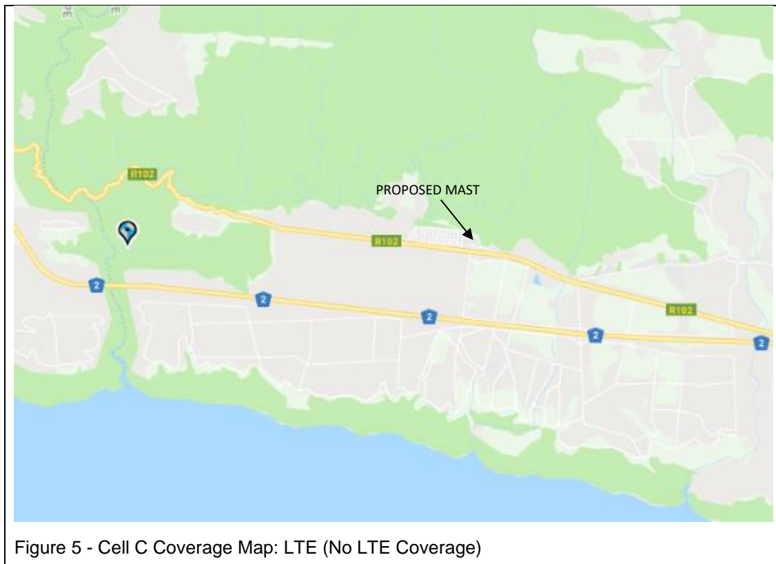
Figure 5 - Cell C Coverage Map: LTE (No LTE Coverage)

Indicate any benefits that the activity will have for society in general: