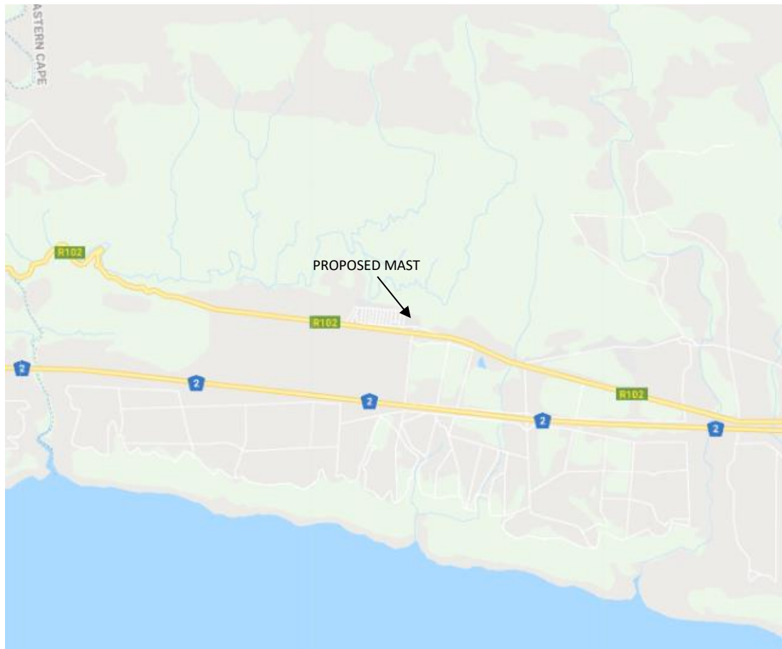
Figure 2 - Telkom Mobile Coverage Map: LTE (No coverage)

The increase in network strength brought by the proposed mast will aid the local businesses and can unlock growth potential which will have a positive economic impact. Residents, businesses and commuters will have a more secure connection to emergency services and armed response which will have a huge social impact.