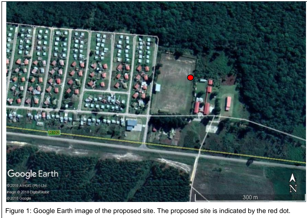
Figure 1: Google Earth image of the proposed site. The proposed site is indicated by the red dot.