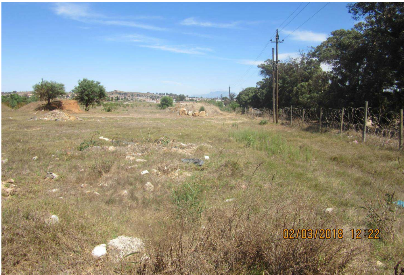
Photo 5 – View of the site looking west. The proposed site is covered with kikuyu grass and is in a degraded state due to past agricultural activities on the property.