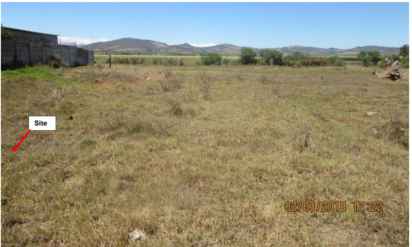
Photo 2 – View of the site looking south. The site is surrounded by agricultural land uses to the south.