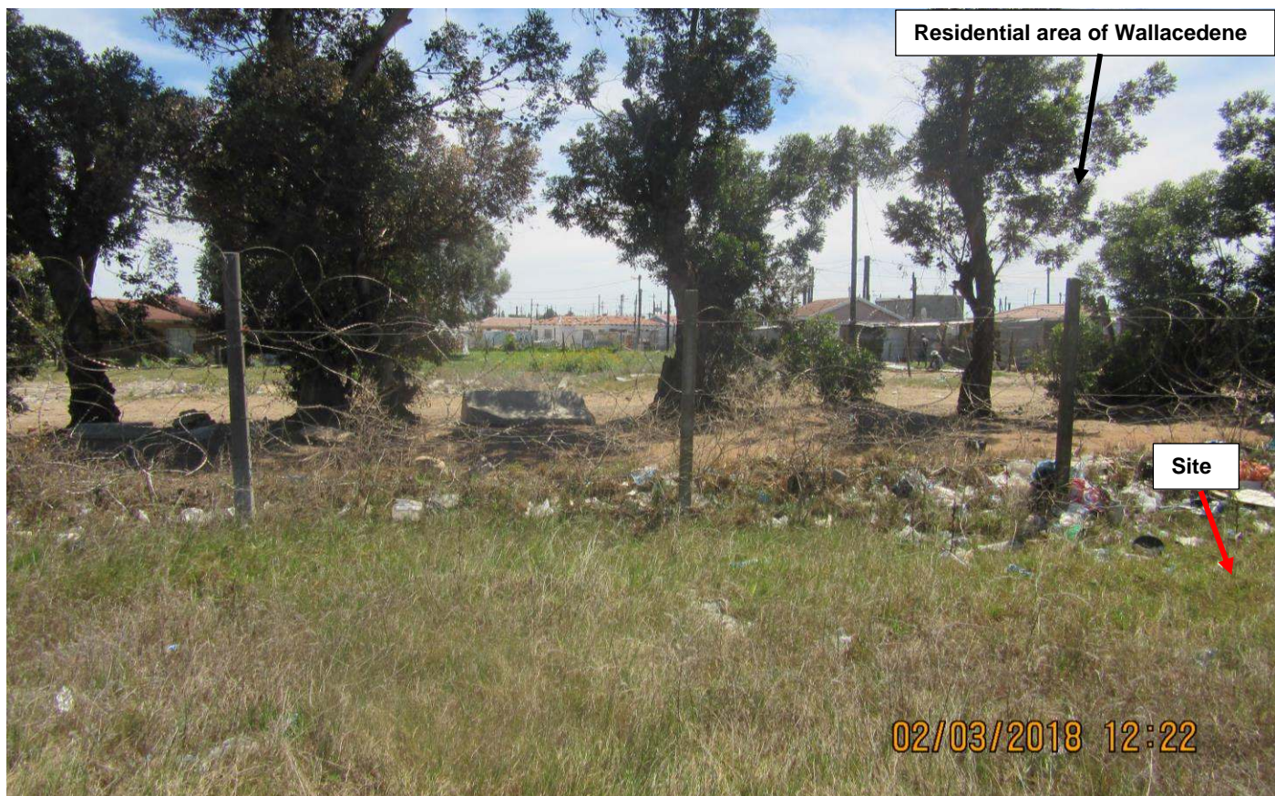
Photo 3 – View of the site looking north. The adjacent urban area can be seen in this image.