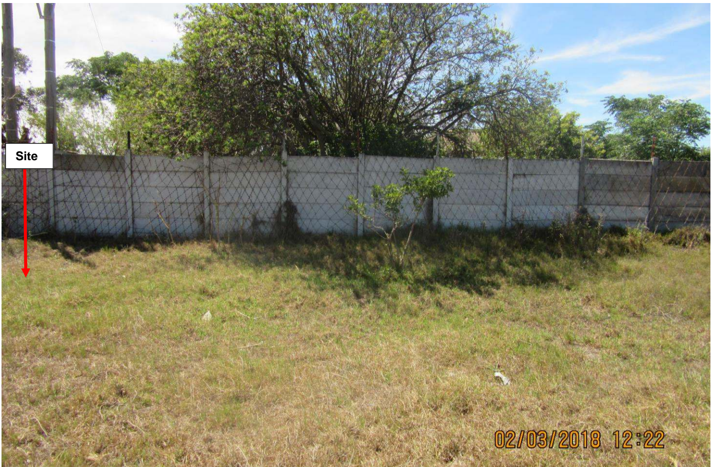
Photo 1 – View of the residential dwelling/farm house adjacent to the site, looking in an eastern direction. The proposed site is located adjacent to an existing farm dwelling.