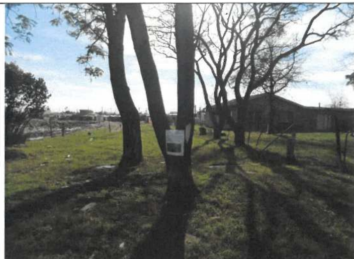
Figure 6: Poster placed against a tree, approximately 75m west of the proposed site. Looking in a northern direction, as viewed from a dirt road.