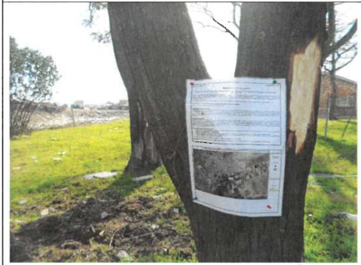
Figure 7: Poster placed against a tree, approximately 75m west of the proposed site. Looking in a northern direction, as viewed from a dirt road.