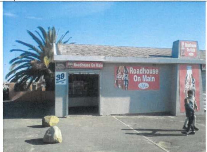
Figure 10: Poster placed inside Roadhouse on Main shop. Looking in a western direction, as viewed from Recreation Road.