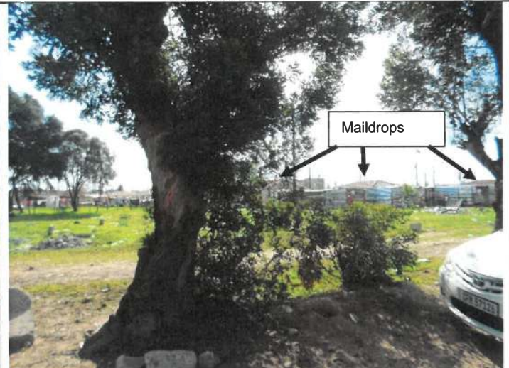
Figure 4: Maildrops distributed to residential dwellings north of the proposed site.