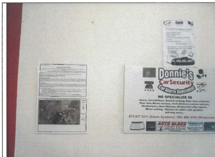
Figure 11: A3 poster placed against wall inside Roadhouse on Main.