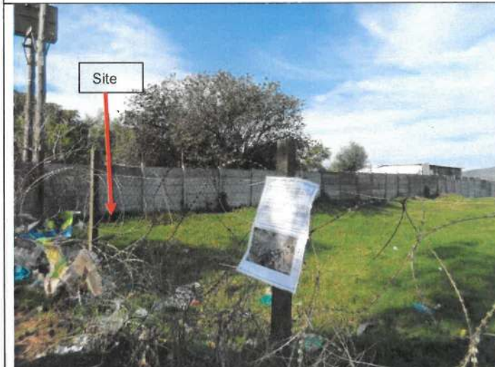
Figure 3: A2 poster placed on fence adjacent to the site; looking south-eastern direction, as viewed from the access road.