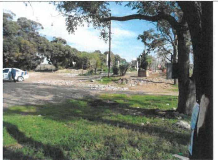
Figure 8: Poster placed against a tree, approximately 75m west of the proposed site. Looking in a south-western direction, as viewed from the poster.