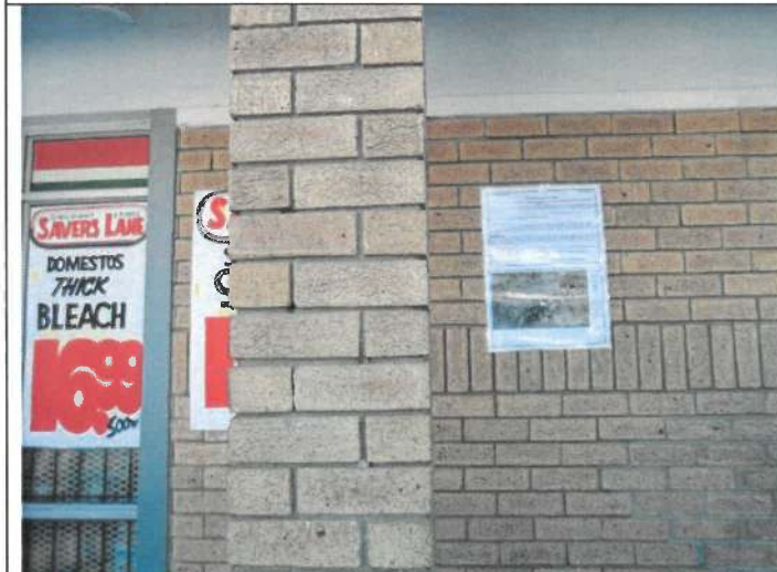
Figure 9: Poster placed against the wall at Savers Lane – Kraaifontein. Shop 7, Riebeeck Street, Kraaifontein.