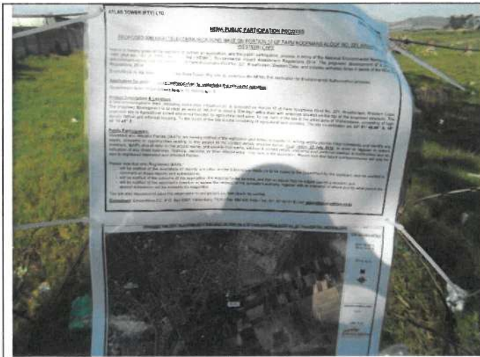
Figure 1: A2 poster placed on fence adjacent to the site; looking south as viewed from the access road.