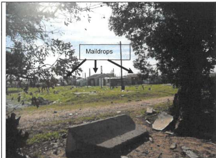
Figure 5: Maildrops distributed to residential dwellings north of the proposed site.