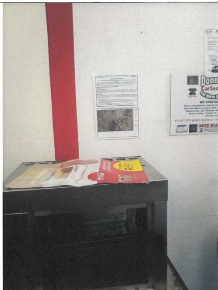
Figure 12: A3 poster placed against wall inside Roadhouse on Main.