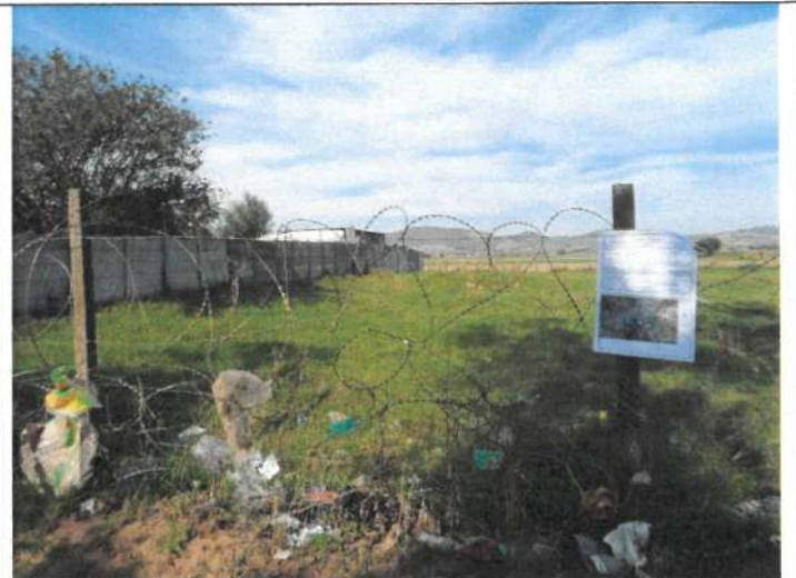
Figure 2: A2 poster placed on fence adjacent to the site; looking south as viewed from the access road.