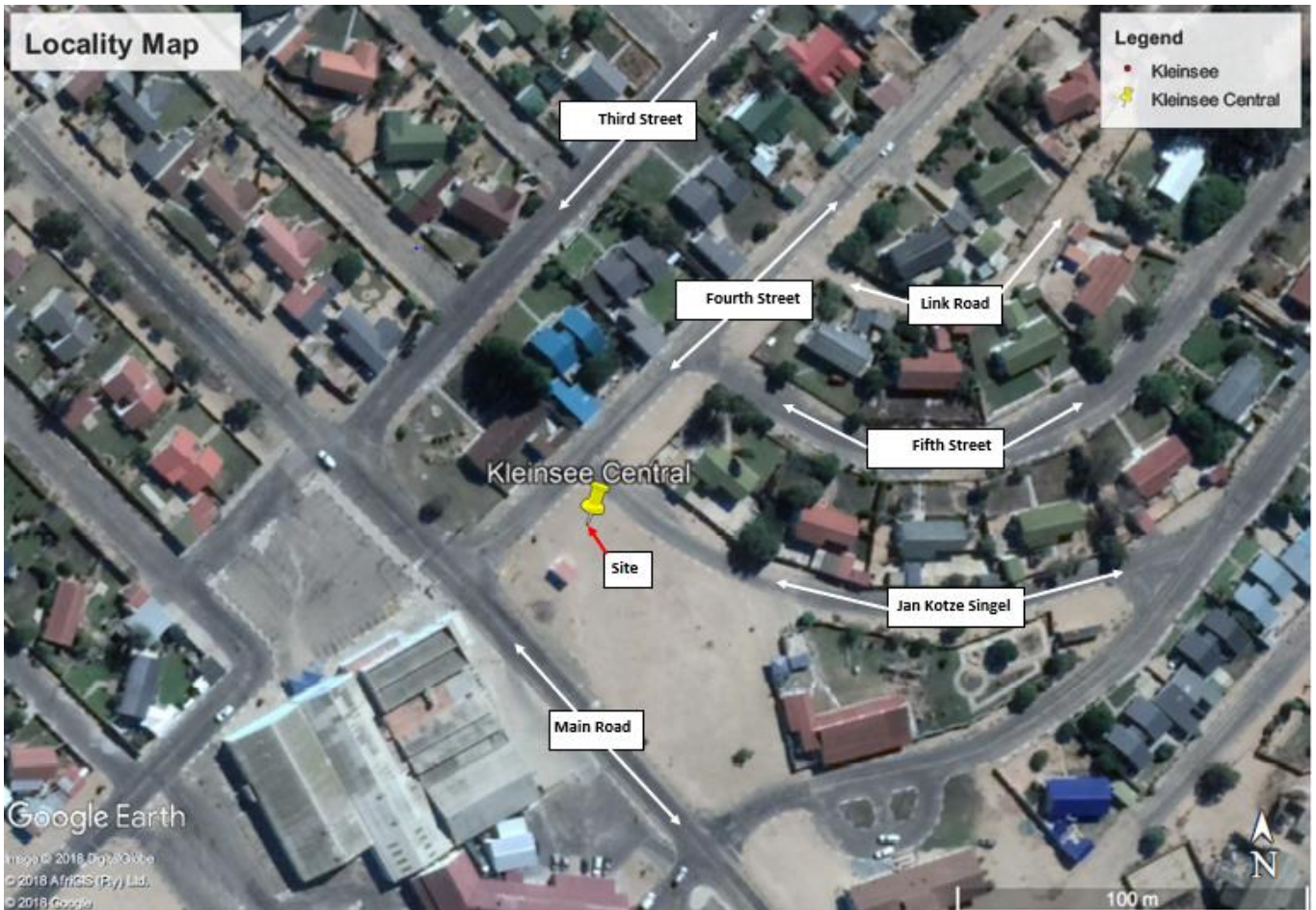
Figure 1: Google Earth aerial view of the proposed site location (yellow placemark). The site will be accessed via Main Road.

gained via Main Road. Electricity to power the mast will be sourced from the land owner. The site has no slope and is located on a flat surface area. There is no natural vegetation present on site, and the site is totally transformed due to past development activities on the property. The proposed site co-ordinates: 29°40' 43.95"S, 17°4'10.81"E .