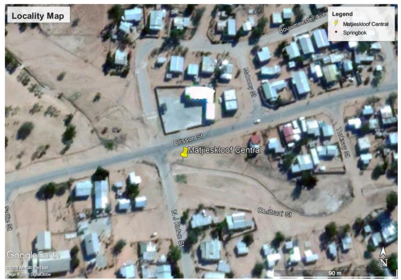
Figure 1: Google Earth aerial view of the proposed site location (yellow placemark). The site will be accessed via Brisson Street.

three future service provider equipment containers. There is no natural vegetation on site, and the site is totally transformed due to past development activities on the property. The proposed site is located to the north of a stormwater channel and there are no watercourses on site. The mast's base station will be closed with a steel palisade fence. Electricity to power the mast will be sourced from the land owner. The site has no slope and is located on a flat surface area. The site co-ordinates are 31°28'8.18"S 19°46'12.63"E .