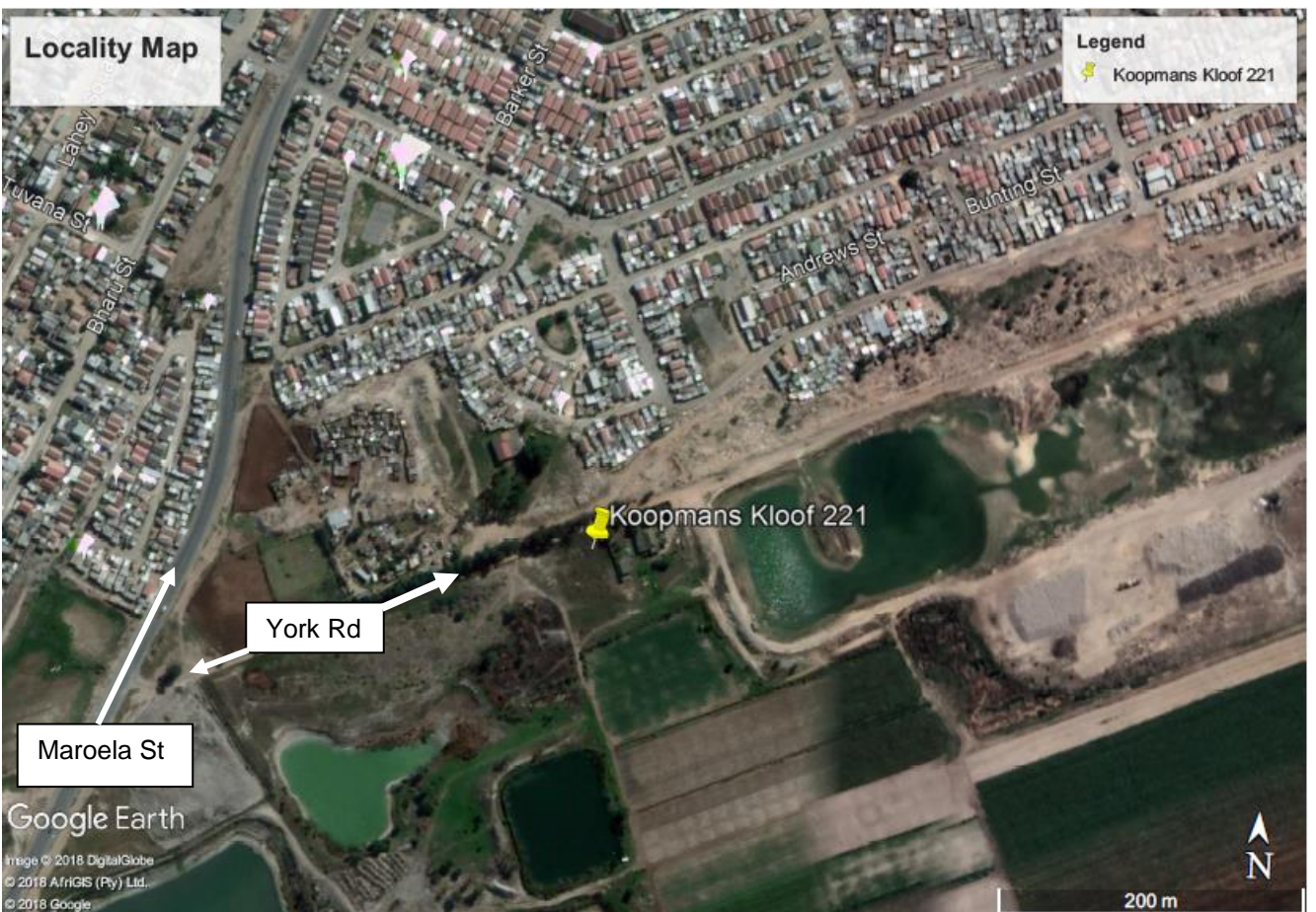
Figure 2: Google Earth aerial view of the site location.