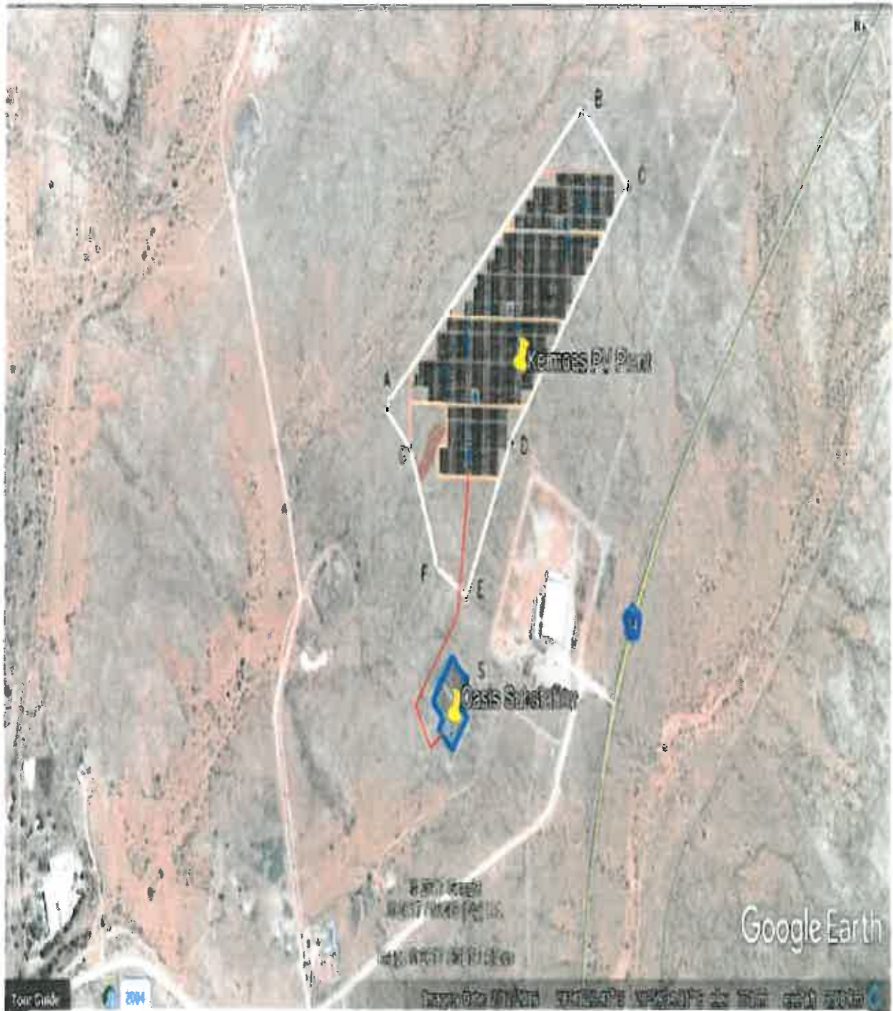
Figure 2 - position of the proposed project site and solar PV panel layout with nearby Oasis substation (substation outlined in blue, proposed overhead power line tie-in for evacuation of electricity to substation indicated in red). Lighter red shaded area within site indicates 32m setback from intermittent water course within proposed site.