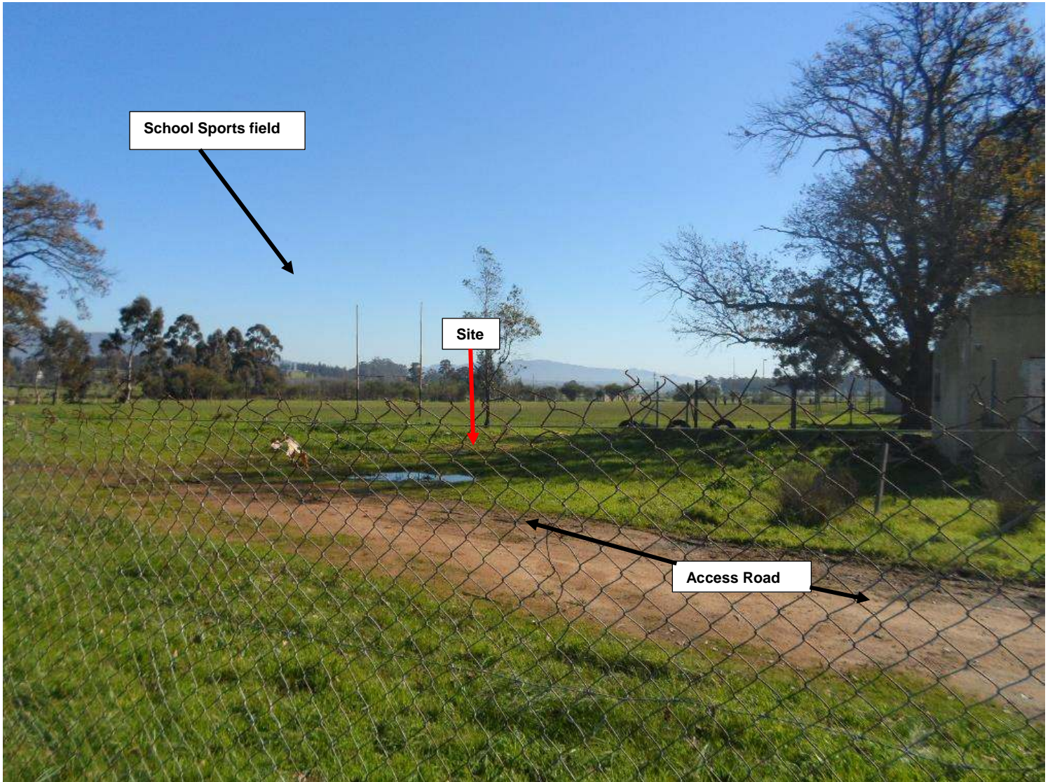
Figure 1: A view of the proposed site (red arrow), looking in a north-western direction. Dal Josafat Primary School sports field can be seen to the north of the proposed site. The site is covered with kikuyu grass and is completely transformed from its natural state. There is derelict building approximately 18m east of the proposed site.