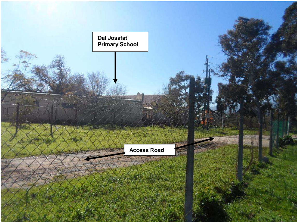
Figure 6: A view of the access road leading towards the proposed site, looking in a north-eastern direction.