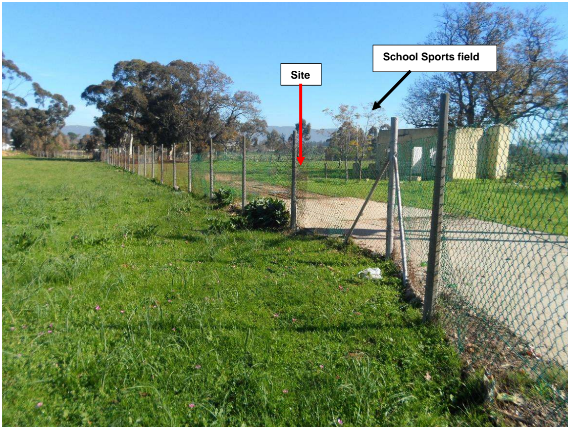
Figure 4: A view of the proposed site (red arrow), looking in a north-western direction. Dal Josafat Primary School sports field can be seen to the north of the proposed site. Picture taken adjacent to the access gate.