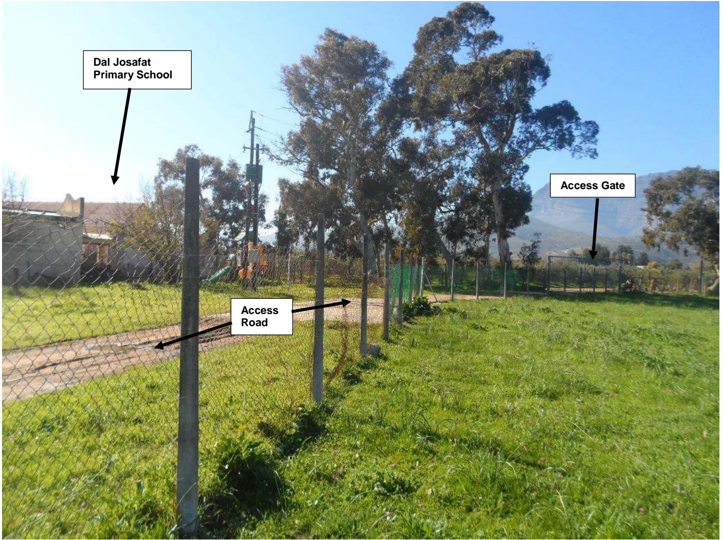
Figure 7: A view of the access road and access gate as viewed from Farm No. 551, Dal Josafat. Dal Josafat Primary School is located to the east of the proposed site. Looking in an eastern direction towards the access gate and Dal Josafat Primary School.