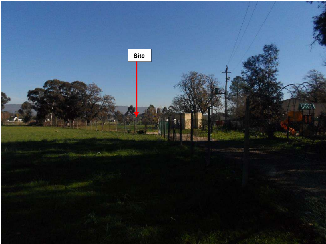
Figure 2: A view of the proposed site (red arrow), looking in a north-western direction. Dal Josafat Primary School sports field can be seen to the north of the proposed site. The access road is to the right.