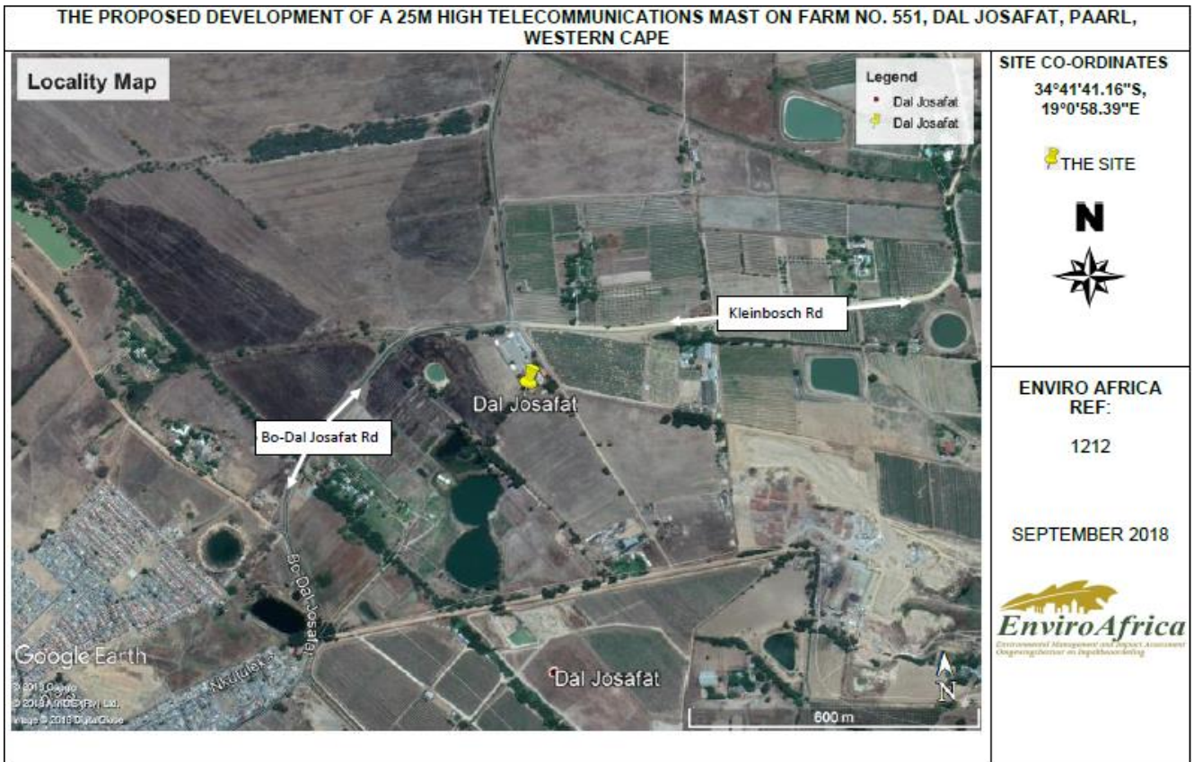
Figure 1: Google Earth aerial view of the site location.