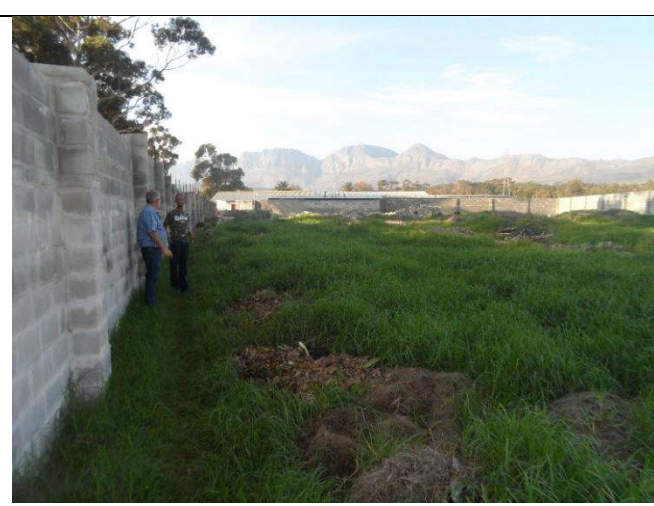
Figure 3: Standing in the South-Western corner facing North-East