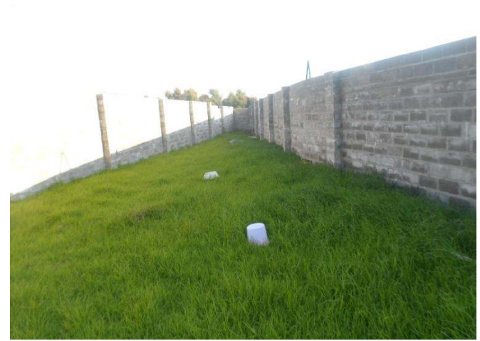
Figure 1: Area selected for the mast in the South – West corner of the property, RE Erf 5095 Broadlands