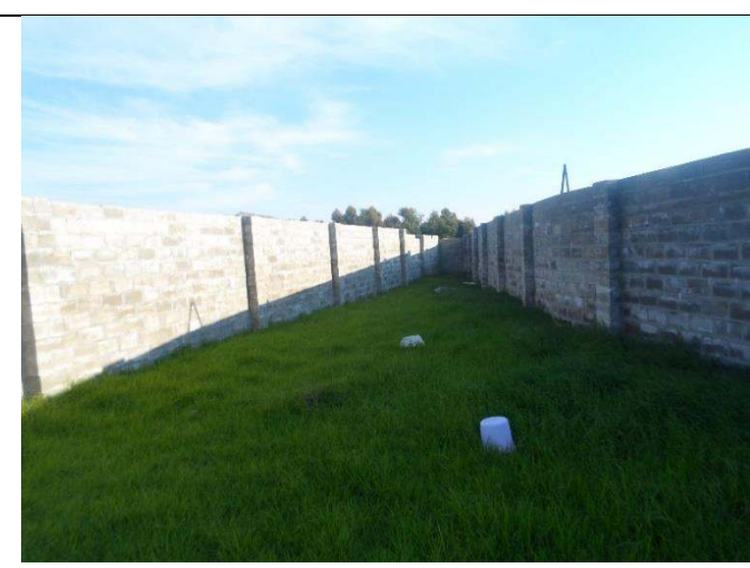
Figure 2: Area selected for the mast in the NE corner of the property, Erf 73 Klipheuwel