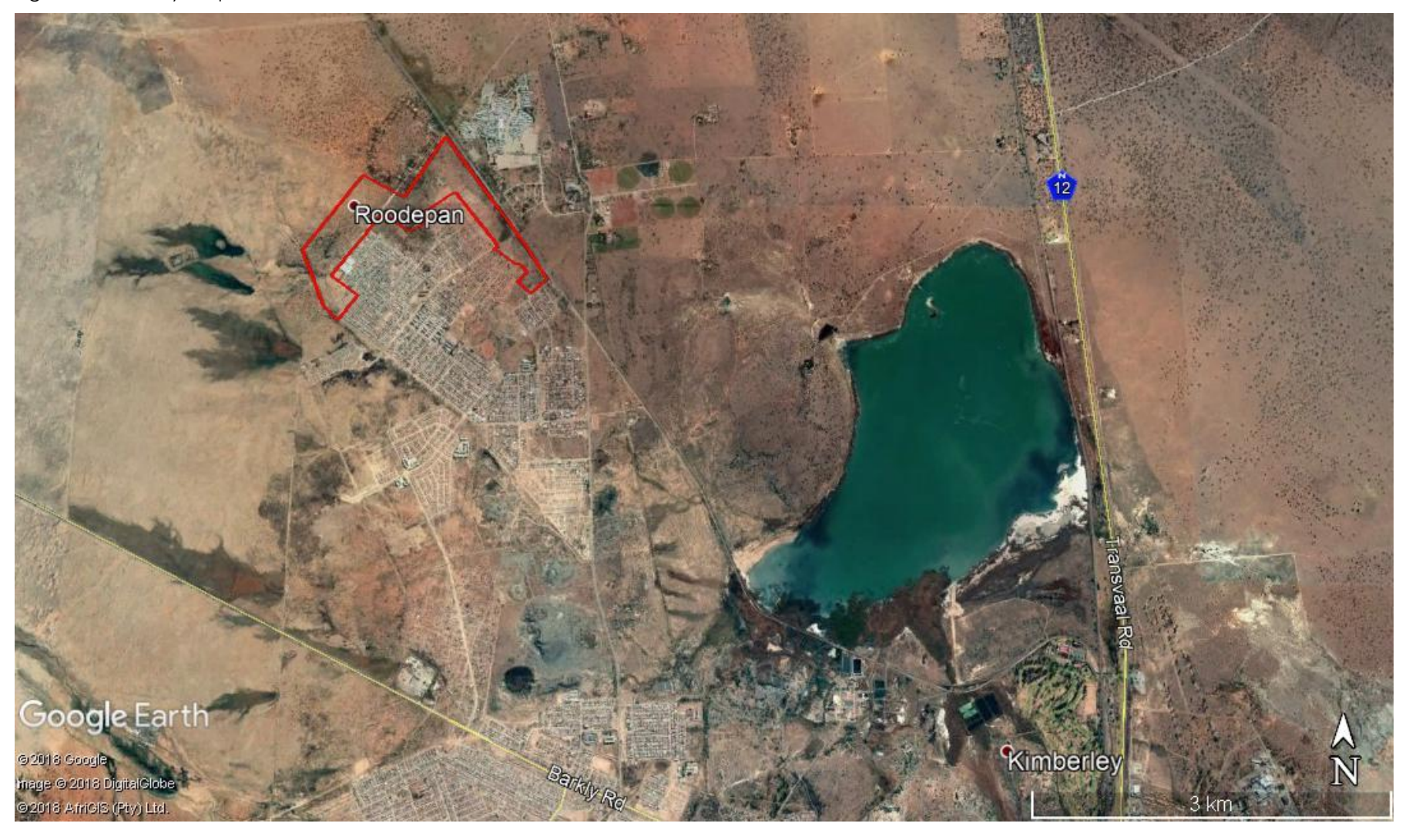
Figure 2 – Locality Map

Attention: Botshelo Jacobs Reneilwe Consulting and Planners Tel No: +27 84 619 2962 Email Address: reneilweprojects@gmail.com