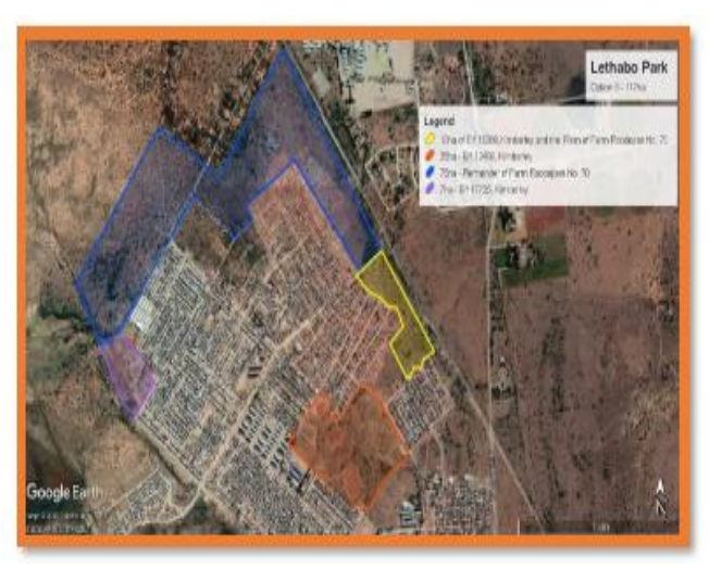
12th November 2018