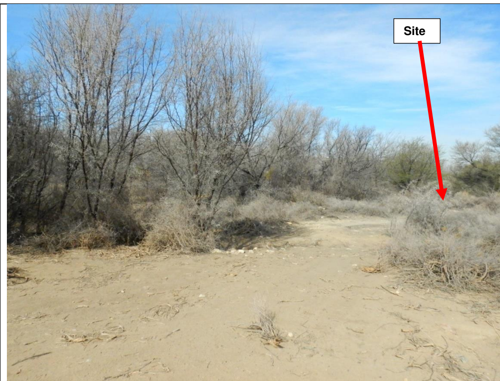
Figure 7: A view of the access road leading towards the proposed site, looking in a north-eastern direction.