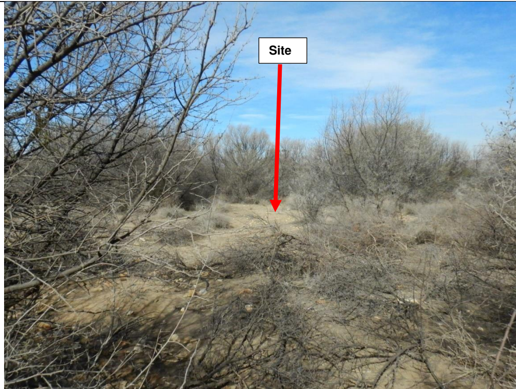
Figure 5: A view of the proposed site, as viewed from the access road leading towards the site. Looking in a eastern direction.