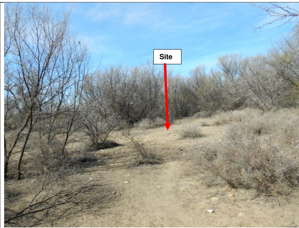
Figure 09: A view of the proposed site as viewed from the access road leading up towards the site.