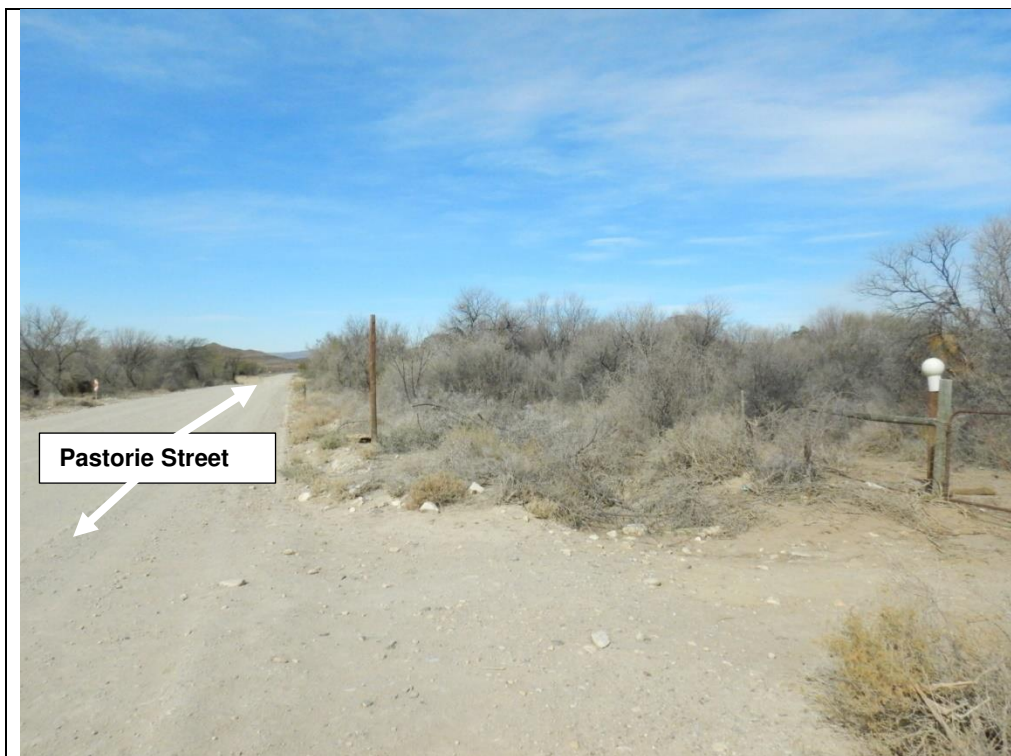
Figure 1: A view of Pastorie Street, with the access road to the right; looking in a north-eastern direction.