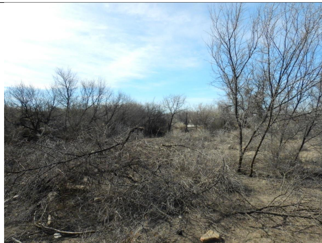
Figure 10: A view of the proposed site, looking towards Pastorie Street. Looking in a northern-western direction.