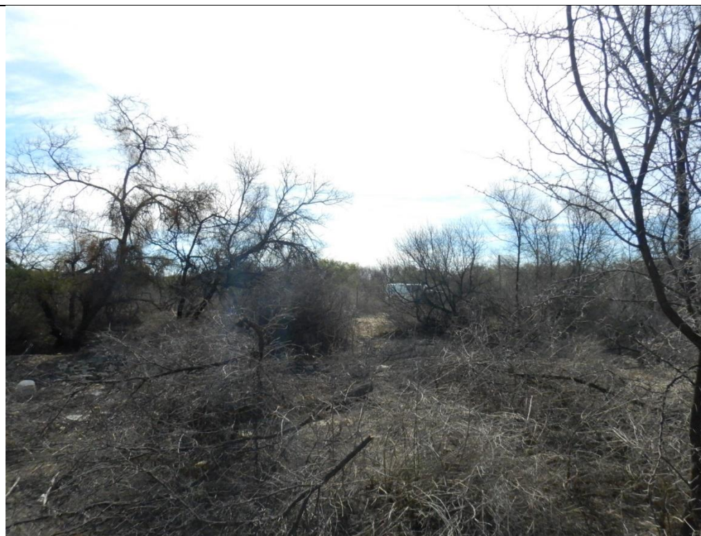
Figure 11: A view of the proposed site, looking towards Pastorie Street. Looking in a northern direction.