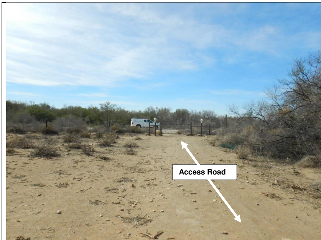
Figure 6: A view of the access road, looking towards Pastorie Street. The proposed site is located to the right. Looking in a northern direction towards Pastorie Street.