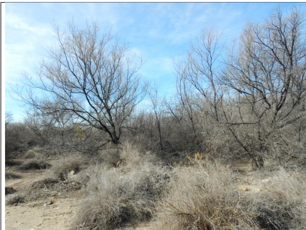
Figure 8: A view of the proposed site as viewed from the access road; looking in a southern direction.