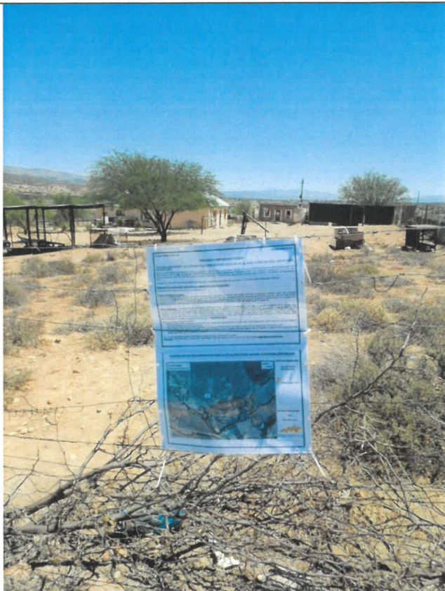
Figure 1: A2 Site poster placed against the property fence; looking in a western direction as viewed from Bond Street.