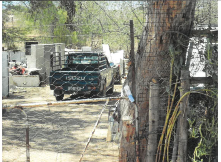
Figure 14: Maildrop done at Morester Farm (Erf 3006).