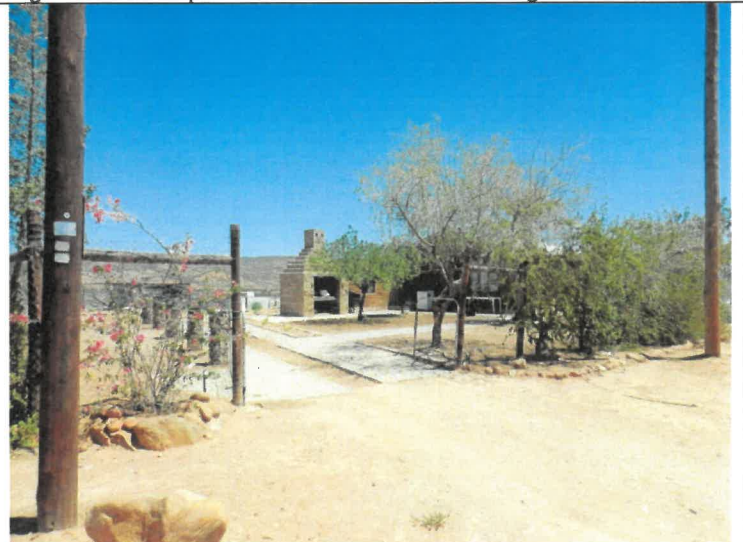
Figure 10: Maildrops done at this residential dwelling.