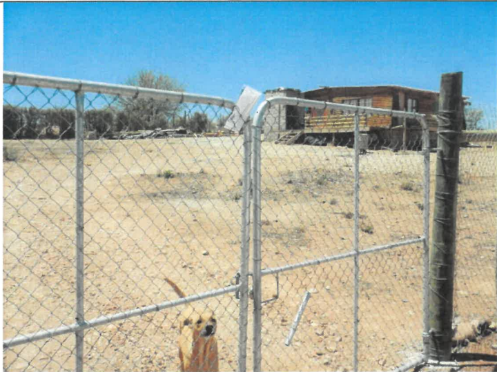
Figure 5: Maildrop done at this dwelling.