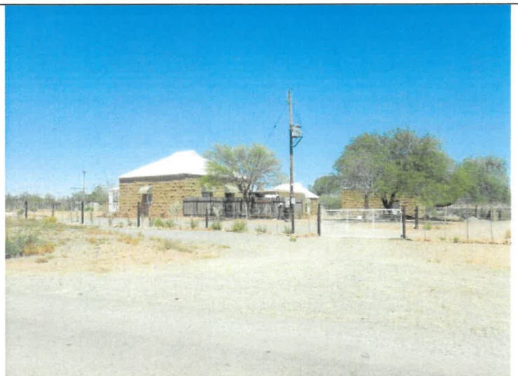
Figure 16: Maildrop at this residential dwelling.