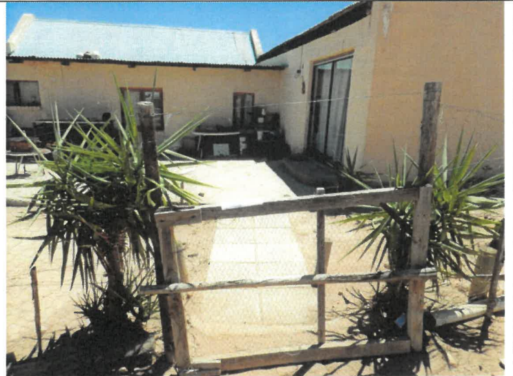
Figure 8: Maildrop done at this residential dwelling.