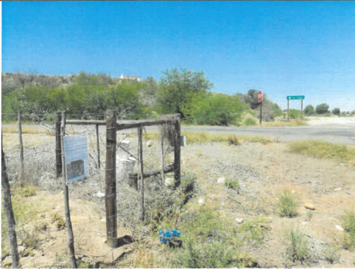
Figure 11: A3 poster placed against fence along Terblanche Street (Erf 3007).