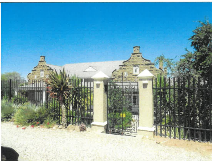
Figure 15: Maildrop at this residential dwelling.