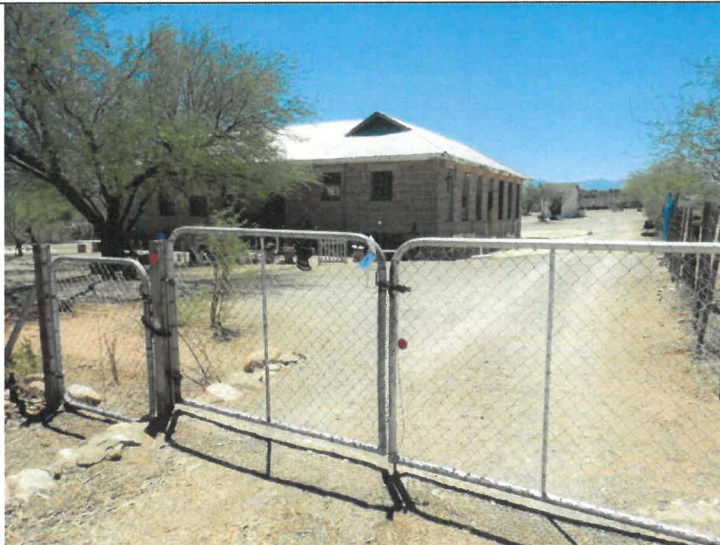
Figure 7: Maildrop done at this residential dwelling.