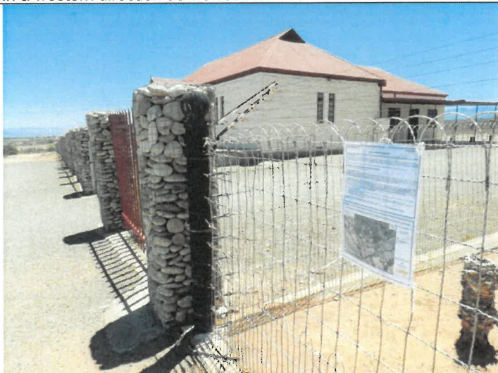
Figure 3: A3 poster placed against the fence – located between the house and De Hoop Church.