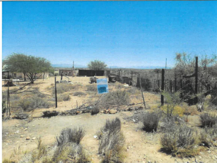
Figure 2: A2 Site poster placed against the property fence; looking in a western direction as viewed from Bond Street.