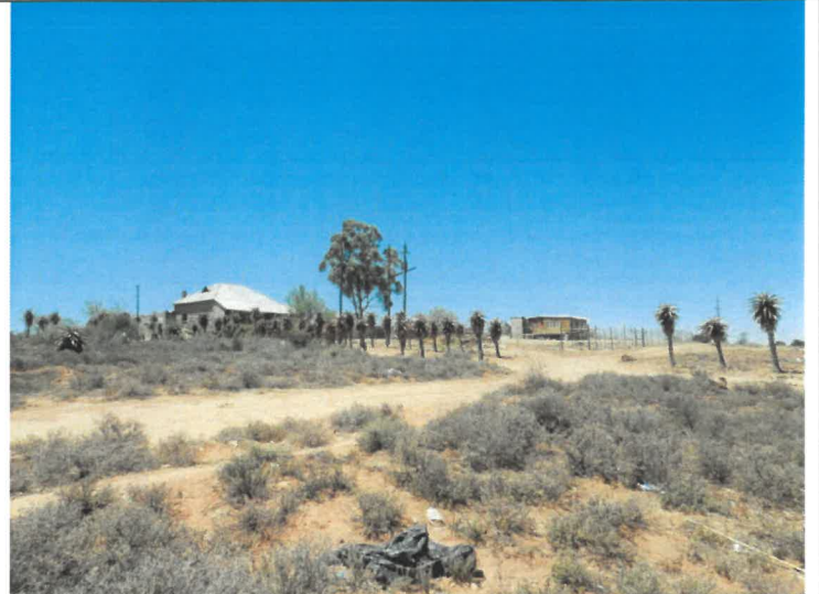
Figure 6: Maildrop done at the 1 st and 2 nd House located north-west of the Church.