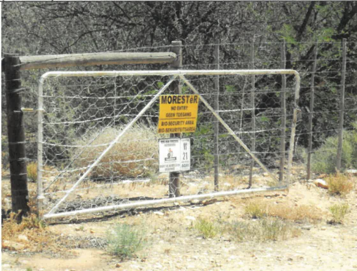
Figure 13: Maildrops at Morester Farm.