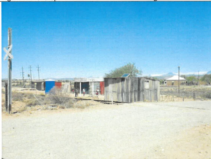
Figure 9: Maildrops done at Hoopvol Railway Station (settlement).