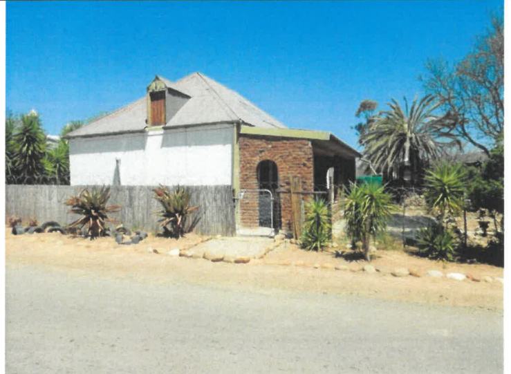
Figure 12: Maildrops done at this residential dwelling.