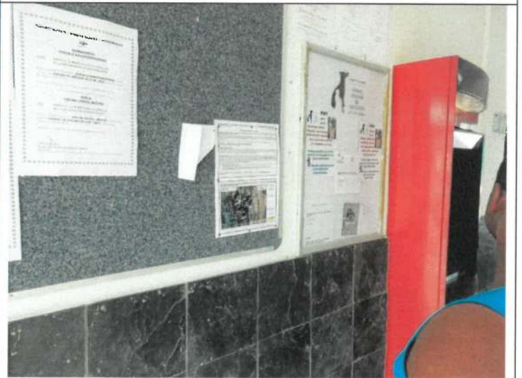
Figure 14: A3 Poster placed on notice board inside Spar, located at the corner of Church Street and Odendaal Street.