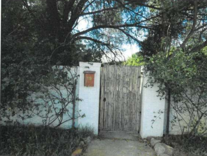
Figure 7: Maildrop done at 19 Pastorie Street, Prince Albert.