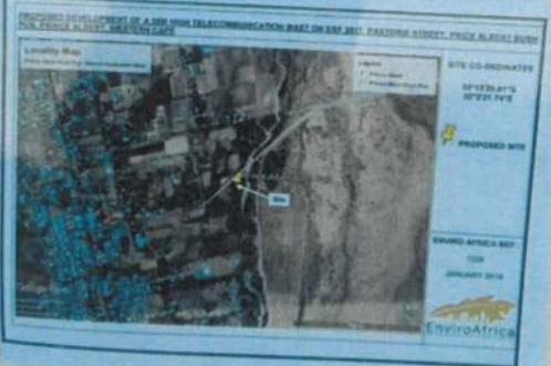
Figure 19: A3 Poster placed on notice board at Prince Albert Municipality at 33 Church Street, Prince Albert.