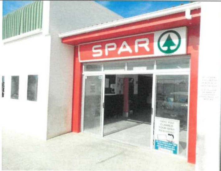
Figure 13: A3 Poster placed on notice board inside Spar, located at the corner of Church Street and Odendaal Street.