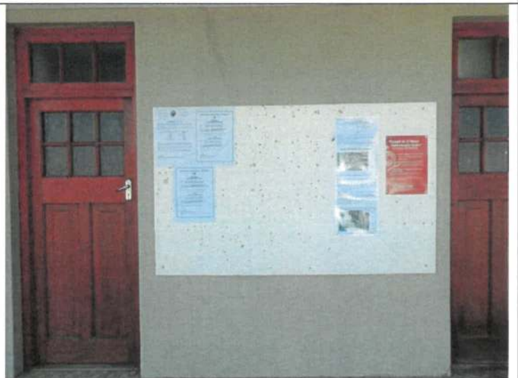
Figure 18: A3 Poster placed on notice board at Prince Albert Municipality at 33 Church Street, Prince Albert.