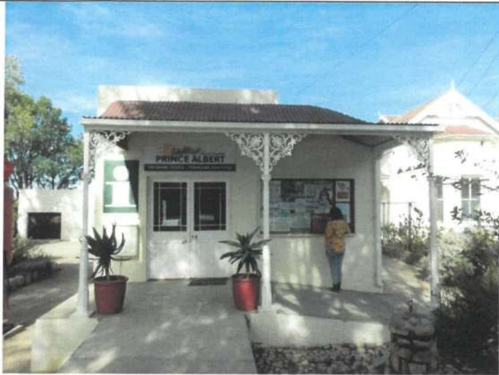
Figure 11: A3 poster placed on public notice board at Prince Albert Tourism Office located at 43 Church Street, Prince Albert.