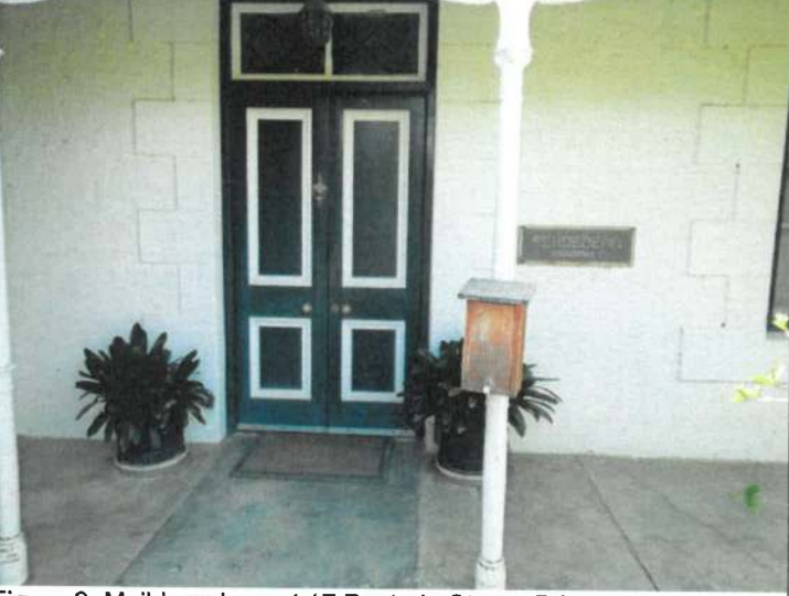
Figure 9: Maildrop done at 17 Pastorie Street, Prince Albert.