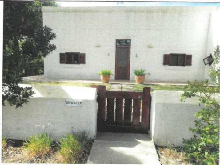
Figure 5: Maildrop done at 19 Pastorie Street, Prince Albert.