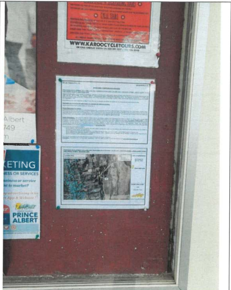
Figure 12: A3 poster placed on notice board at Prince Albert Tourism Office.