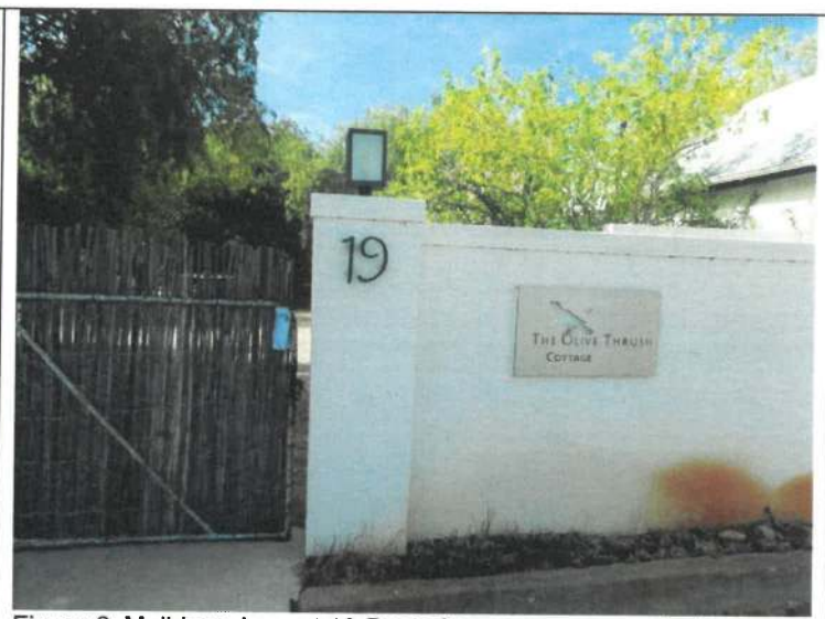
Figure 6: Maildrop done at 19 Pastorie Street, Prince Albert.