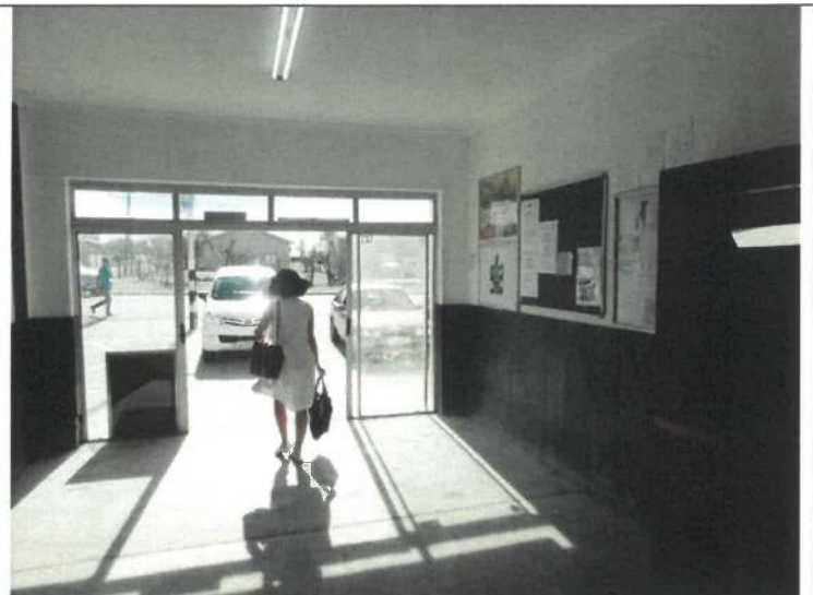
Figure 16: A3 Poster placed on notice board inside Spar, located at the corner of Church Street and Odendaal Street.