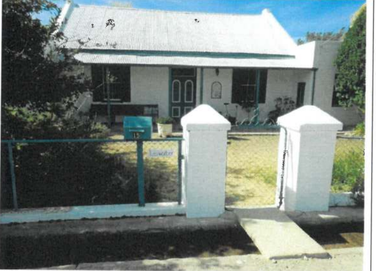
Figure 10: Maildrop done at 15 Pastorie Street, Prince Albert.