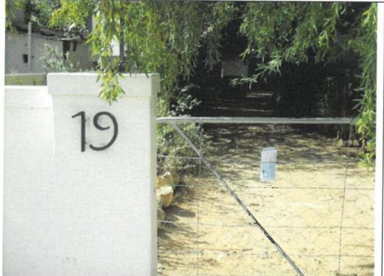
Figure 8: Maildrop done at 19 Pastorie Street, Prince Albert.