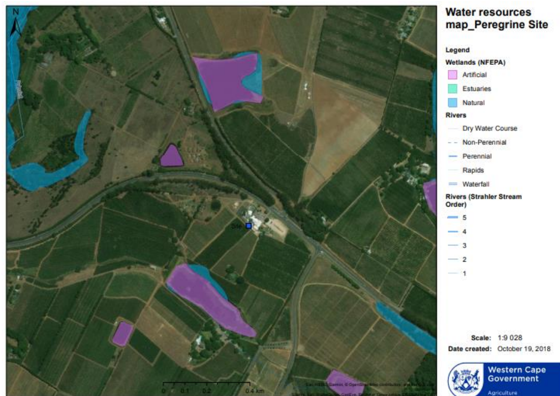
Figure 6: NFEPA Map

The National Freshwater Ecosystems Priority Areas (NFEPA) Map ( Appendix D ) show that the proposed site does not fall within any wetlands/ watercourses or near any rivers.