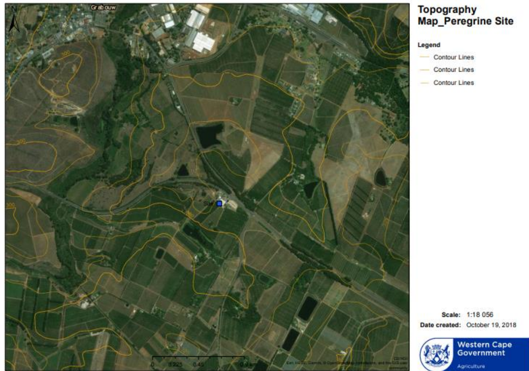
Figure 5: Topographical Map indicating the contours of the chosen site

The figure below is a topographical map indicating the contours of the proposed site.