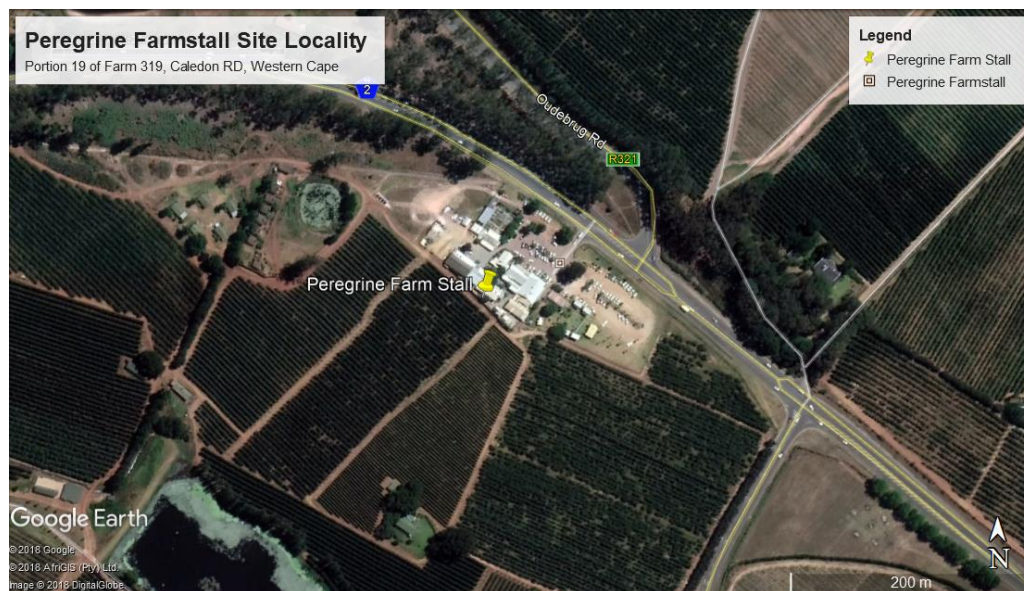
Figure 3: Locality map of the proposed site

Although the mast is proposed behind the Peregrine Farmstall, it is recommended that a visual impact assessment be conducted. Peregrine Farmstall is considered a popular tourist destination. A VIA was conducted. Please refer to the report in Appendix G2 .