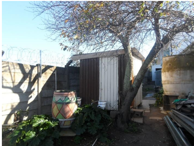
Figure 2: Site selected for the mast, Wendy house and tree to be removed

From the vegetation map from Cape Farm mapper (Appendix D), vegetation that would have been present on site include Elgin Shale Fynbos. According to the National Environmental Management: Biodiversity Act 10 of 2004 (NEMBA), National List of Ecosystems that are threatened and in need of protection, this type of vegetation is classified as critically endangered. However, from the site photographs ( Appendix C ) and the figures above it is clear that site has been completely transformed with some areas covered with grass and some bare soil areas. The tree to be removed is a Celtis sinensis and is an alien tree.