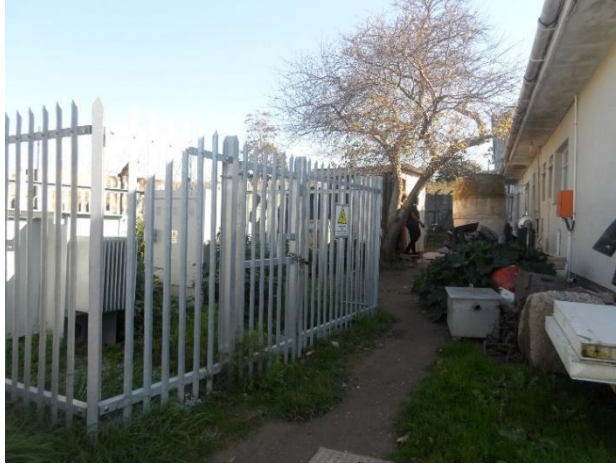
Figure 1: Photograph indicating that the site selected for the mast, Wendy house and tree to be removed, area is completely transformed.