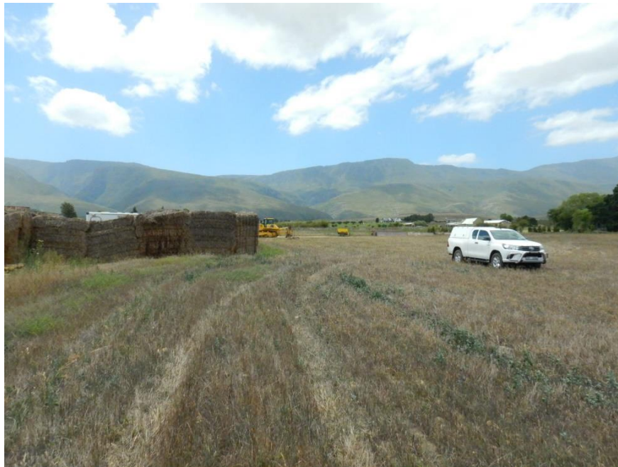
Figure 2: Photograph indicating the site selected is disturbed, with no natural vegetation remaining.

According to the vegetation map ( Appendix 11 ) the vegetation that would have been present on the site is Cape Lowland Alluvial Vegetation. This type of vegetation is classified as Critically Endangered in the Western Cape in terms of NEMBA National list of Ecosystems that are threatened and in need of protection. Site visits confirm that the site is considered completely transformed with no natural vegetation remaining due to previous developments on the property.