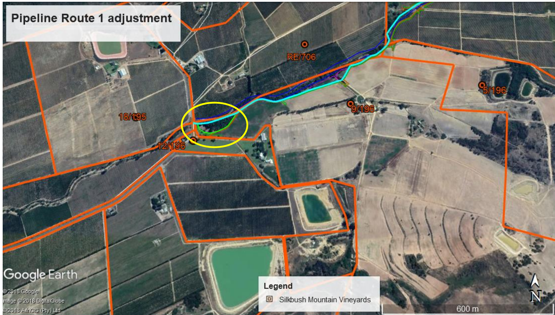
Figure 2: Adjustment of the last 205m of Pipeline Route 1 represented in green, as recommended by the specialist to avoid going through the bush which may cause the destabilisation of the river bank by removing vegetation.