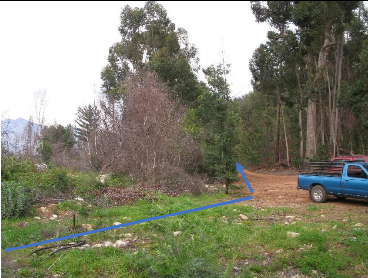
Figure 5: Estimate of locality of the proposed Pipeline route 1 (Alt 1). the proposed pipeline will connect to the Water Structure from where it will follow existing farm roads to the existing weir (to be rehabilitated) down stream