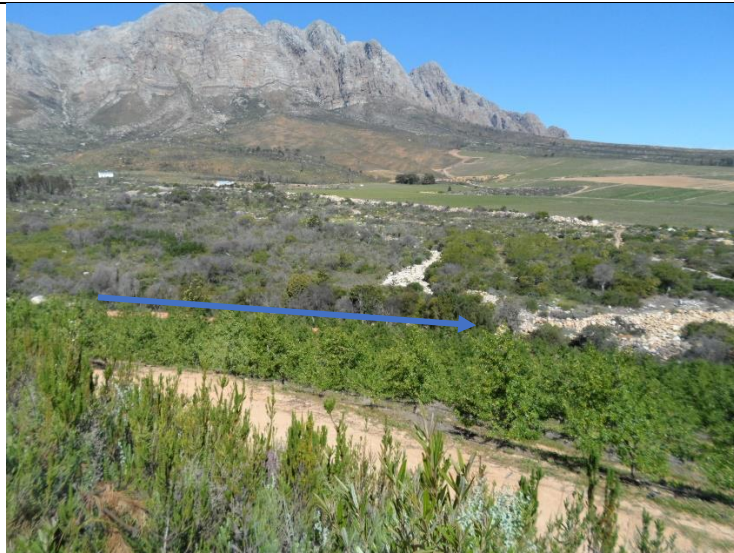
Figure 7: Photo showing proposed pipeline route on farm roads