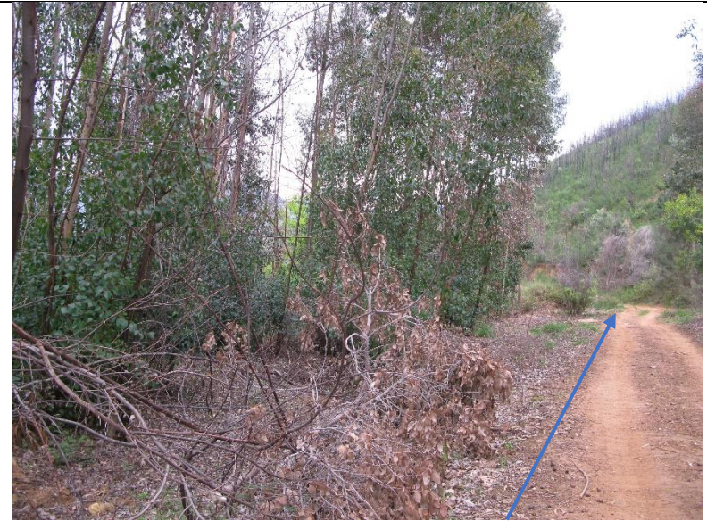
Figure 6: Estimated locality of the proposed Pipeline Route 1 (Alt 1) connect to the Water Structure from where it will follow existing farm roads to the existing weir (to be rehabilitated) down stream