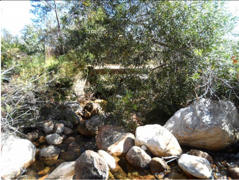
Figure 1: Proposed weir site, to the north of the existing small bridge