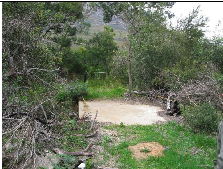
Figure 3: Existing bridge on site, weir proposed to the north of the bridge