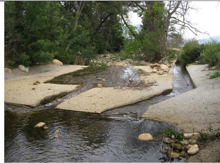
Figure 8: Existing weir (downstream) to be rehabilitated, footprint to remain