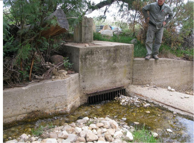
Figure 10: Division structure at existing diverting the water to Darling Brug & Wagenboom Irrigation Boards