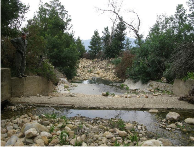
Figure 9: Existing weir (downstream) to be rehabilitated