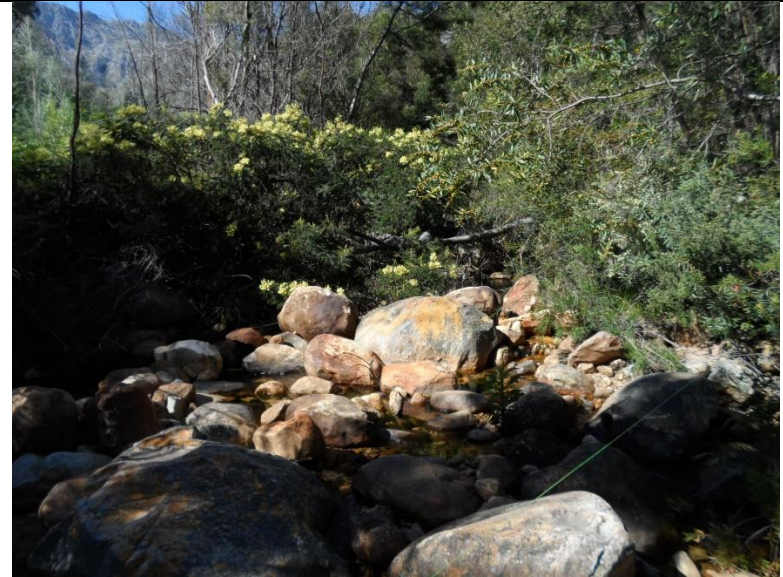
Figure 2: Proposed weir site