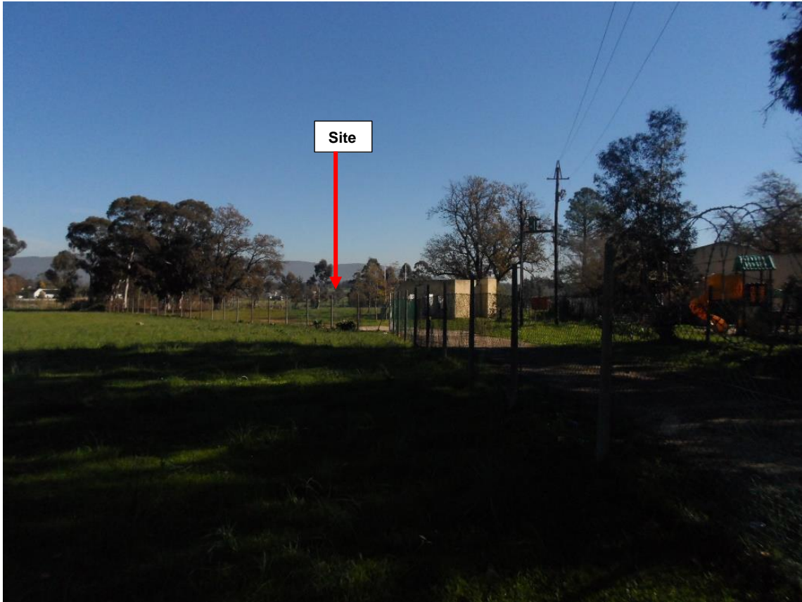
Figure 2: A view of the proposed site (red arrow), looking in a north-western direction. Dal Josafat Primary School sports field can be seen to the north of the proposed site. The access road is to the right.