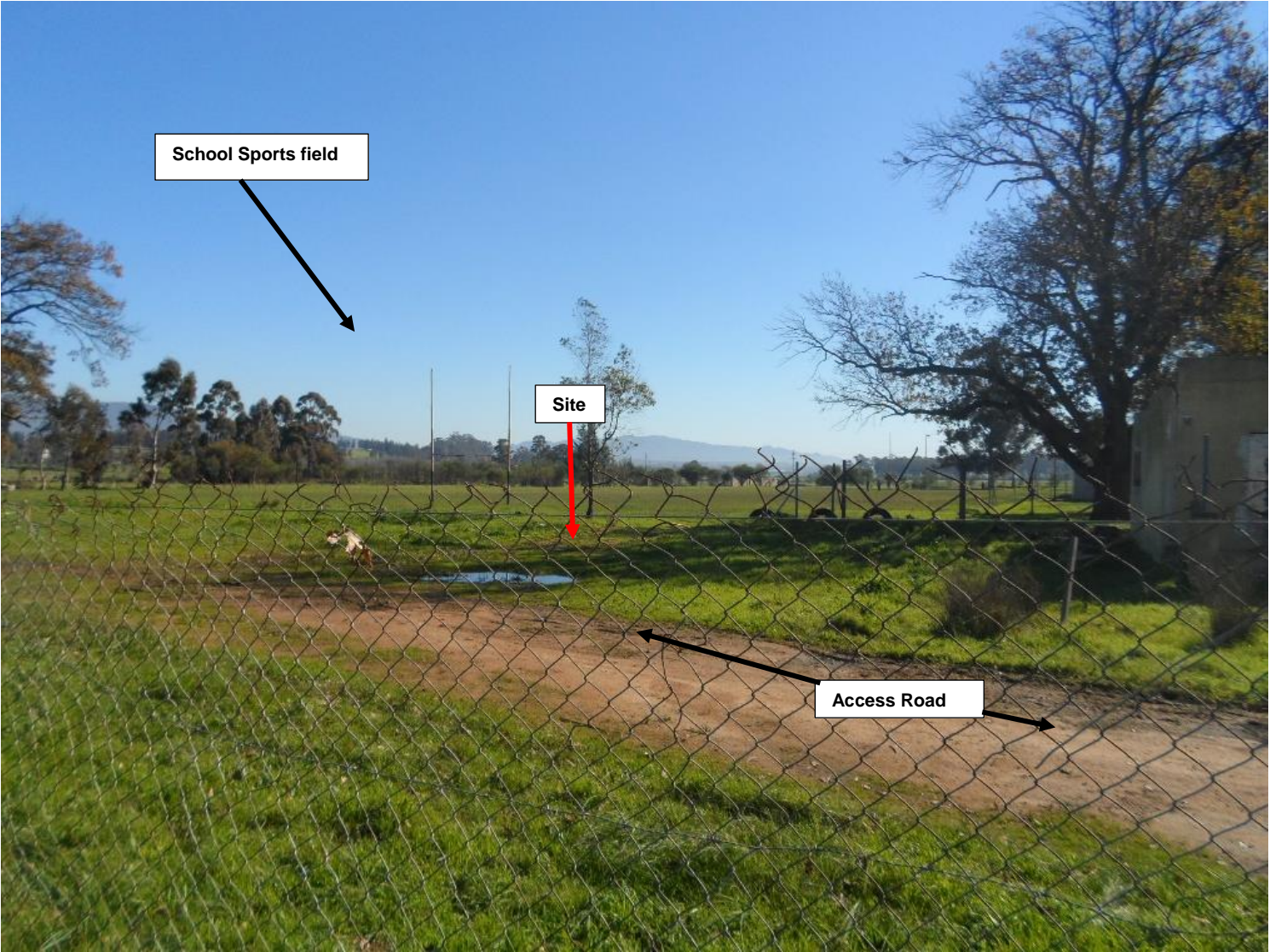
Figure 1: A view of the proposed site (red arrow), looking in a north-western direction. Dal Josafat Primary School sports field can be seen to the north of the proposed site. The site is covered with kikuyu grass and is completely transformed from its natural state. There is derelict building approximately 18m east of the proposed site.