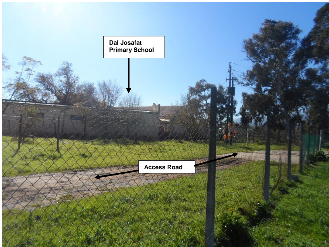
Figure 6: A view of the access road leading towards the proposed site, looking in a north-eastern direction.