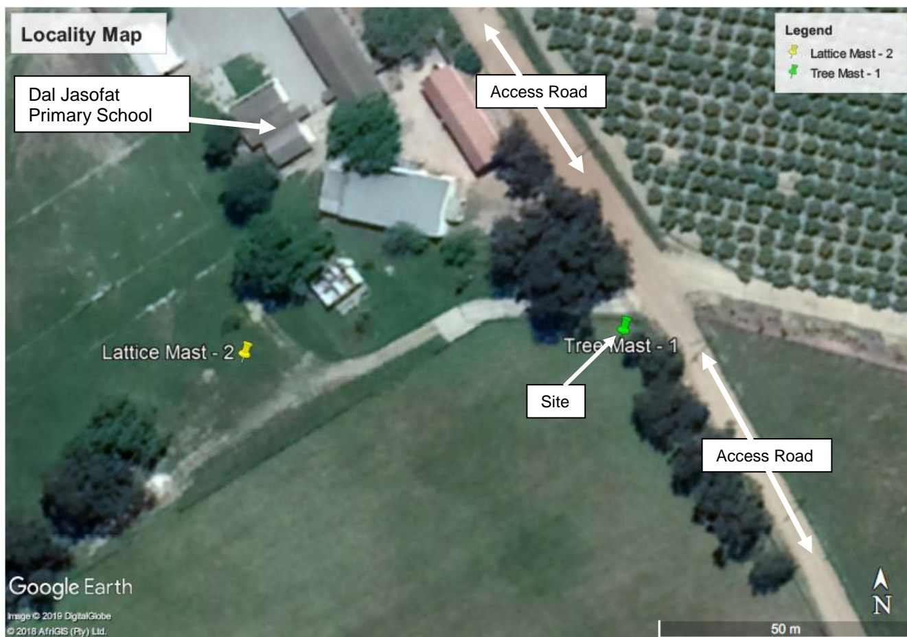
Figure 2: Google Earth aerial view of the site location. Green placemark is the preferred site / alternative.