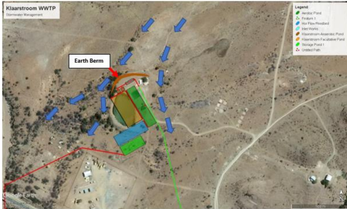
Figure 1: Layout of proposed earth berm

It is proposed that a low earth embankment (1.0m high) be placed on the northern side of the proposed works to channel any stormwater around the proposed works as indicated on the image below. The primary concentrated runoff from the drainage lines as indicated will then be mitigated. Similarly, the second drainage line from the east could be diverted using a trench along the toe-line of the eastern ponds to ensure that stormwater is diverted to the south of the works.