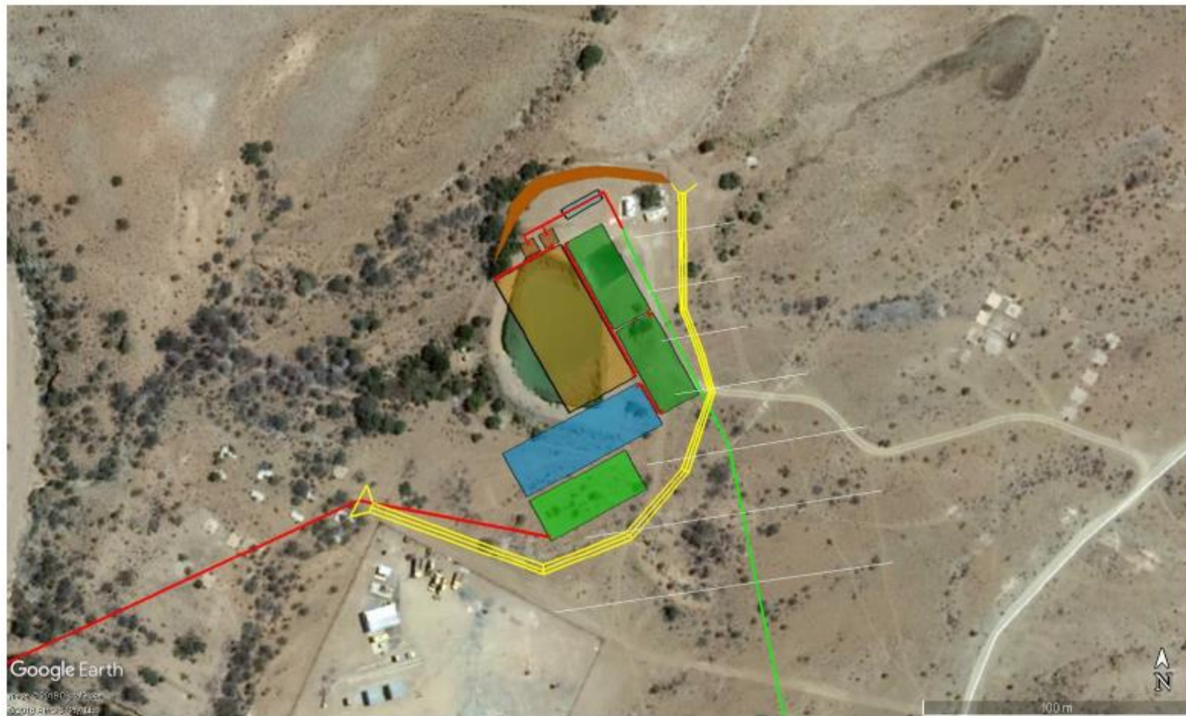
Figure 2: Layout of proposed earth berm and trench