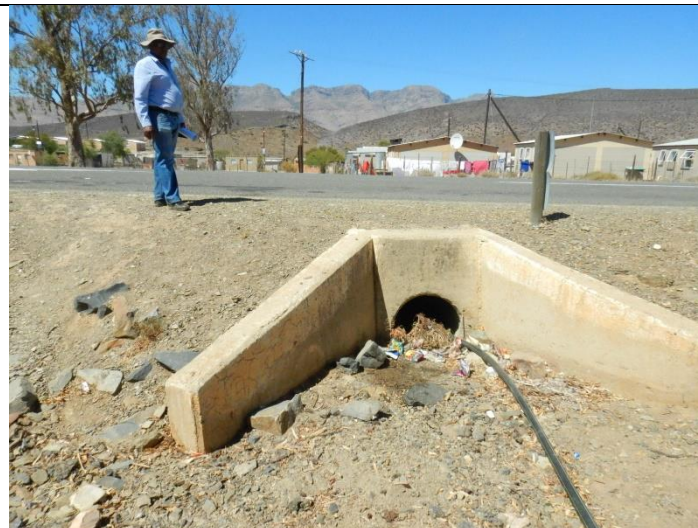
Figure 15: Photo showing the culvert. it is proposed that the pipeline route (Alternative A) cross the N12 through this culvert