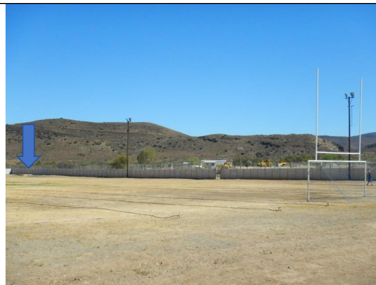
Figure 21: Photo taken on the southern portion of the sport field to be irrigated, facing North. the arrow indicates the area proposed for the galvanised storage dam. Road maintenance camp in the back ground