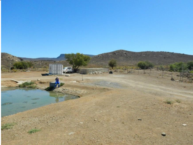
Figure 6: Photo showing the existing anaerobic pond with the septic tank in the back ground, facing North-East