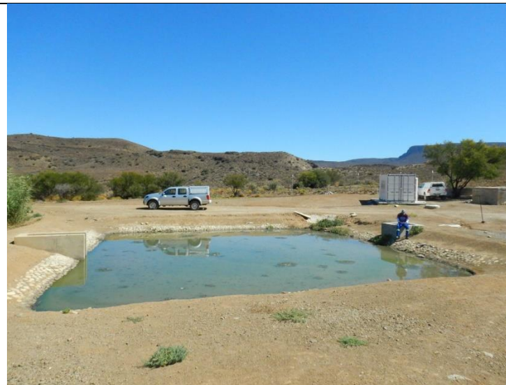
Figure 5: Photo showing the existing anaerobic pond with the septic tank in the back ground, facing North