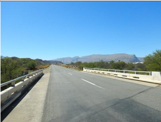
Figure 24: Photo showing proposed pipeline route Alternative D to follow the road reserve and attach to the bridge to cross the N12