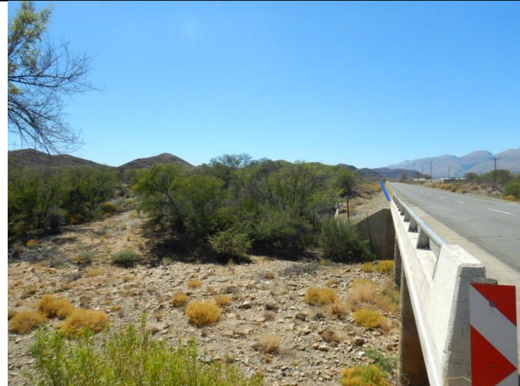
Figure 23: Photo showing proposed pipeline route Alternative D to follow the road reserve and attach to the bridge to cross the N12