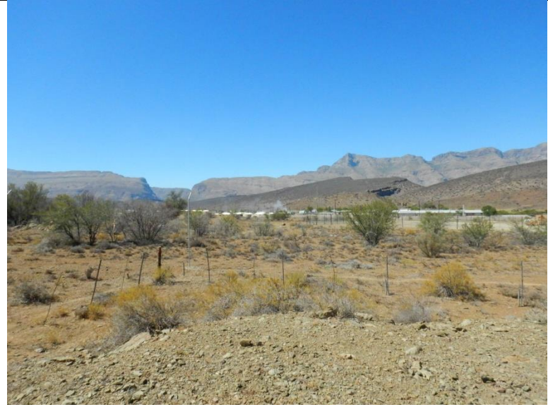
Figure 7: Photo showing the eastern corner of the site and area proposed for pipeline route Alternative A, C, D