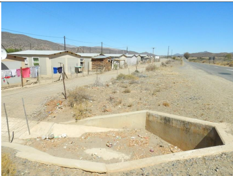
Figure 16: Photo showing the culvert (southern side of the N12). it is proposed that the pipeline route (Alternative A) cross the N12 through this culvert