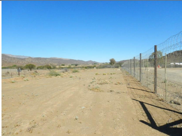
Figure 12: Photo showing the area for proposed pipeline route A (preferred alternative) adjacent to the road maintenance camp