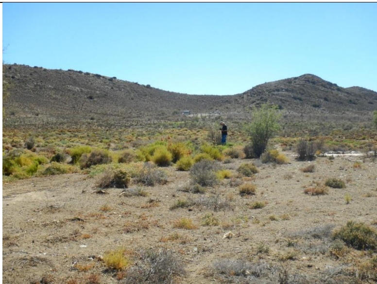
Figure 18: Photo showing the area considered for proposed pipeline route B (not preferred).