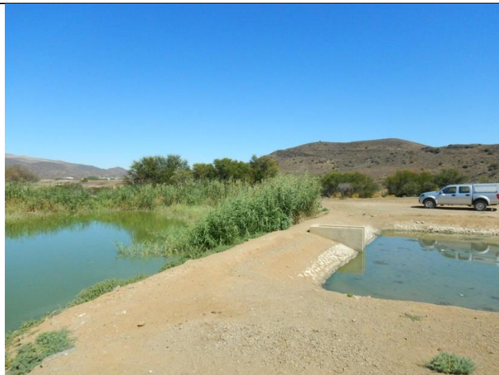
Figure 4: Photo showing the existing facultative pond & existing anaerobic pond, facing North-West