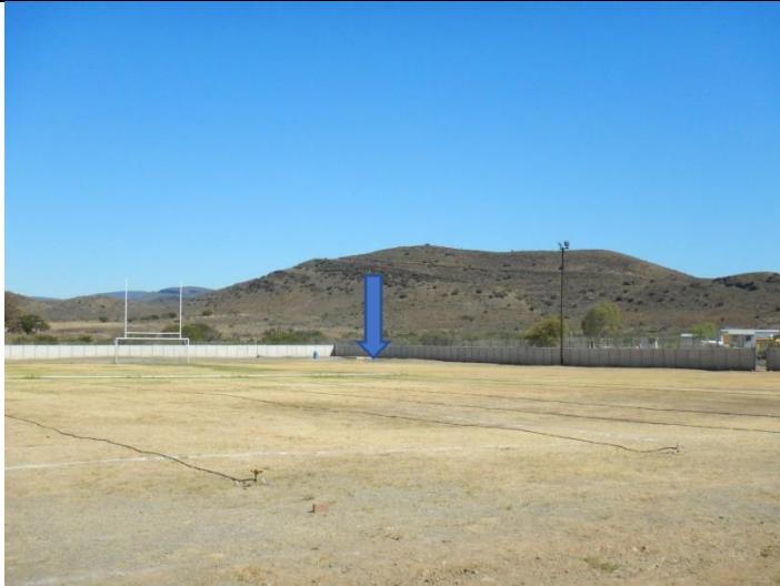
Figure 22: Photo taken on the south portion of the sport field to be irrigated, facing North-East. the arrow indicates the area proposed for the galvanised storage dam.