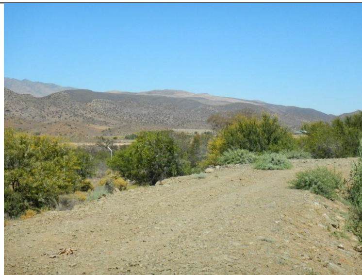
Figure 17: Photo showing the area considered for proposed pipeline route B (not preferred) on private land