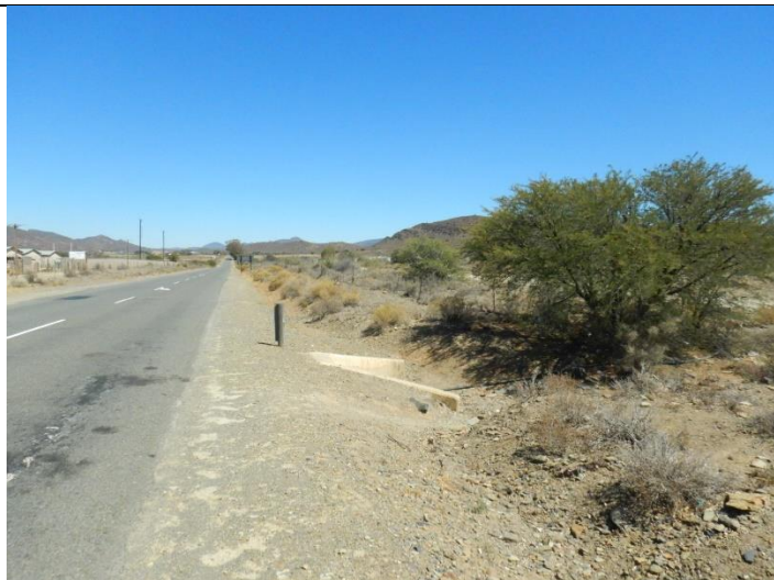
Figure 14: Photo showing the culvert (northern side of the N12). it is proposed that the pipeline route (Alternative A) cross the N12 through this culvert