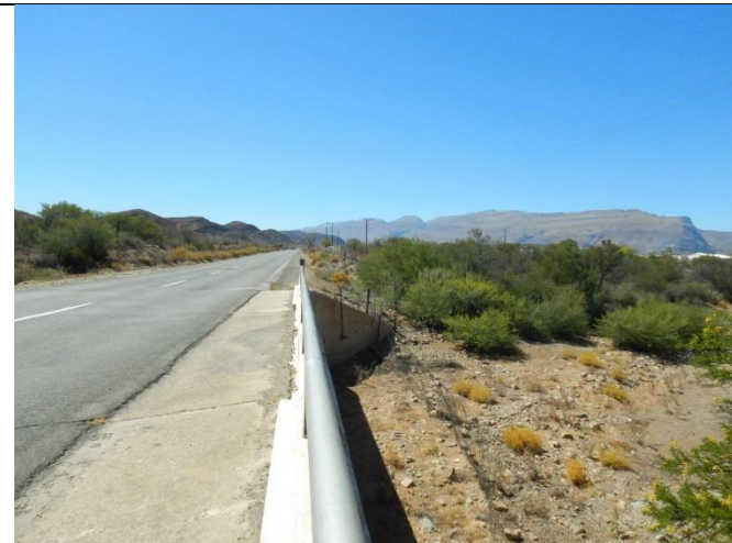
Figure 25: Photo showing proposed pipeline route Alternative D to follow the road reserve and attach to the bridge to cross the N12