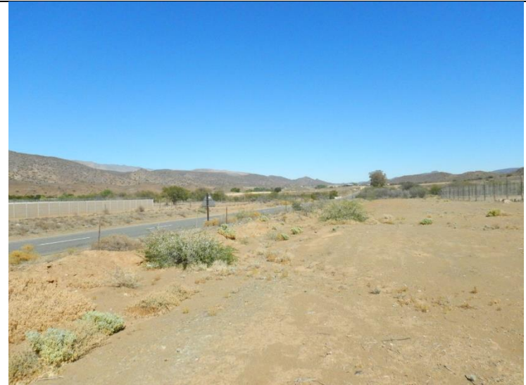
Figure 13: Photo showing the area for pipeline route Alternative A from the to the road maintenance camp to the culvert