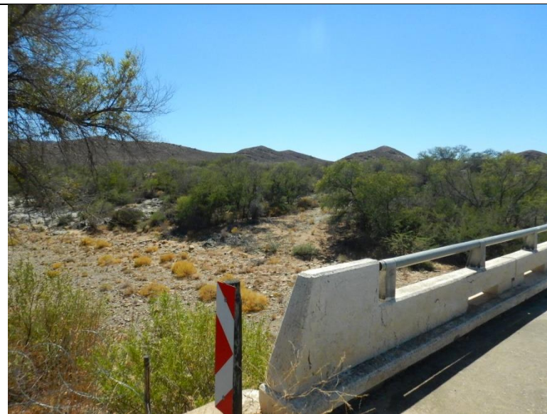
Figure 19: Photo showing the bridge proposed pipeline route B (not preferred) is to cross the Groot river