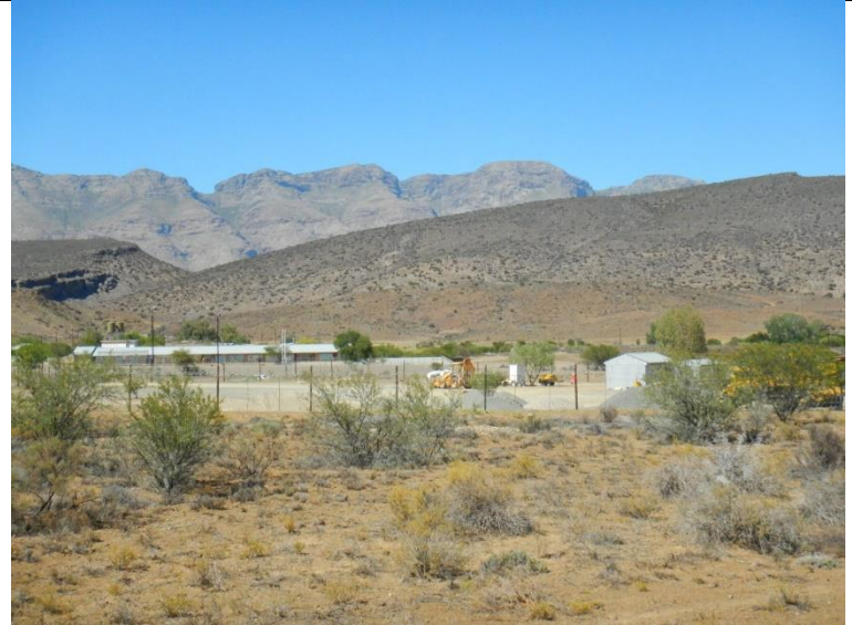
Figure 11: Photo taken facing south,, road maintenance camp in the back ground