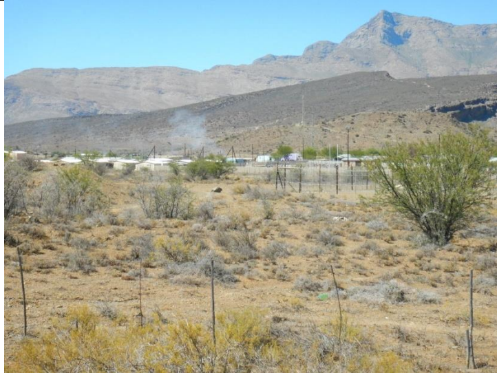
Figure 8: Photo taken facing east, indicating the area proposed for pipeline route Alternative A, C, D.