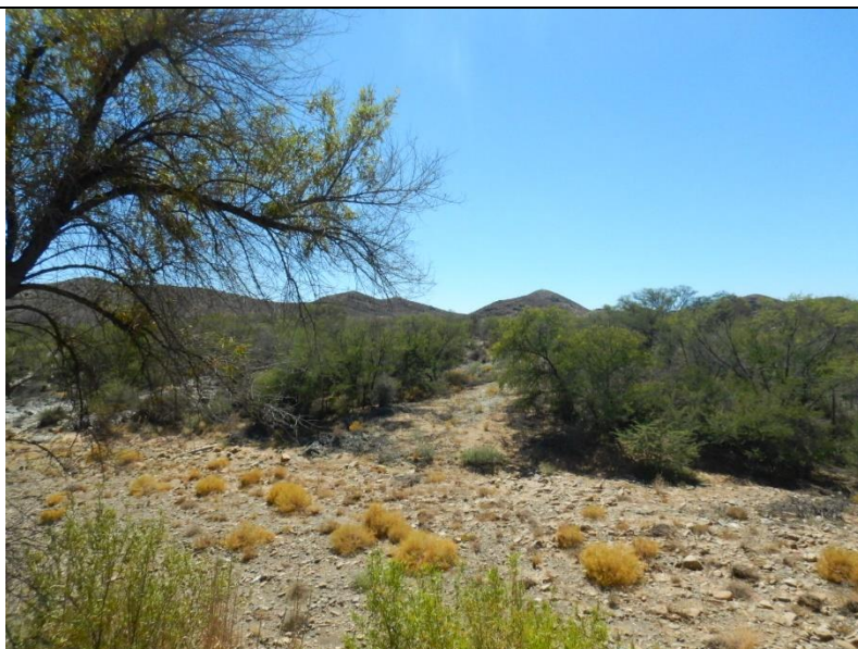
Figure 20: Photo taken standing on the bridge, showing the area considered for proposed pipeline route B (not preferred), impacting riparian vegetation of the Groot river