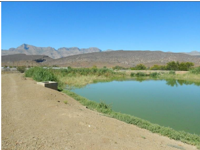
Figure 2: Photo showing the existing large facultative pond, standing relatively in the centre of the site, facing West