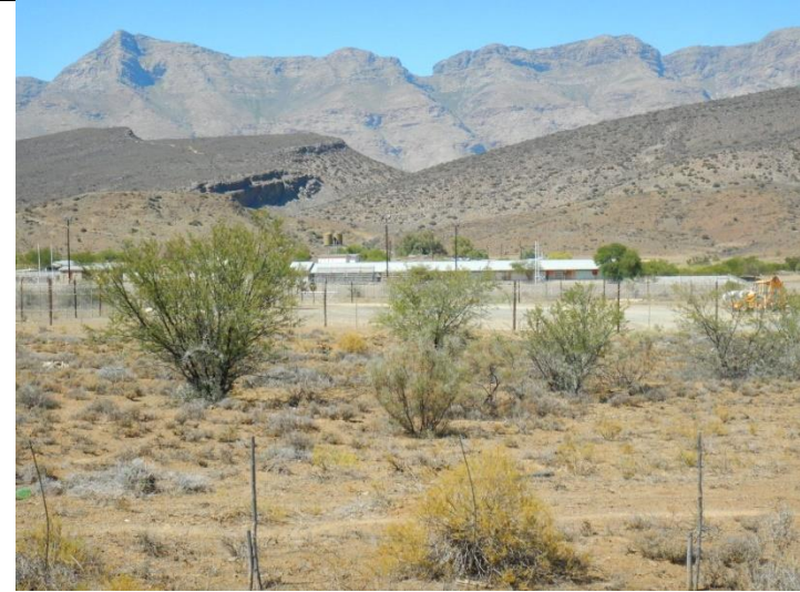
Figure 9: Photo taken facing south-east, indicating the area proposed for pipeline route Alternative A, C, D.