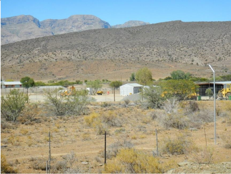
Figure 10: Photo taken facing south, indicating the area proposed for pipeline route Alternative A, C, D, road maintenance camp in the back ground