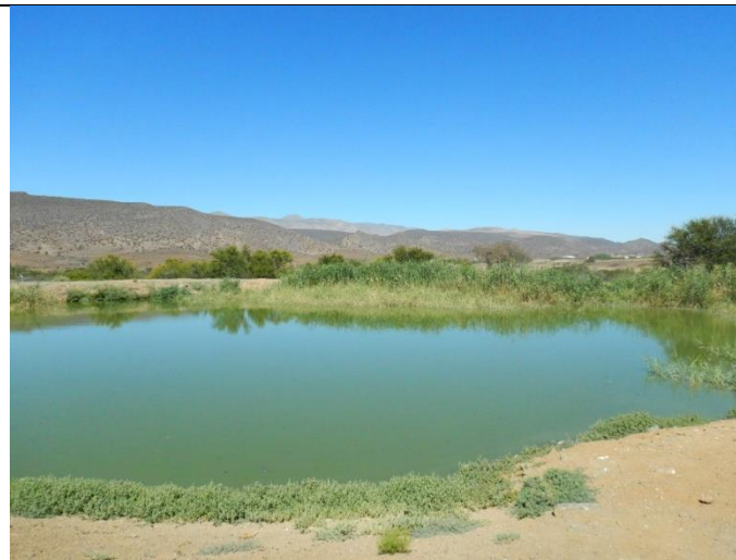
Figure 3: Photo showing the existing large facultative pond, standing relatively in the centre of the site, facing West