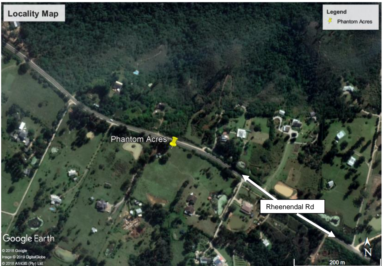
Figure 2: Google Earth aerial view of the site location (yellow placemark).