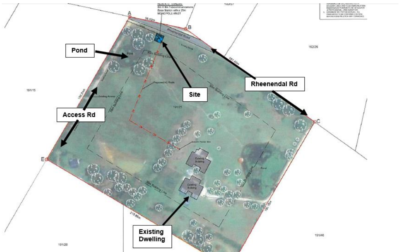
Figure 3: Aerial view of the proposed site. The site is located on the north-western corner of the property.