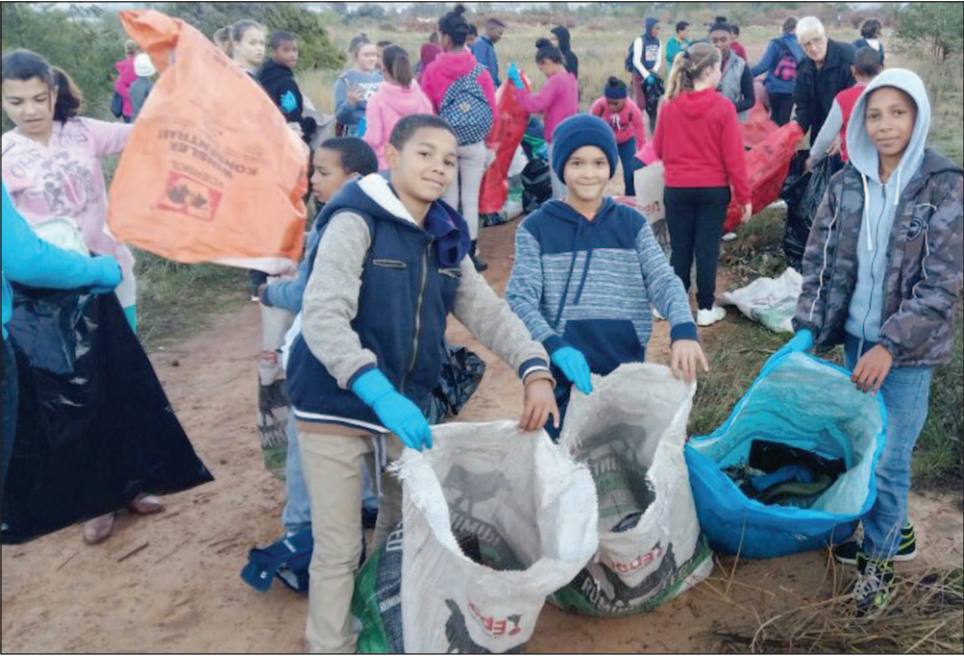
LAERSKOOL Wolseley se leersers het verlede week ingesprong en die veldjie langs die dorp skoongemaak.