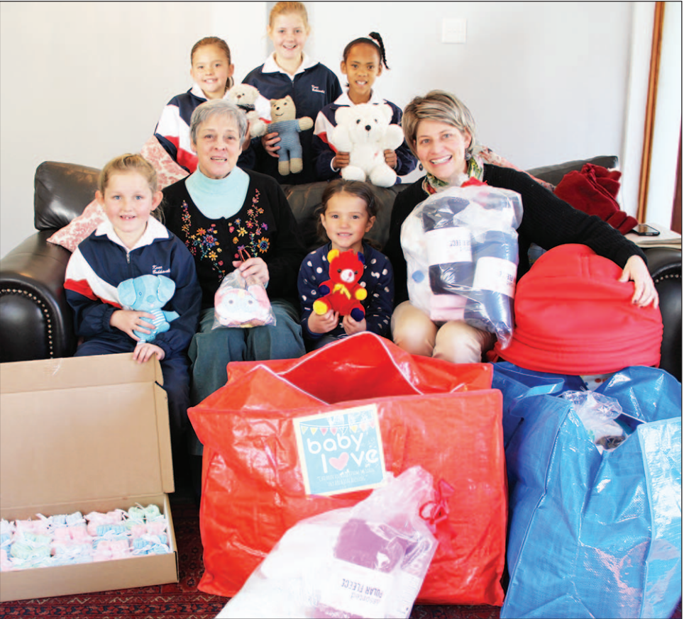
LAERSKOOL Koue Bokkeveld ondersteun die Baby Love projek van Ceres. Dit vorm deel van die skool se karakterbouprogram - omgee. Vyf leersers oorhandig al die produkte en kler wat deur die skool ingesamel is. Die skool bedank graag almal wat 'n bydrae gelewer het.