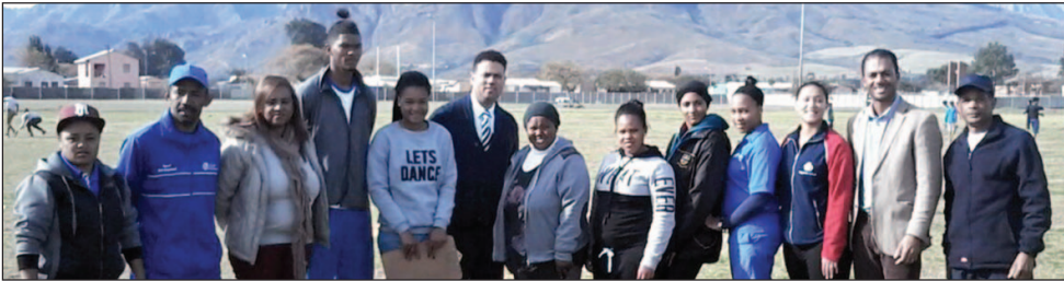
MOD Wolseley in samewerking met verskeie rolspelers soos FMNV, Badisa, KWDM, DPLG en WKOD bied vanaf 3-14 Julie 'n skole vakansieprogram aan op Wolseley sportgronde. Programme begin elke dag vanaf 10:00 tot 14:00.