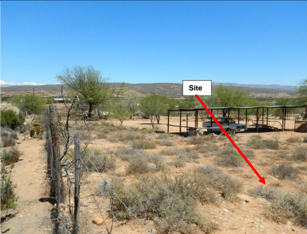
Figure 2: A view of the proposed site (red arrow) as viewed from the fence along Bond Street, looking in a south-western direction.