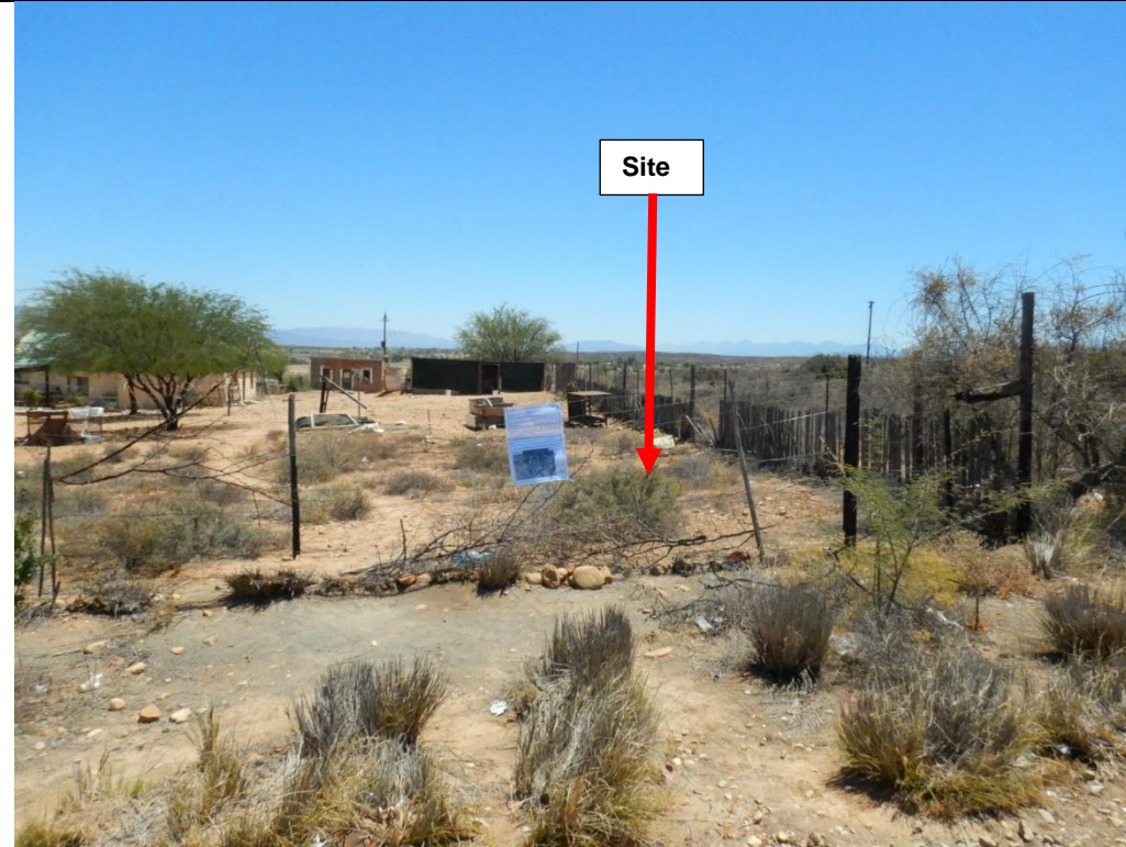
Figure 1: A view of the proposed site (red arrow) as viewed from Bond Street, looking in a western direction.