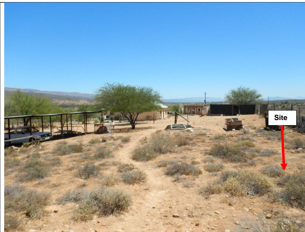
Figure 4: A view of the proposed site (red arrow) as viewed from the fence along Bond Street, looking in a western direction.