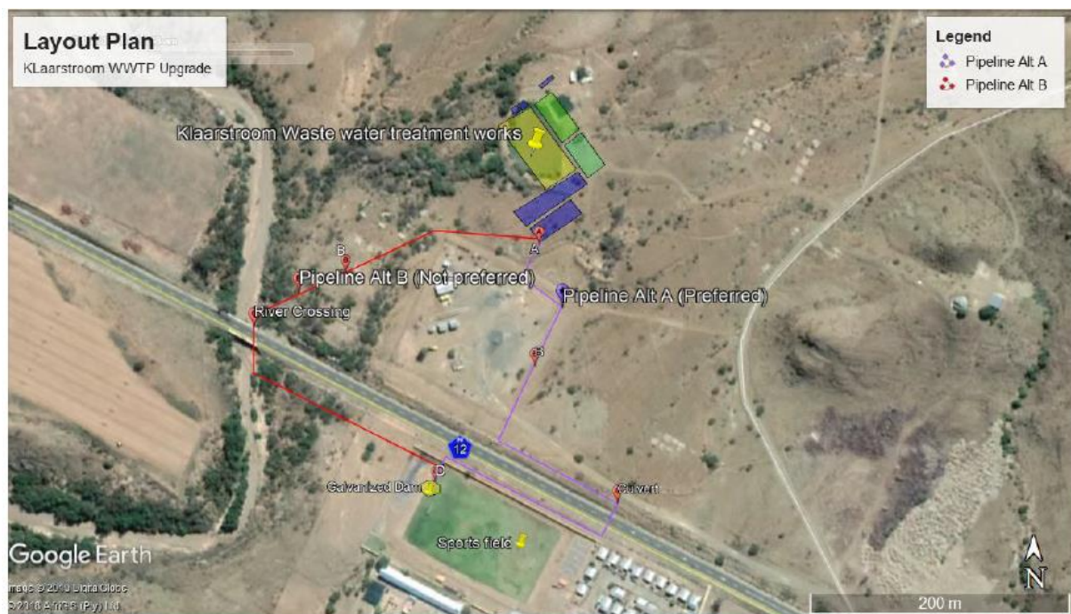
Figure 1: A map supplied by the consultant illustrating the extent of the proposed works.

The village of Klaarstroom is fairly well serviced in terms of water, sewage, electricity and roads. The wastewater is collected at a central pump station in the village and then pumped through a 100mm diameter rising main over a distance of 800m to the wastewater treatment plant. The current disposal of effluent takes place by means of overhead sprinklers discharging the treated effluent onto the veld north of the existing treatment plant. Any drainage from this area will eventually end up in the Groot River south of Klaarstroom.