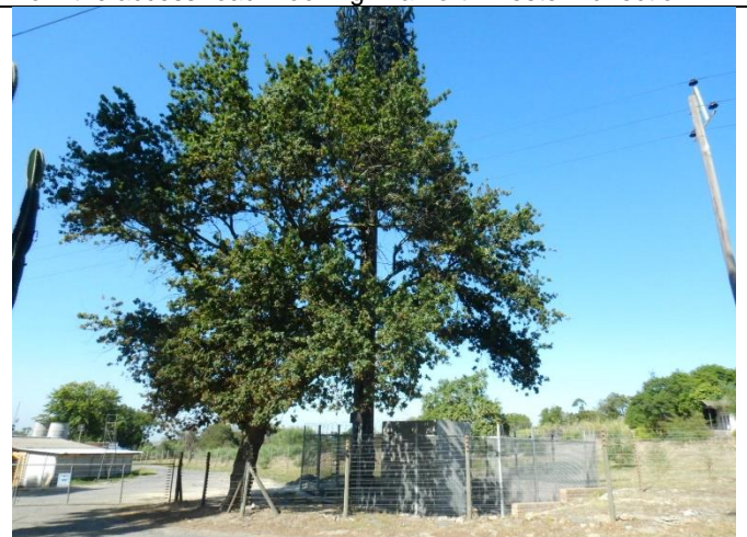
Figure 6: A view of the telecommunication base station as viewed from the access road. Looking in a western direction.