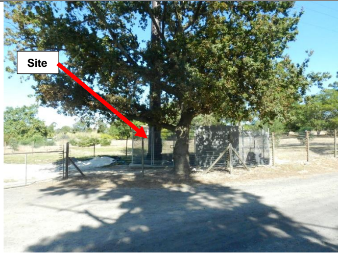
Figure 1: A view of the site (red arrow) as viewed from the access road. Looking in a north-western direction.