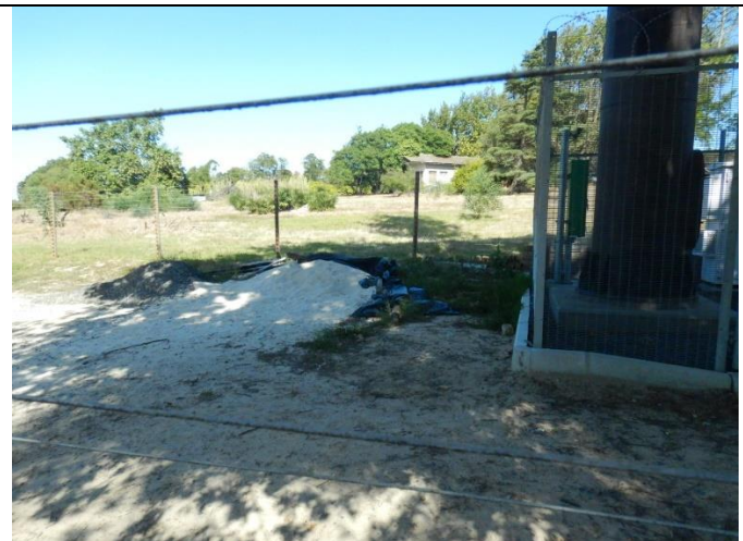
Figure 4: A view of the telecommunication base station as viewed from the access road. Looking in a north-western direction.