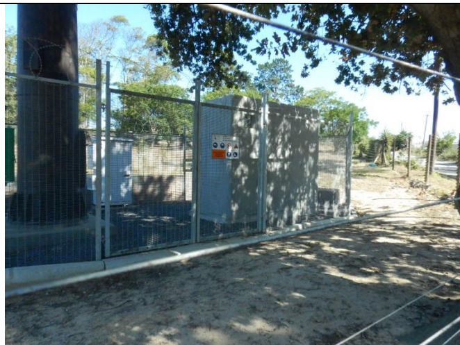
Figure 3: A view of the telecommunication base station as viewed from the access road. Looking in a northern direction.