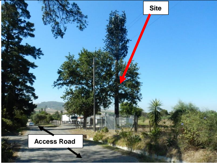
Figure 7: A view of the access road and the proposed site. Looking in a southern direction.