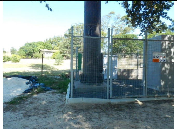
Figure 2: A view of the telecommunication base station as viewed from the access road. Looking in a north-western direction.