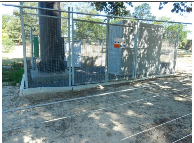
Figure 5: A view of the telecommunication base station as viewed from the access road. Looking in a northern direction.