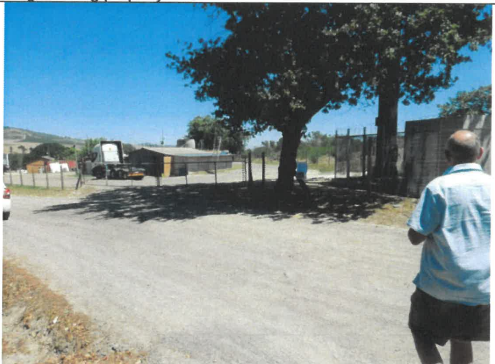
Figure 26: Maildrops done at House immediately west of the site; neighbouring property.