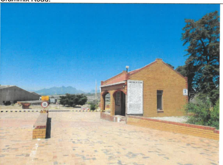
Figure 16: Maildrops done at Crammix Bricks. Given to site manager and workers.