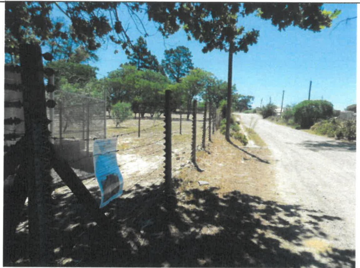
Figure 2: A2 site poster placed against the fence at the site. Looking north towards the site and access road.