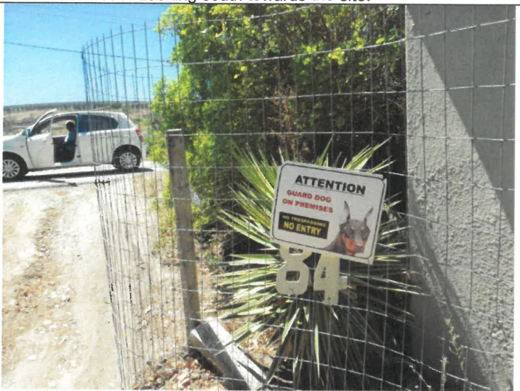
Figure 14: Maildrop at 84 Crammix Road. Looking north towards Crammix Road.