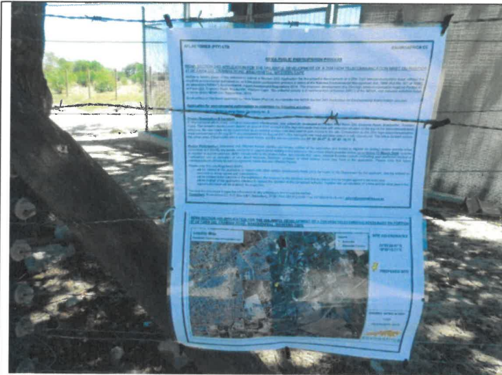
Figure 1: A2 site poster placed against the fence at the site. Looking west towards the site.