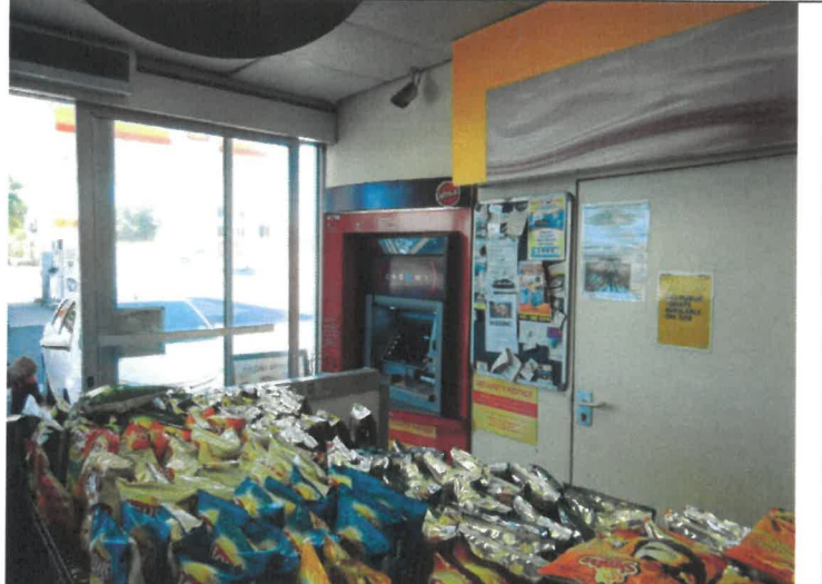
Figure 20: A2 Poster placed against the notice board at Shell Garage (Kruisfontein), located along Kruis Road.