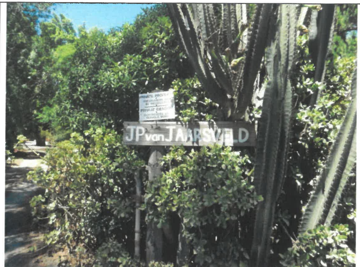
Figure 18: Maildrops done at farm JP van Jaarsveld, located immediately south of the site, along the access road.