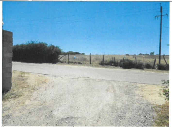
Figure 8: A3 poster placed against the fence at the corner of 11 Crammix Road and Limani. Looking from Limani towards Crammix Road. Looking north-west.