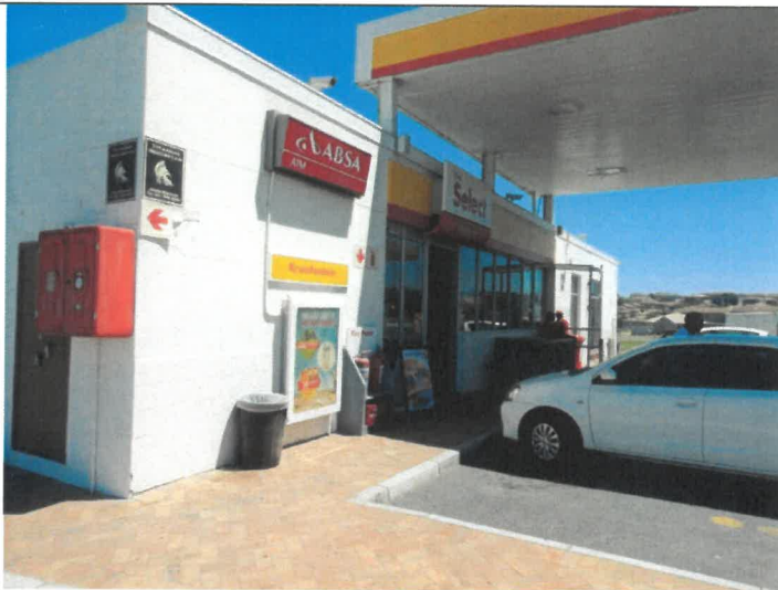
Figure 19: A2 Poster placed against the notice board at Shell Garage (Kruisfontein), located along Kruis Road.