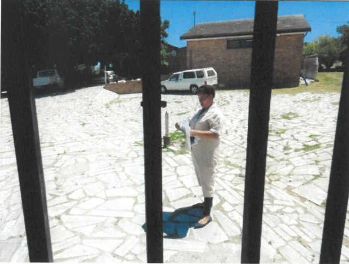
Figure 25: Figure 20: Maildrops done at House immediately west of the site; neighbouring property.