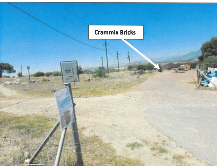
Figure 9: A3 poster placed against the fence along Crammix Road & Crammix Brick Entrance. Looking towards the site and access road. Looking east.