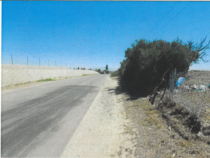
Figure 5: A3 poster placed against the fence at the corner of 11 Crammix Road and Limani. Looking from Limani towards Crammix Road. Looking south-west.