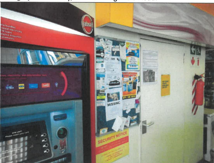
Figure 21: A2 Poster placed against the notice board at Shell Garage (Kruisfontein), located along Kruis Road.