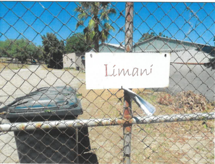
Figure 27: Maildrops done at farm Limani.