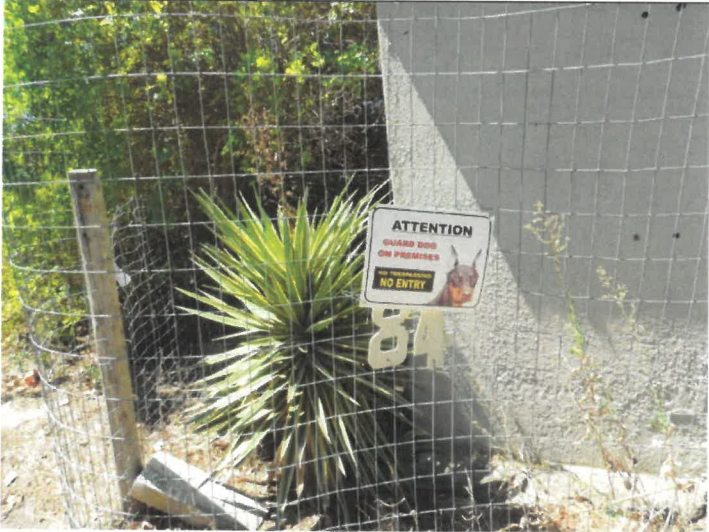
Figure 13: Maildrop at 84 Crammix Road.