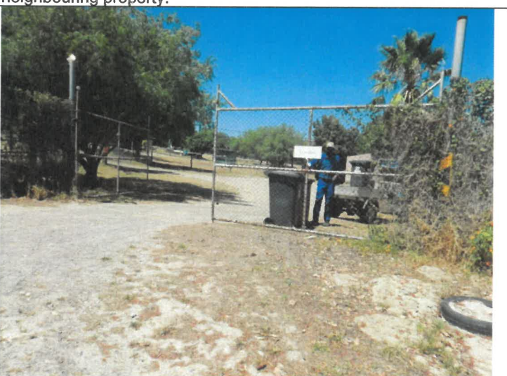
Figure 28: Maildrops done at farm Limani.