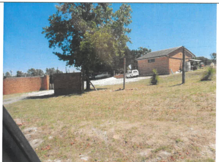
Figure 24: Maildrops done at House immediately west of the site; neighbouring property.