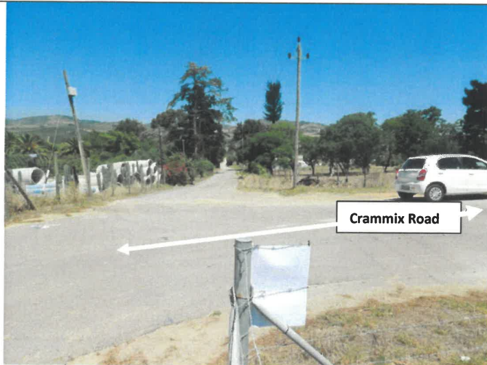
Figure 11: A3 poster placed against the fence along Crammix Road & Crammix Brick Entrance. Looking towards the site and access road. Looking south towards the site.