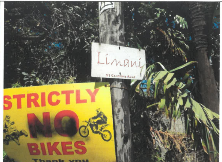
Figure 6: A3 poster given to communications officer at Drakenstein Municipality to be placed on notice board.