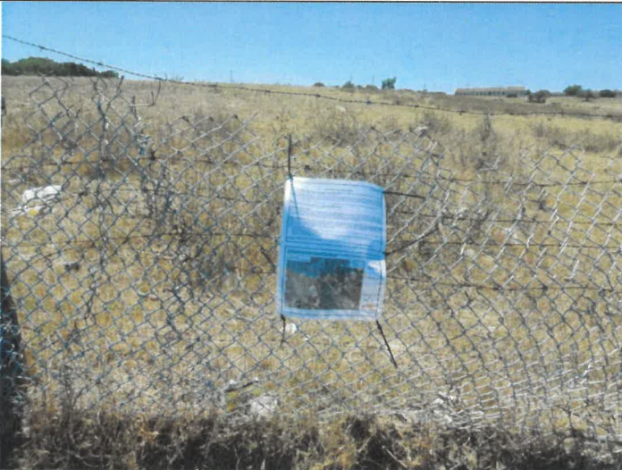
Figure 7: A3 poster placed against the fence at the corner of 11 Crammix Road and Limani. Looking North.