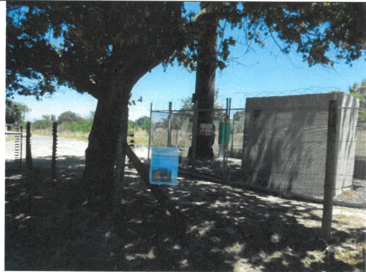
Figure 3: A2 site poster placed against the fence at the site. Looking west towards the site.