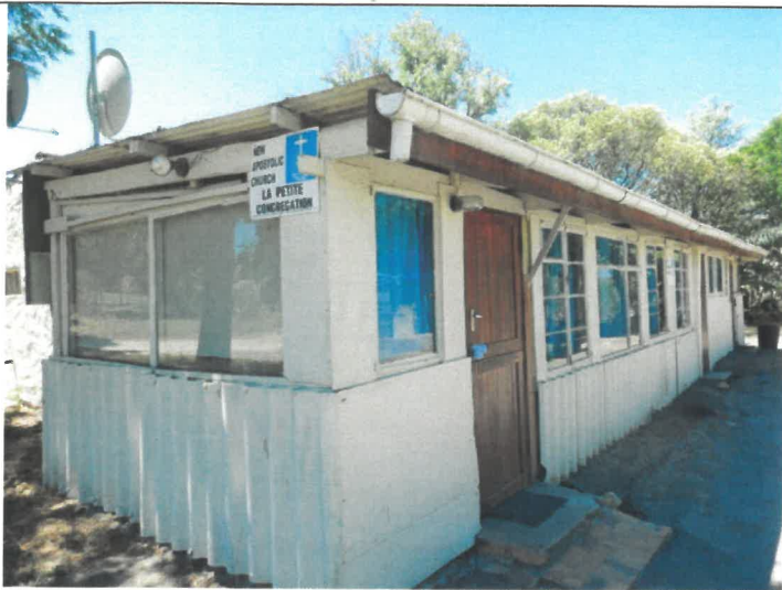
Figure 23: Maildrops done at New Apostolic Church (La Petite Congregation), located south-east of the proposed site.