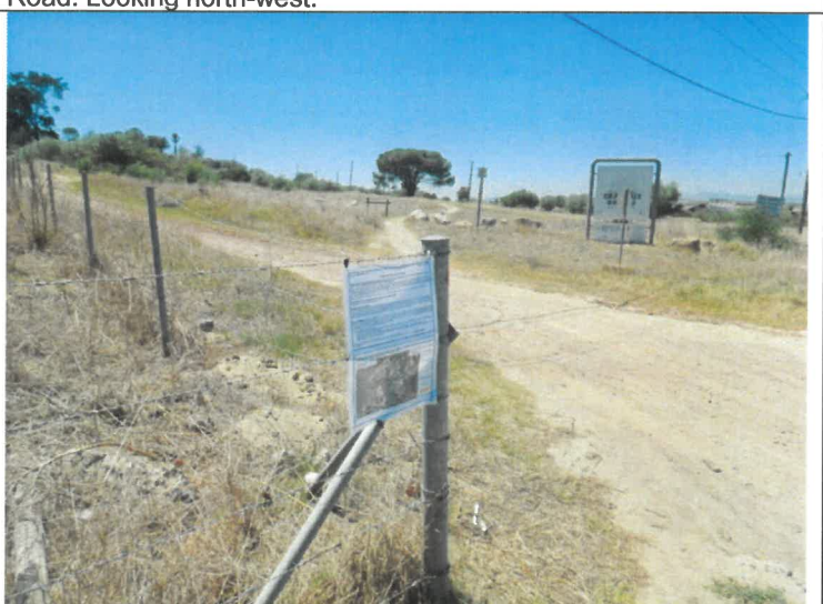
Figure 10: A3 poster placed against the fence along Crammix Road & Crammix Brick Entrance. Looking towards the site and access road. Looking north-east.