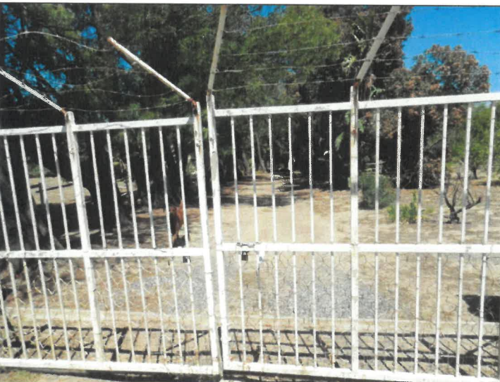
Figure 15: Maildrops done at adjacent Smallholding, located along Crammix Road.