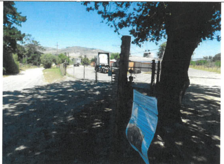
Figure 4: A2 site poster placed against the fence at the site. Looking south-west towards the site and access road.