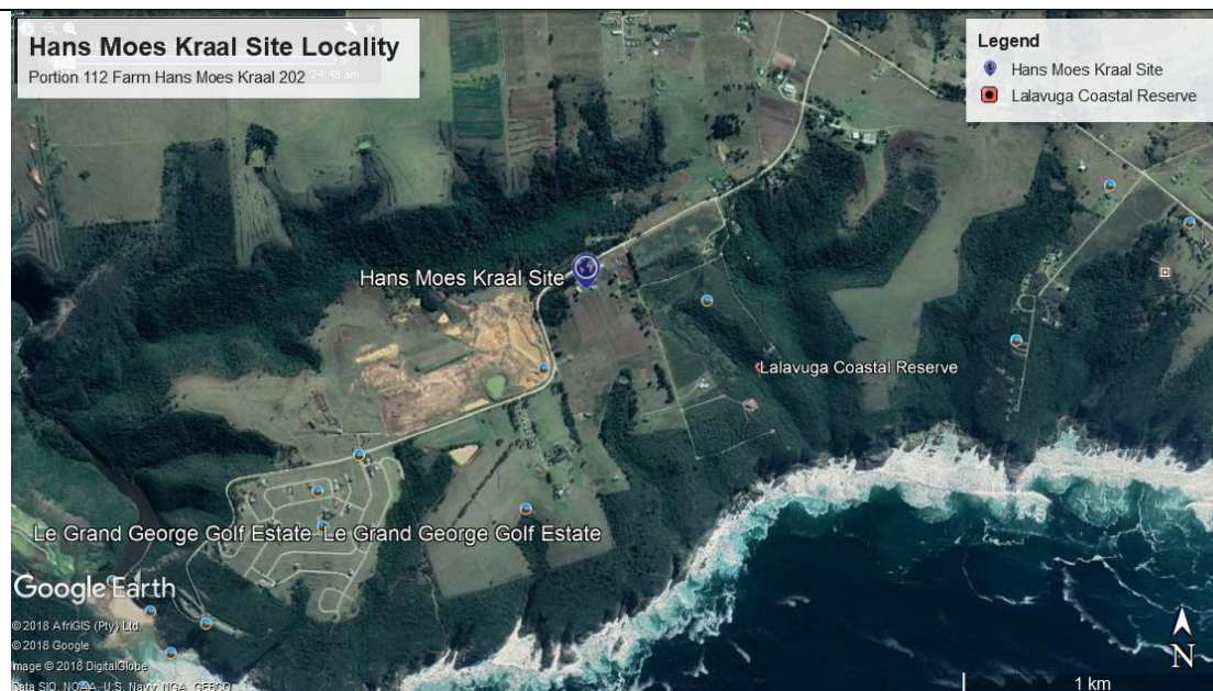
Figure 3: Map indicating the proposed site and surrounds