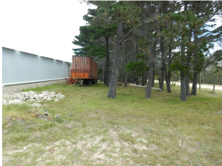
Figure 1: Photograph indicating that the site selected is disturbed and dominated by grass species

According to the vegetation map ( Appendix D ) the vegetation that would have been present on the site is Groot Brak Dune Strandveld. This type of vegetation is classified as Endangered in the Western Cape in terms of NEMBA National list of Ecosystems that are threatened and in need of protection . The site is transformed and disturbed due to previous developments with no natural habitat remaining. Refer to site photos ( Appendix C ). Tall Pine Trees are also located on the site.