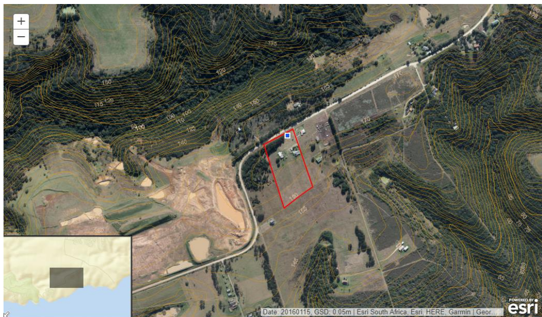
Figure 4: Topographical Map indicating the contours of the chosen site\

The property directly east of the site also belongs to the land owner. The property to the west, south and north is also zoned agriculture. Lalavuge Coastal Reserve is located further East of the property with Le Grand George Golf Estate to the West. Surrounding agricultural activities includes planted pastures and the sea is located more than 1km south of the property. Please refer to Appendix A for Locality Maps and Appendix D for Crop census map. Figure 4 is a topographical map indicating the contours of the proposed site.