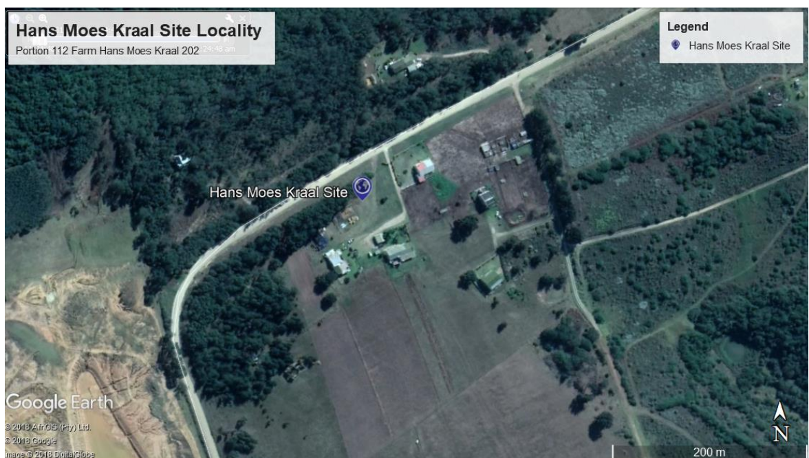
Figure 2: Locality Map

The Visual Impact Assessment was updated ( Appendix G2 ) to investigate the visual significance in a scenario where the cluster of trees adjoining the proposed mast site will be removed and retained. According to the VIA, the scenario where the trees are retained provide the lowest visual impact as the trees provide the best visual absorption, regardless of the mast type. The removal of the trees will have a medium-high visual impact. Please refer to the VIA ( Appendix G2.2 ) report for more detail as well as illustrations. Alternative mast designs were also investigated and are discussed in Section E of the BAR.