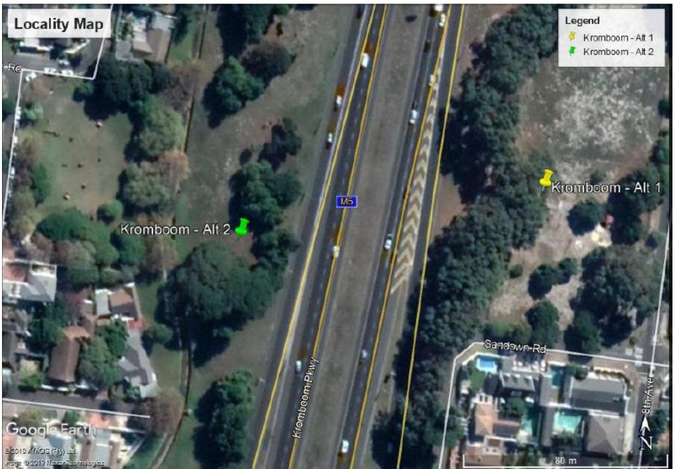
Figure 2: Google Earth aerial view of the site location (green placemark).